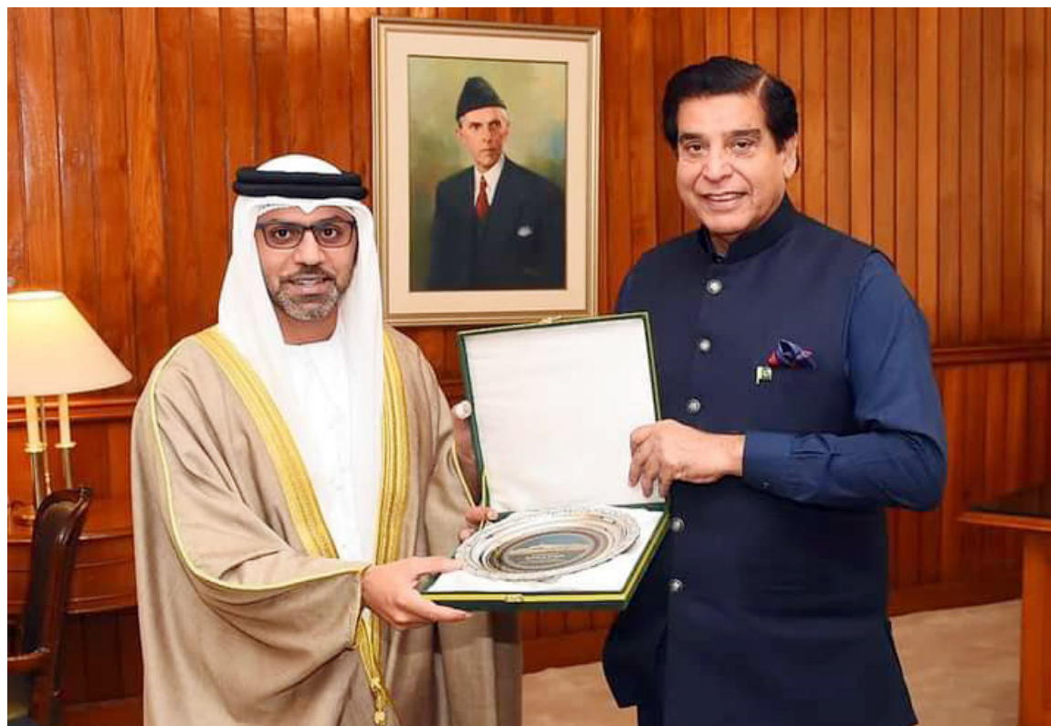
ISLAMABAD: Hamad Obaid Alzaabi, UAE ambassador in Islamabad, meets Raja Pervaiz Ashraf, Speaker of the National Assembly, and discusses the exchange of visits and experiences at the parliamentary level and ways to enhance bilateral cooperation between the two countries. — DNA

For Balochistan, work will commence on establishing smart police stations along with Police Facilitation centers. This workplan also includes establishment of smart classrooms in Balochistan Judicial Academy and Police Training College, Quetta. Prison Management Information System (PMIS) is also planned to be developed and implemented in the prison facilities of Balochistan.