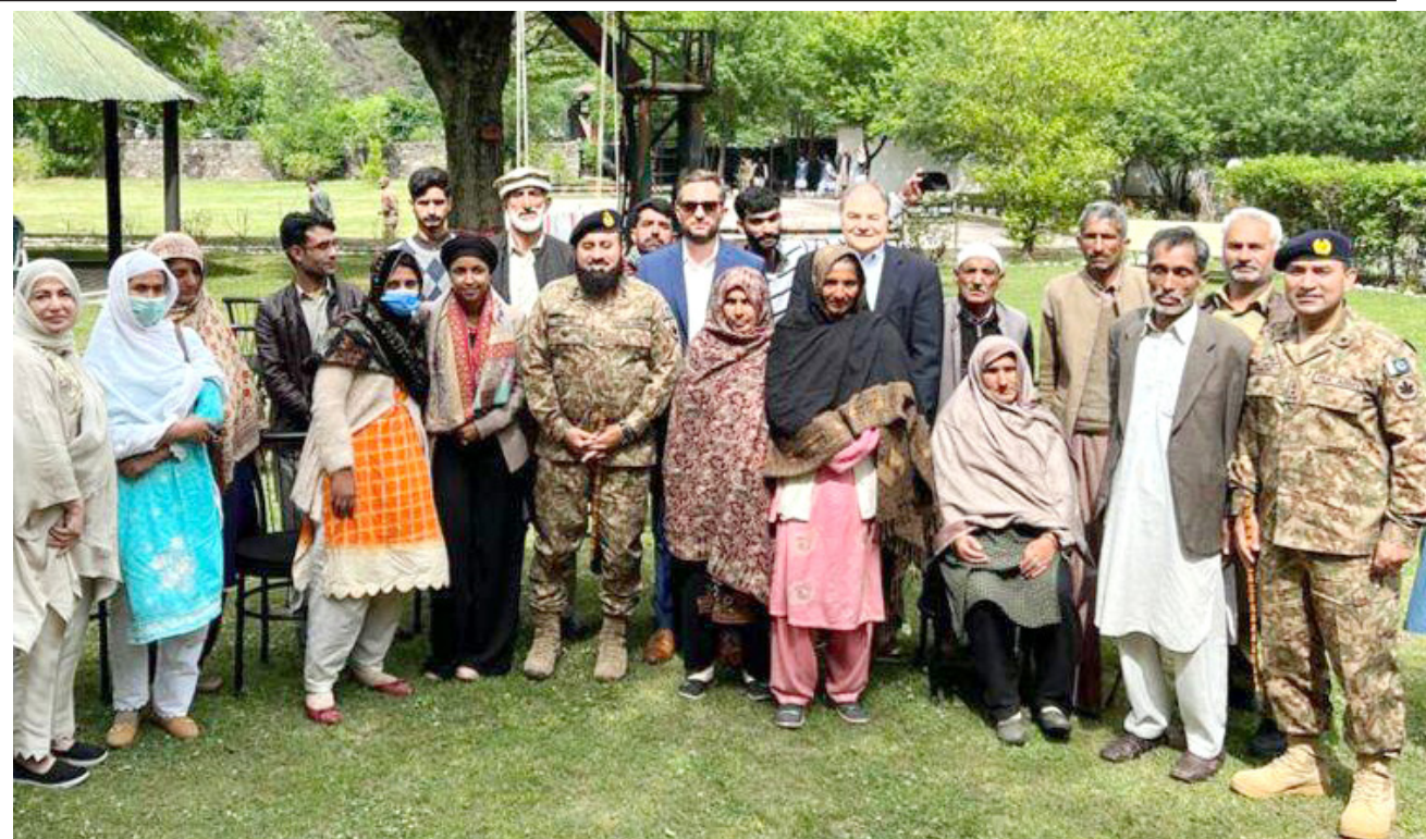
MUZAFFARABAD: US Congresswoman Ilhan Omar visits the Line of Control, Azad Jammu and Kashmir.

RAWALPINDI: General Lucky Eluonye Onyenuchea Leo Irabor, Chief of Defence Staff Nigerian Armed Forces, who is on official visit to Pakistan called on General Nadeem Raza, Chairman Joint Chiefs of Staff Committee at Joint Staff Headquarters, Rawalpindi, today. Matters of bilateral defence cooperation including security, military exchanges, training and prevailing regional environment were discussed during the meeting. Chief of Defence Staff Nigeria said that these mutually beneficial interactions have deepened the bilateral defence relationship, strengthened the cooperation and enhanced mutual understanding between the two armies. Chairman JCSC reaffirmed the strong and long-standing bilateral defence relationship between Nigeria and Pakistan. The visiting dignitary expressed his complete satisfaction on the performance JF-17 fighter aircraft, inducted from Pakistan. He also said that the JF-17 aircraft, with its unique fighting capabilities, would prove to be a potent platform in addressing the security requirements of Nigeria.