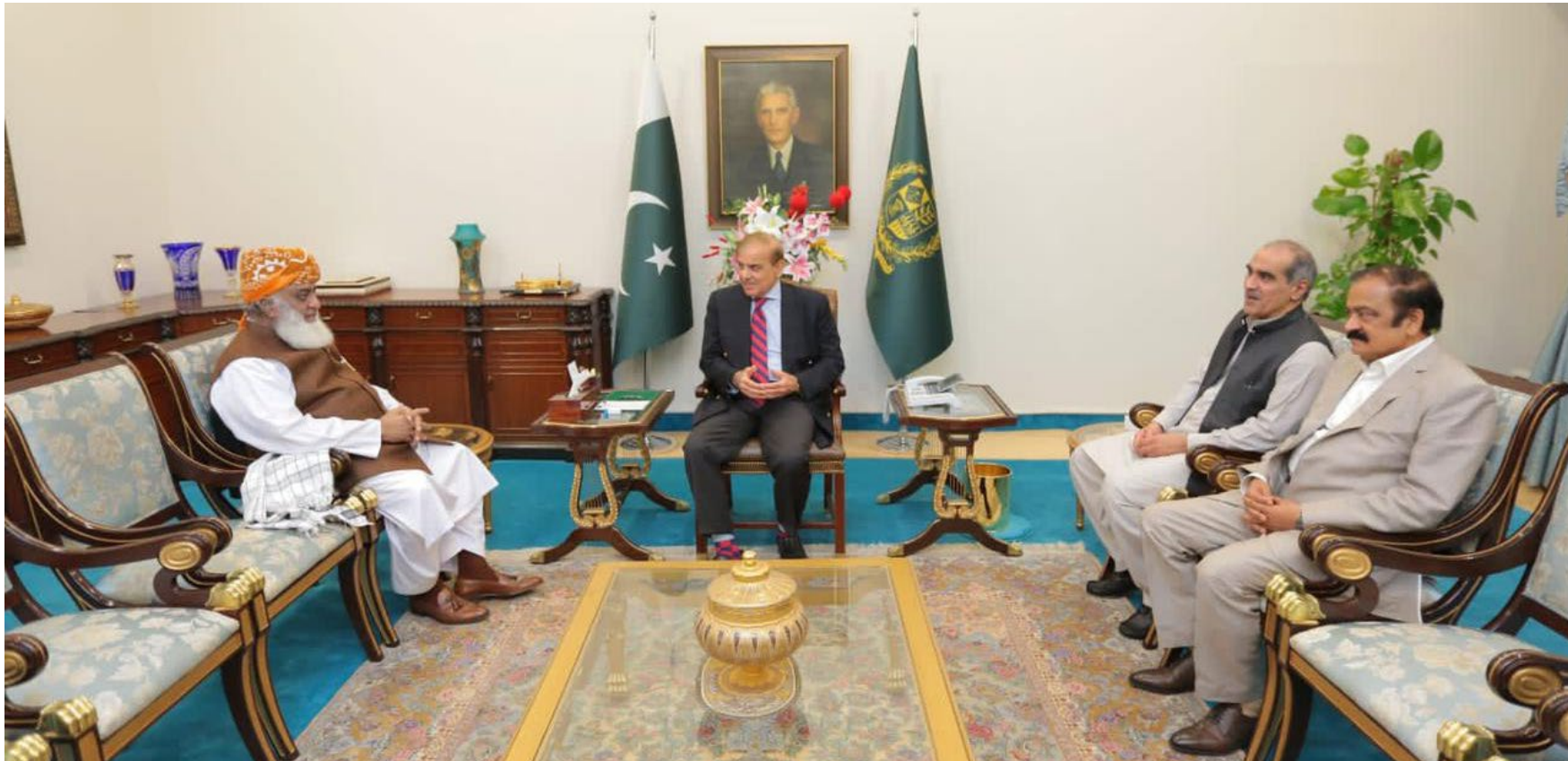
ISLAMABAD: JUI-F Chief Molana Fazl-ur-Rehman calls on Prime Minister Shehbaz Sharif.