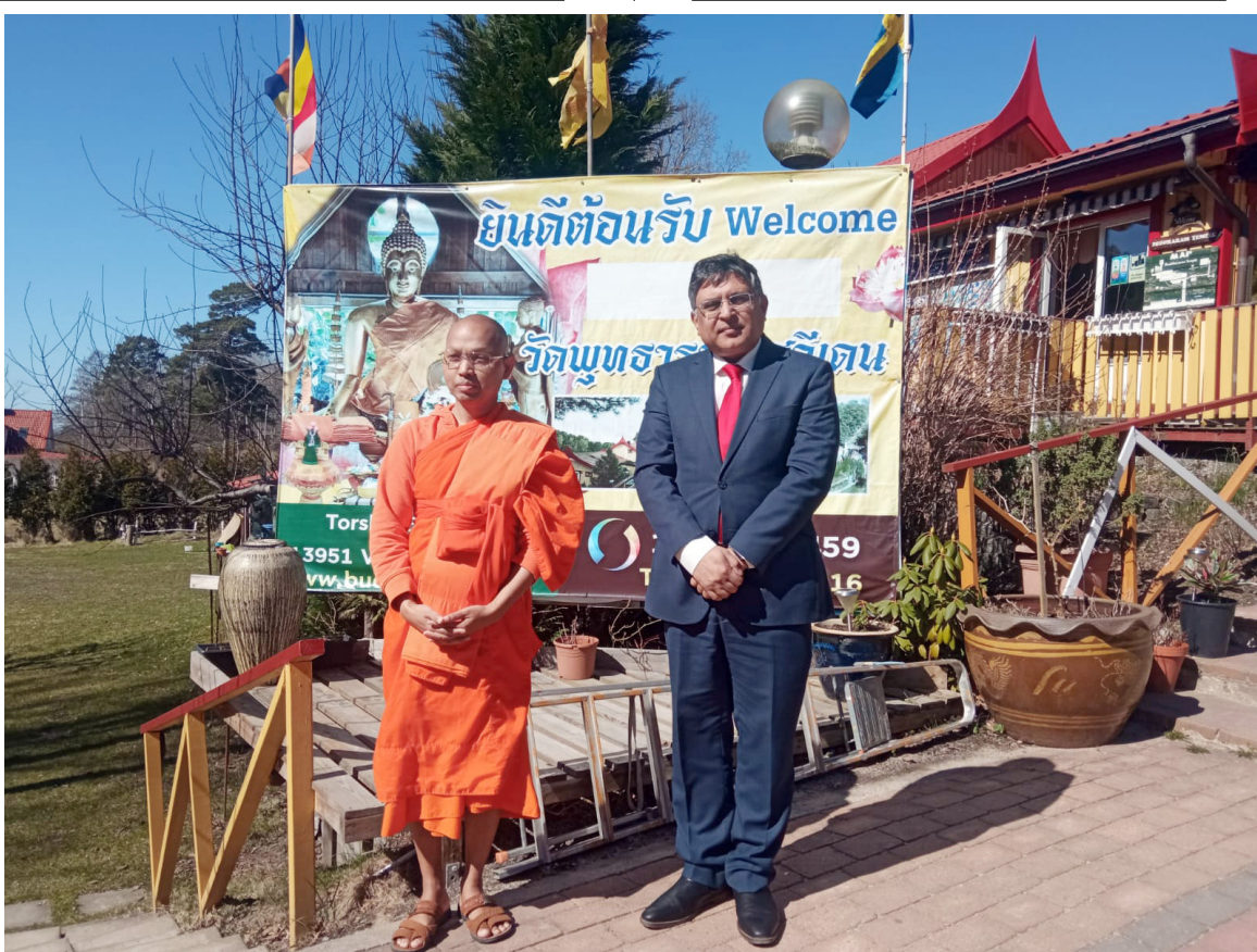
STOCKHOLM: Pakistan ambassador to Sweden Zahoor Ahmed visits the Buddharama Temple in Stockholm. He was warmly welcomed by Monk Phramaha Boonthin Taositi.