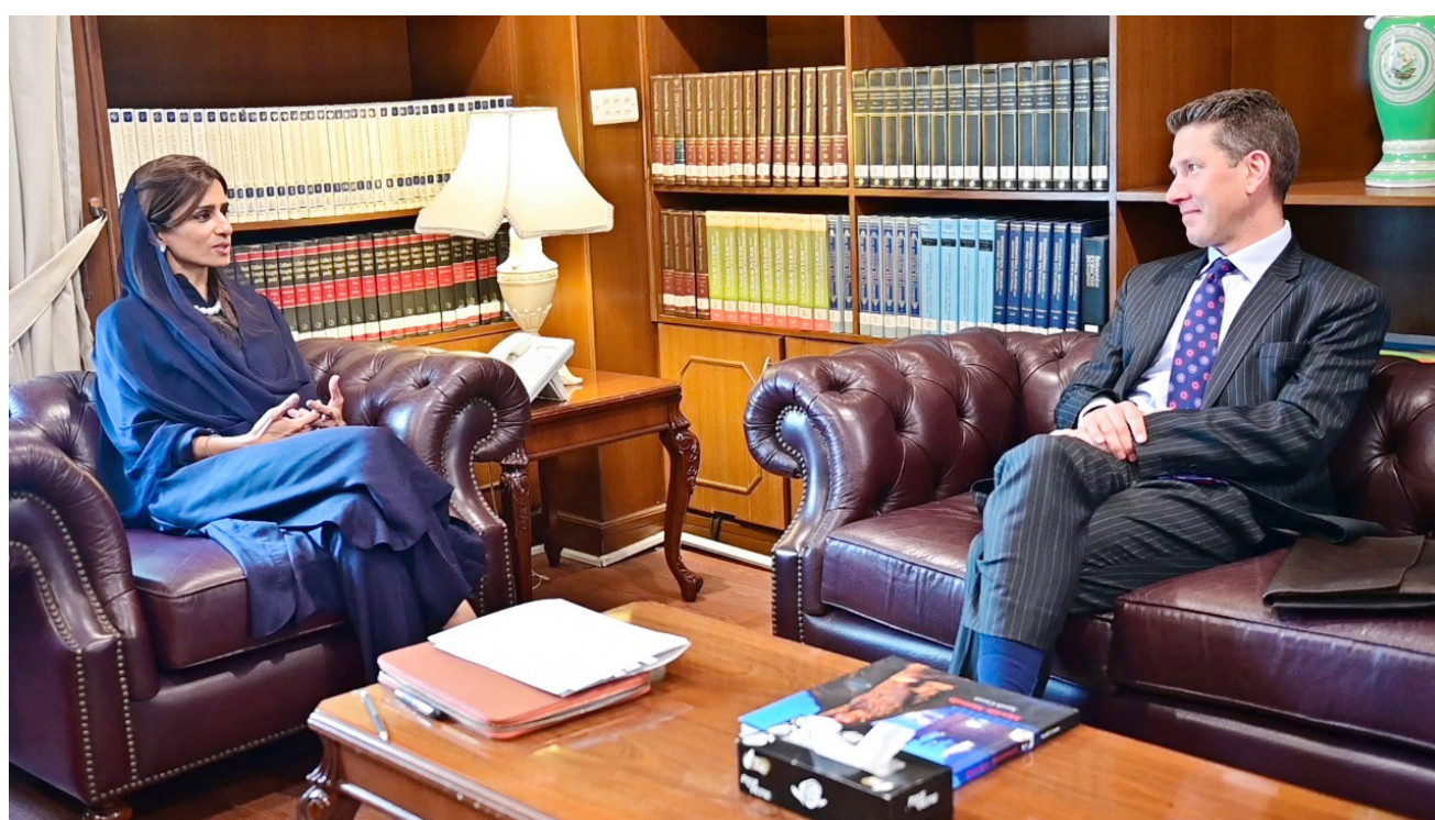
ISLAMABAD: The British High Commissioner Dr. Christian Turner calls on Minister of State for Foreign Affairs Hina Rabbani Khar. - DNA

On the prime minister's directives, an amount of Rs 10 million was released for the heirs of the deceased as well as those injured in the incident. The prime minister instructed the district government to extend all possible support till rehabilitation of the victim families. - APP