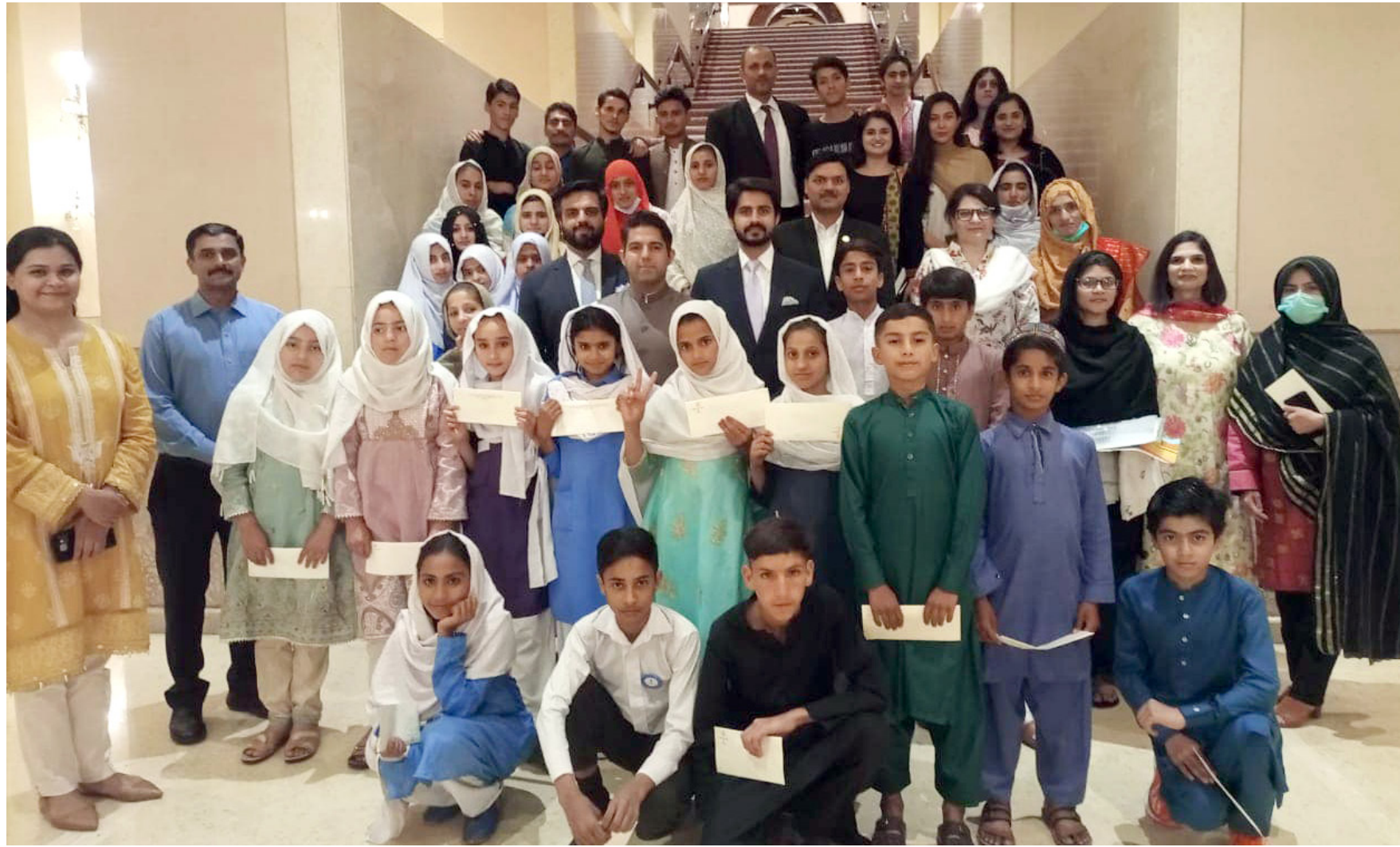
ISLAMABAD: Children of Mashal School, Islamabad posing for a picture during iftar dinner at the Islamabad Serena Hotel.