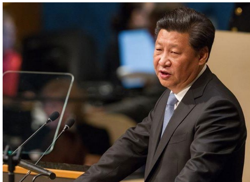
living in an indivisible security community. It has been proven time and again that the Cold War mentality would only wreck the

BEIJING: The Chinese president on Thursday proposed a "global security initiative" to promote "security for all" in the world. "We need to work together to maintain peace and stability in the world," Xi Jinping told Boao Forum for Asia Annual Conference 2022. "Stability brings a country prosperity while instability leads a country to poverty," said Xi, quoting a Chinese proverb to emphasize his initiative. The Chinese proposal comes amid Russia's war on Ukraine which began on Feb. 24 and during which nearly 15,000 people have been killed. More than 5 million refugees have fled Ukraine since the war erupted two months ago, according to the UN. It has also led to global instability in energy supplies as western nations mounted punishing sanctions on Russia to force it to halt its military operations against its southern neighbor. China has, so far, avoided condemning Russia over its war on Ukraine. Instead, Beijing has insisted on facilitating dialogue between Moscow and Kyiv to seek a solution to the conflict. Beijing has called for "solving the root cause" of the conflict while it has opposed the expansion of NATO. However, Xi said security is the "precondition for development." "We humanity are