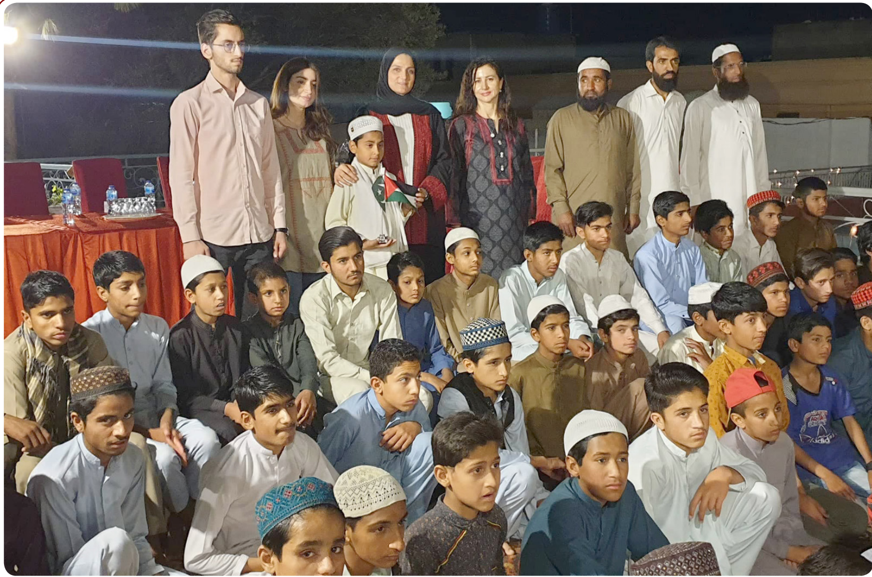
ISLAMABAD: Wife of Ambassador of Palestine hosted iftar dinner for the orphan children. Wife of the Turkish ambassador also seen in the picture.