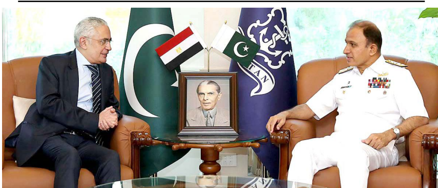
ISLAMABAD: Chief of the Naval Staff Admiral Muhammad Khan Niazi exchanging views with Tarek Mohamed Dahroug Ambassador of Arab Republic of Egypt to Pakistan. - DNA

ISLAMABAD: The ruling Pakistan People's Party (PPP) in Sindh has decided to include MQM-P into the provincial cabinet. The PPP asked its ally MQM-P to nominate two of its MPs in the Sindh Assembly for their inclusion in the provincial cabinet. In another development, the Sindh government Thursday appointed PPP leader Sharjeel Memon as provincial minister. - DNA