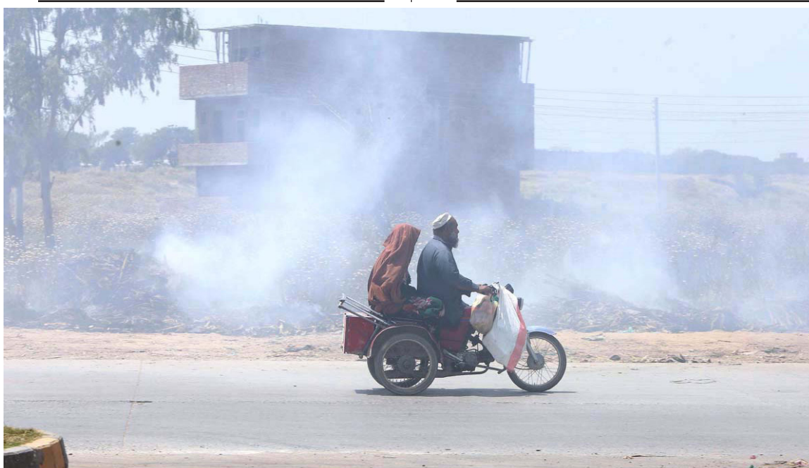
ISLAMABAD: A motorcyclist on the way driving past the smoke emits as rubbish was torched outside Islamabad Fruit and Vegetable market.