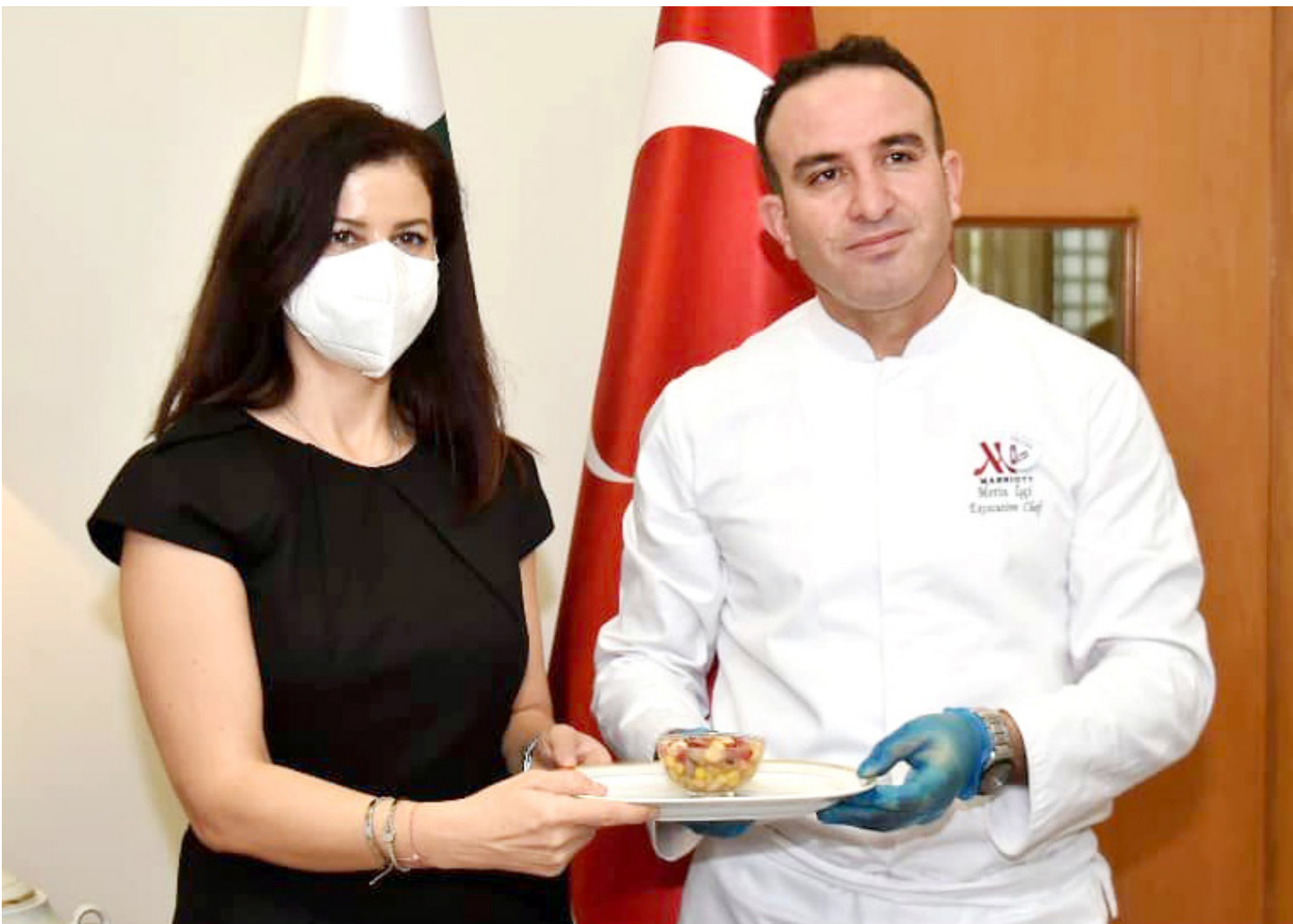
ISLAMABAD: Turkish Chef presents a Turkish delicacy to the wife of the Turkish Ambassador on the occasion of Turkish cuisine week, celebrated at the embassy.