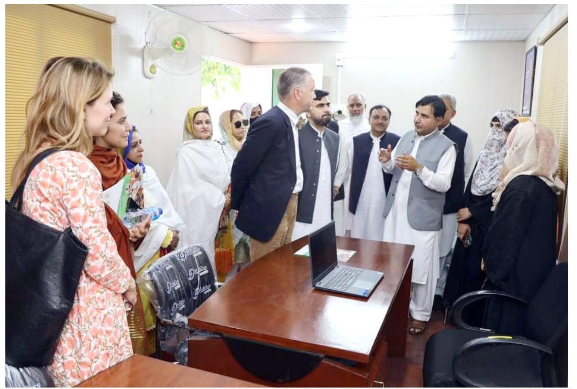
HARIPUR: German ambassador interacts with members of civil society during his recent visit to Haripur.