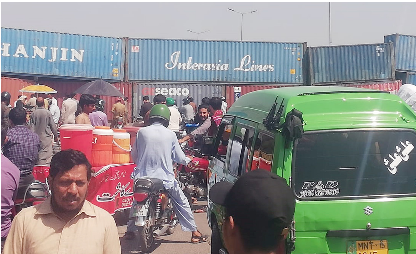
ISLAMABAD: People facing problems in reaching their work places due to road closure because of PTI long march.

Among the air transport services, the exports of passengers services rose by 22.64 percent, from US $ 236.84 million to US $ 290.460 million, whereas the exports of freight services dipped by 0.64 percent, from US $23.260 million to US $ 23.260 million, in addition the export of other air transport services surge by 40.72 percent from US $ 98.140 million to US $ 138.100 million. Meanwhile, the exports of road transport services during the period under review witnessed a decline of 24.51 percent by going down from US $ 14.810 million to US $ 11.180 million during this year, it added. Among the road transport services, the exports of freight services decreased by 74.95 percent, from US $11.060 million to US $ 2.770 million during the fiscal year under review, while the export of postal and courier services also decreased by 18.88 percent, from US $7.520 million to US $6.100m, the data revealed. - APP