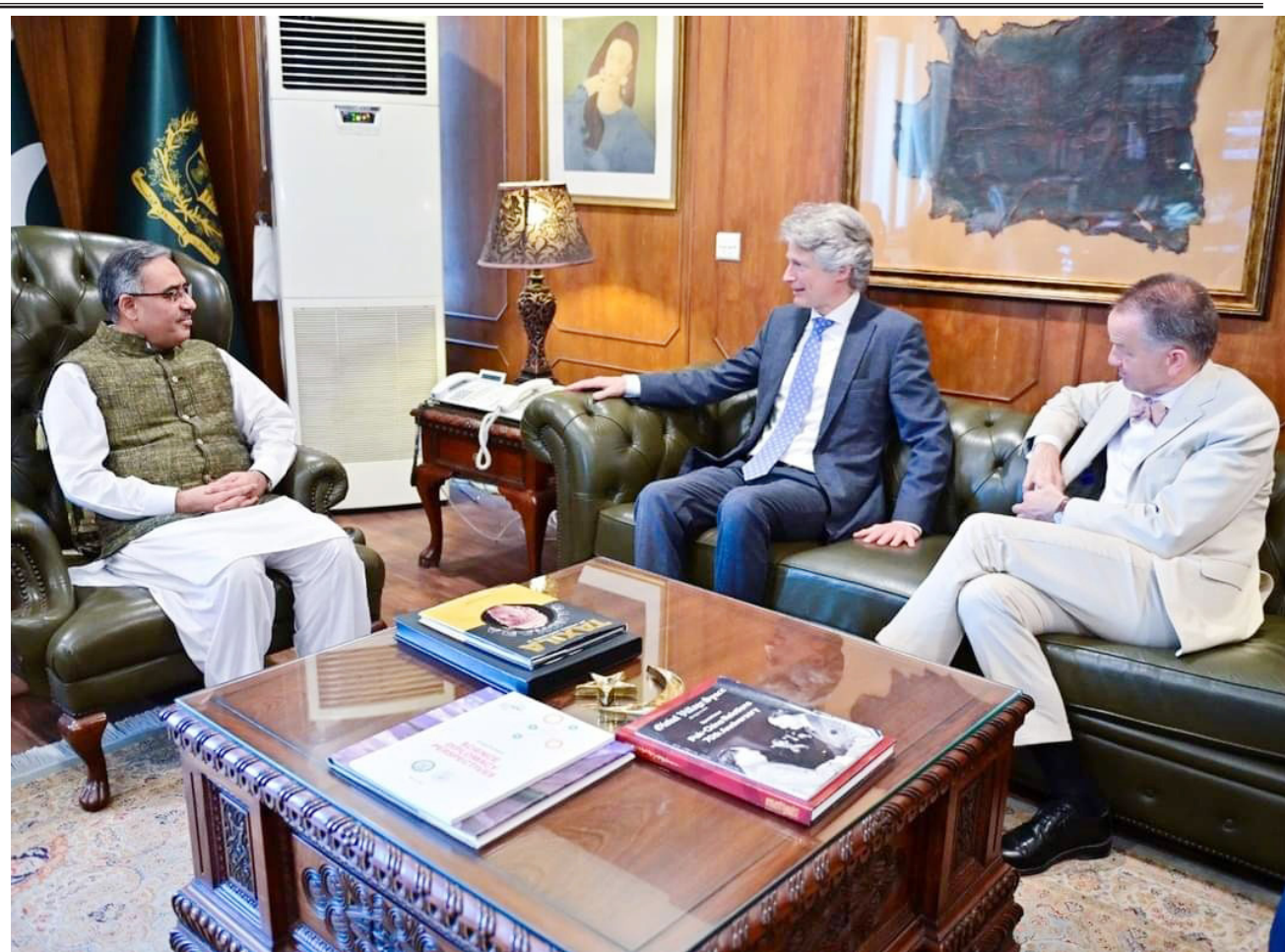
ISLAMABAD: German Special Representative for Afghanistan & Pakistan Dr Jasper Wieck on his day-long visit calls on Foreign Secretary Sohail Mehmood. German Ambassador is also present on the occasion. - DNA

DNA COLOMBO: Sri Lanka's Prime Minister Ranil Wickremesinghe was on Wednesday given the additional responsibility of running the finance ministry as the island nation grapples with its worst-ever economic crisis. The South Asian island nation has suffered months of dire shortages and anti-government protests, with importers unable to finance vital food, fuel and medicines. Wickremesinghe, 73, was sworn in as finance minister after two weeks of wrangling among coalition partners for the crucial position ahead of bailout talks with the International Monetary Fund. His appointment was delayed by a dispute between Wickremesinghe and the Sri Lanka Podujana Peramuna (SLPP) party of President Gotabaya Rajapaksa over who would take the post. "The president's party had wanted the finance portfolio, but the PM insisted he wanted it if he is to lead the country out of the economic chaos," a top politician involved in the negotiations told AFP, on condition of anonymity. Wickremesinghe is expected to soon unveil a revised budget promising relief for poorer Sri Lankans suffering through record inflation and spiralling food prices. Staff-level talks with the IMF concluded on Tuesday, but it is expected to take six more months for the Washington-based lender to agree on a bailout package, central bank officials said. - APP