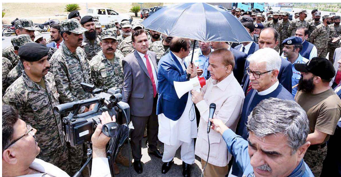
ISLAMABAD: Prime Minister Shehbaz Sharif interacting with the representatives of law enforcement agencies.

DAVOS: On the sidelines of the World Economic Forum, Foreign Minister Bilawal Bhutto Zardari met with Iranian Foreign Minister Dr. Hossein Amir Abdollahian on Thursday. During the meeting, Foreign Minister Bilawal Bhutto Zardari reaffirmed Pakistan's desire to strengthen Pak-Iran fraternal ties in all areas of mutual interest. He emphasised that there existed vast scope in bilateral trade and economic cooperation which should be tapped by both sides through various institutional mechanisms and innovative ways to identify new sectors. The Foreign Minister underscored the importance of earliest completion of border markets to improve livelihood in the border region. The Foreign Minister appreciated Iran's steadfast support for the Kashmir cause, especially at the Supreme Leader level.