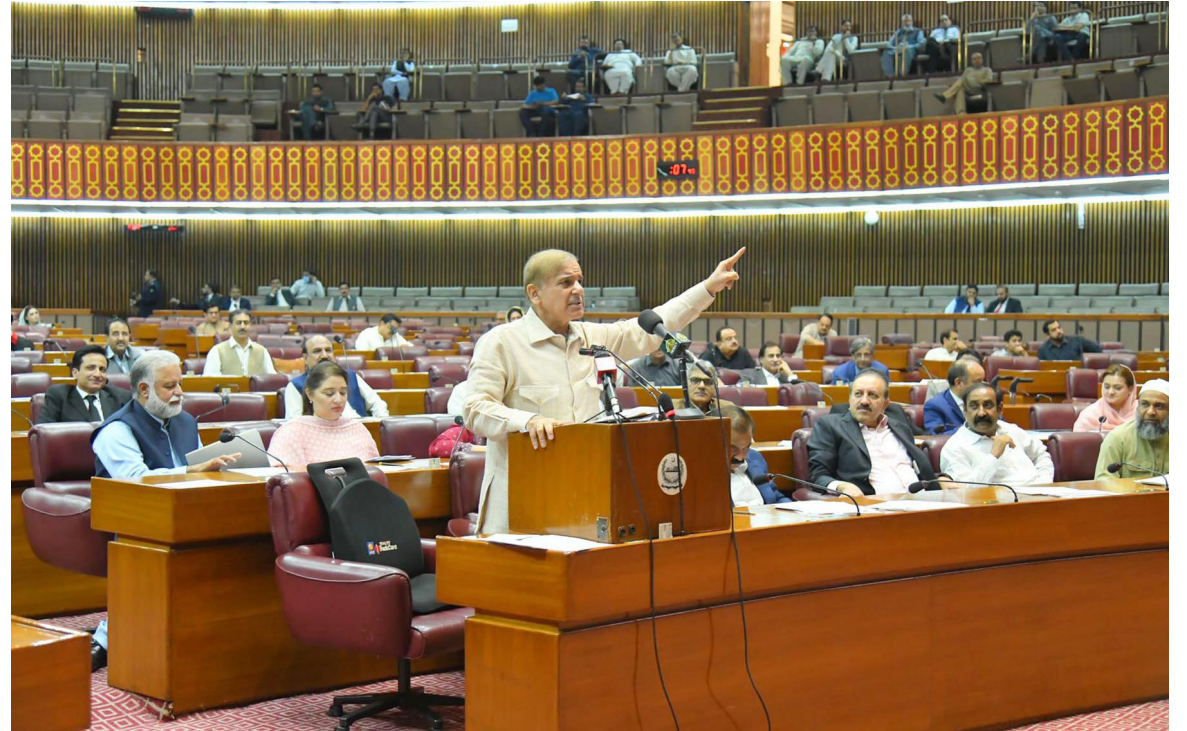
ISLAMABAD: Prime Minister Shehbaz Sharif addressing the National Assembly session.

No-trust motion against CM Bizenjo fails