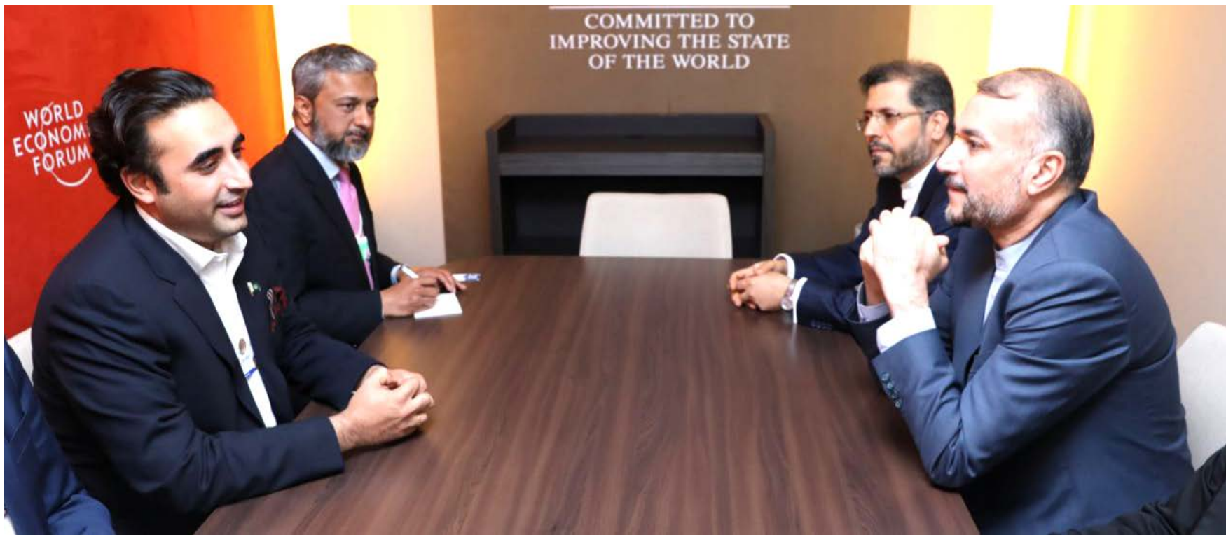
DAVOS: Foreign minister of Pakistan Bkhalw Bhutto Zardari meets his Iranian counterpart, Hossein Amir Abdullahian on the sidelines of the World Economic Forum at Davos.

CALIFORNIA: Global social media company Twitter agreed to pay a $150 million fine over the alleged misuse of personal data over six years in order to help sale of targeted advertisements. "From at least May 2013 until at least September 2019, Twitter misrepresented to users of its online communication service the extent to which it maintained and protected the security and privacy of their nonpublic contact information," said a complaint filed on Wednesday. "Specifically, while Twitter represented to users that it collected their telephone numbers and email addresses to secure their accounts, Twitter failed to disclose that it also used user contact information to aid advertisers in reaching their preferred audiences," said the filing in the US District Court Northern District of California. — Agencies