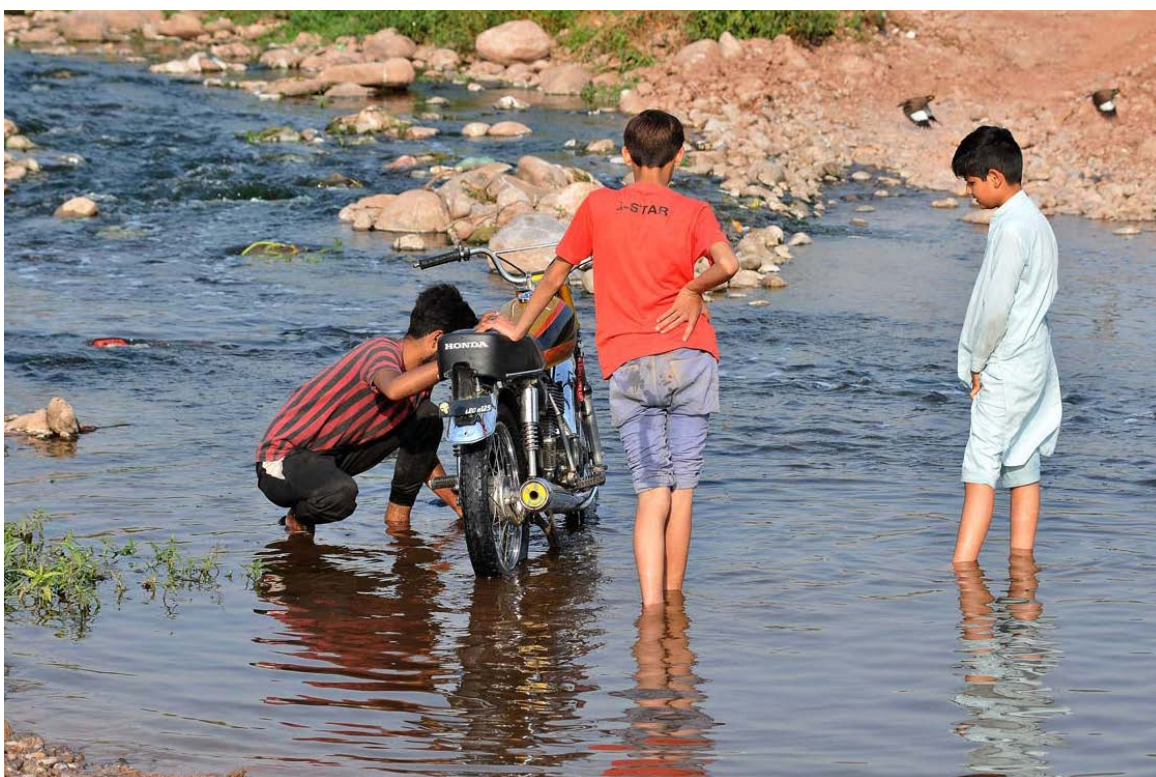
ISLAMABAD: Biker busy washes his bike in the Korang stream.

with teargas, he said. here. Imran Khan violated the court orders and Met-Bus stations and trees were also set on fire. Refuting the baseless propaganda, he clarified that police did not fire a single rubber bullet. Eighteen personnel of Rangers and police sustained serious injuries while ensuring protection to the lives and property of the citizen, he added. He said Islamabad Police and Rangers would continue to perform their duty to protect lives and property of the people. Rangers and Islamabad Police guarded the citizens with bravely and responsibly and controlled the rioters