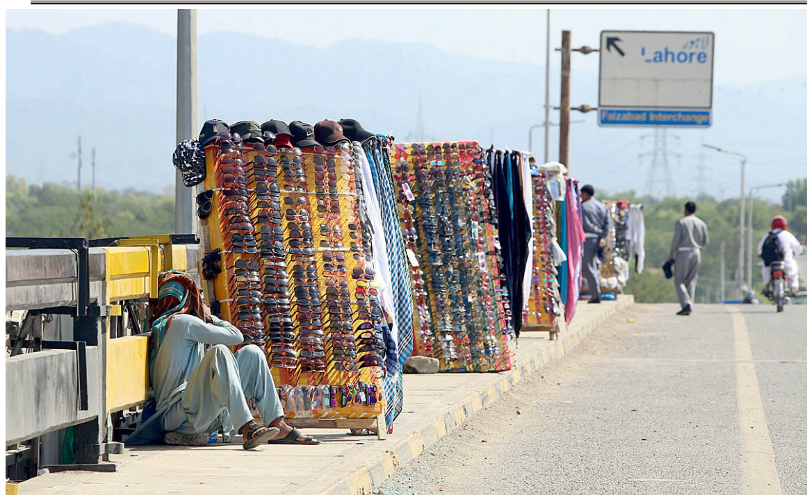
RAWALPINDI: Street vendors are displaying sunglasses to attract customers at Faizabad neighbourhood.