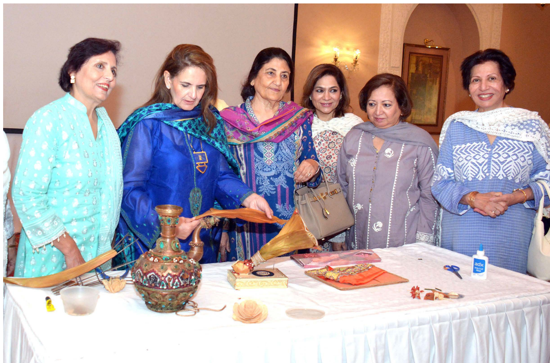
ISLAMABAD: First lady Begum Samina Alvi reviewing a flower arrangement during a workshop held under the aegis of Islamabad Floral Society, at Islamabad Serena Hotel.