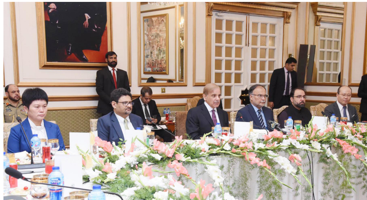
ISLAMABAD: Prime Minister Shehbaz Sharif chairing a meeting with Chinese investment companies.

Ukraine Heavy fighting as Russian troops enter key city