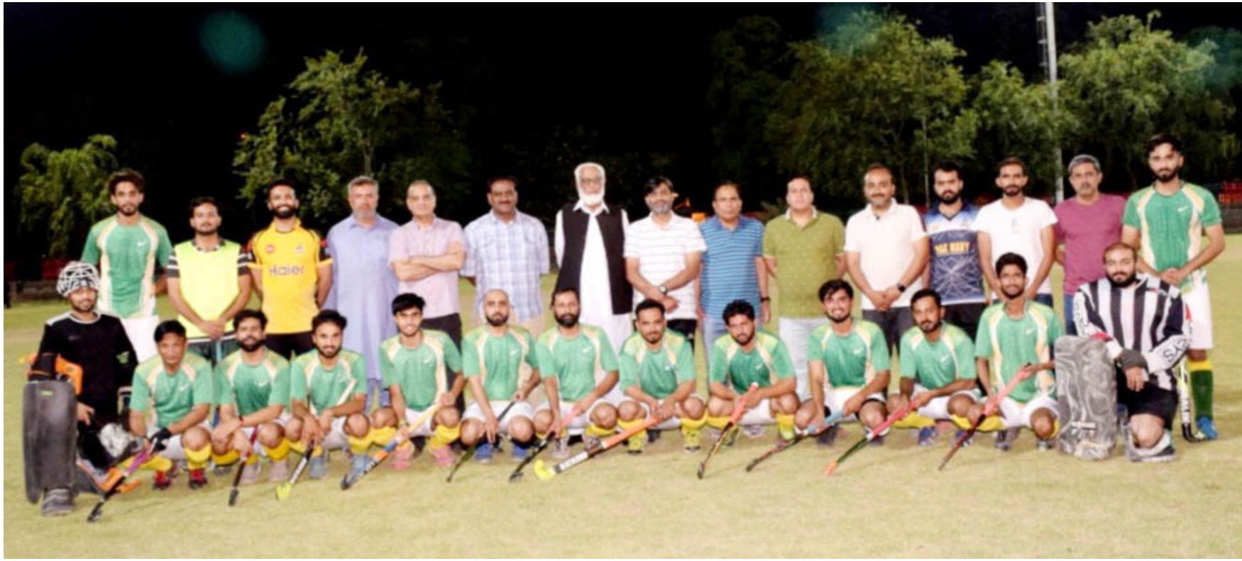
ISLAMABAD: Players of Nishtar hockey club posing for a picture on the occasion of semi final match with Islamabad Tigers hockey club. Nishtar defeated Islamabad Tigers by one goal and qualified for the final.

The historic and long-standing relations between Pakistan and Turkey are firmly anchored in common faith, shared history, and a glorious tradition of mutual support to each other on issues of core interest. The Turkish leadership and government have steadfastly supported the just cause of Kashmir. Turkey is an important and active member of the OIC Contact Group on Jammu and Kashmir. The two countries have convergent views on a range of issues including peaceful and stable Afghanistan, Palestine, and countering Islamophobia. A large number of Turkish companies have invested more than USD 1 billion in different sectors (construction, power, solid waste management, hygiene products, electronics and dairy etc) in Pakistan. Prominent investors include Al Bayrak, Oz Pak, Zorlu, Arcelik, Siyahkalem, Sutas, Coca-Cola Icecek, and Hayat Kimiya. Heads of selected Turkish companies will also call on the prime minister during his stay in Ankara.