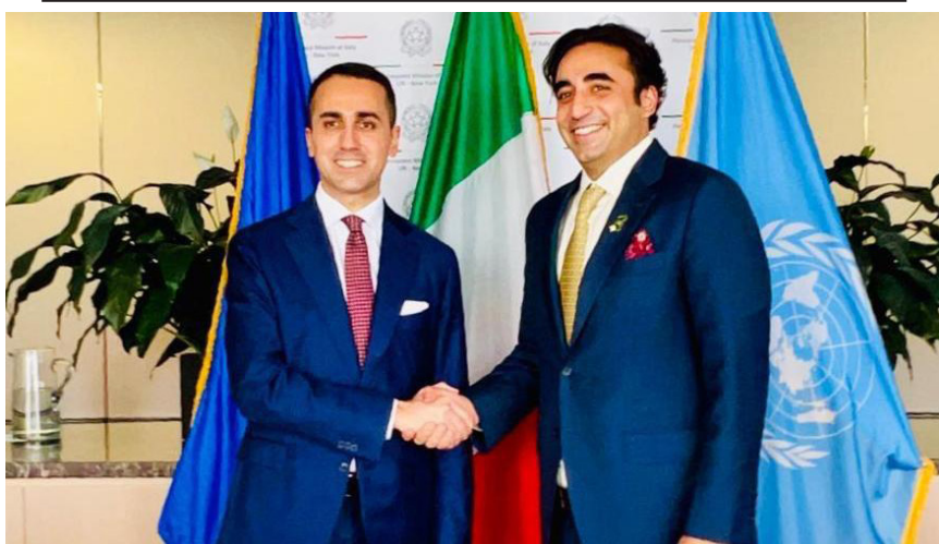
NEW YORK: Foreign Minister Bilawal Bhutto Zardari meets Italian Foreign Minister Luigi Di Maio.