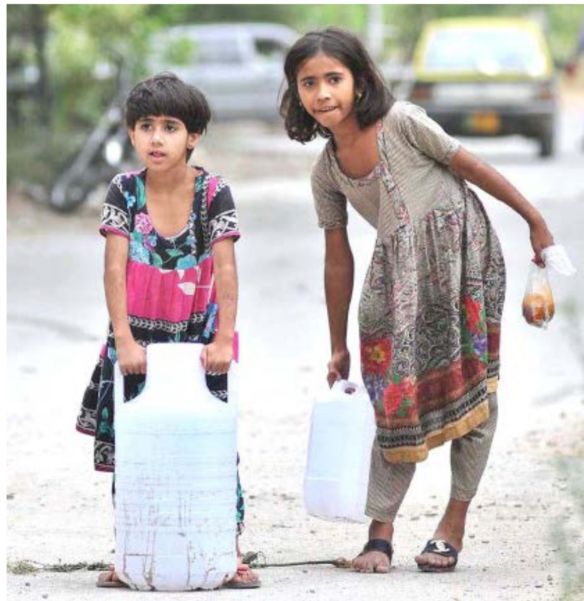
ISLAMABAD: Girls on their way back after fetching fresh drinking water from water filtration plant in the capital city.