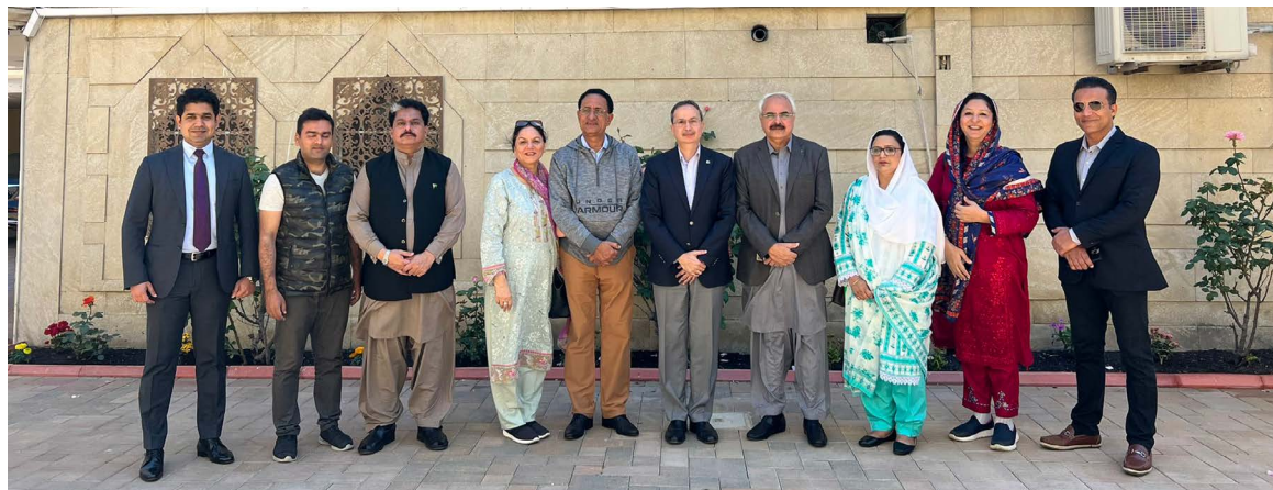
BAKU: Parliamentary delegation from Pakistan visited the Pakistan embassy Baku. The delegation was visiting Baku to participate in the 3rd General Conference of PAECO.