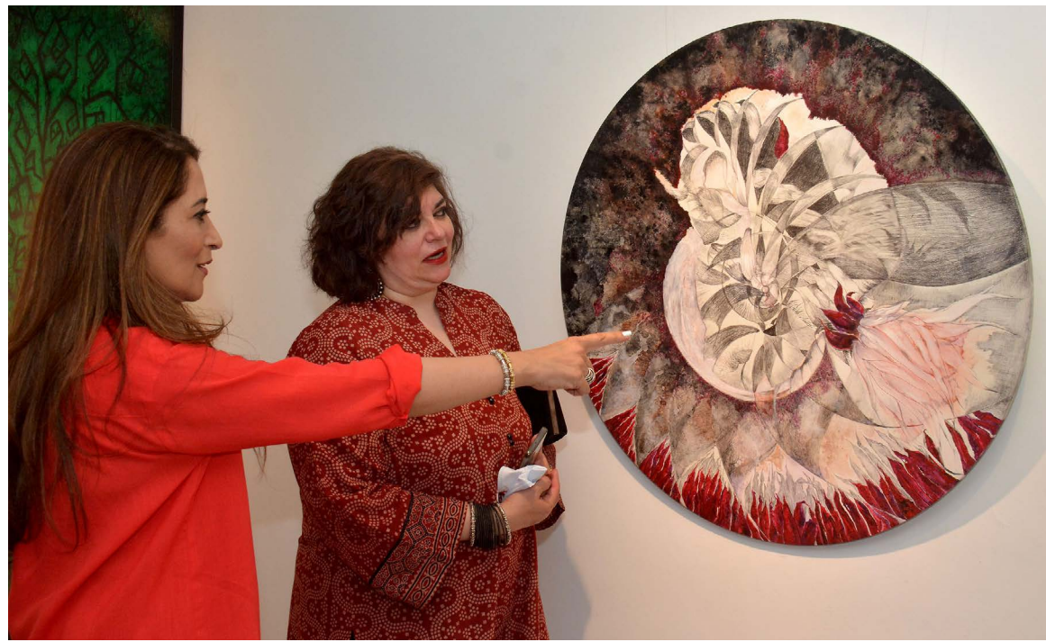
ISLAMABAD: Visitors taking interest in pieces of art during an exhibition at Tanzara Art Gallery.

facility. Nawaz hospital and Yousafzai Medical Centre services were suspended for keeping expired test tubes and reagents, unhygienic conditions and absence of proper waste management system while partial services of two other healthcare establishments were suspended. Lab and ultrasound services of Pure Health Lab, cancer markers and bile acid test services of Islamabad Diagnostic Center were suspended. Similarly, 22 healthcare establishments were served notices for minor non-compliances and instructed to comply with the directions given by the inspection teams. - APP