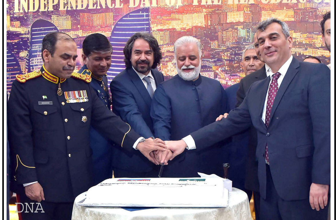
ISLAMABAD: Federal Minister for Parliamentary Affairs Murtaza Javed Abbasi, Ambassador of Azerbaijan Khazar Farhadov and others cutting cake to celebrate the National Day and Republic Day of Azerbaijan.