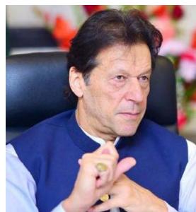
the "Azadi March" to avoid bloodshed. In a surprise move on Thursday morning

PESHAWAR: PTI Chairman Imran Khan Friday rebutted rumours of his party striking a deal with the establishment and said that he ended