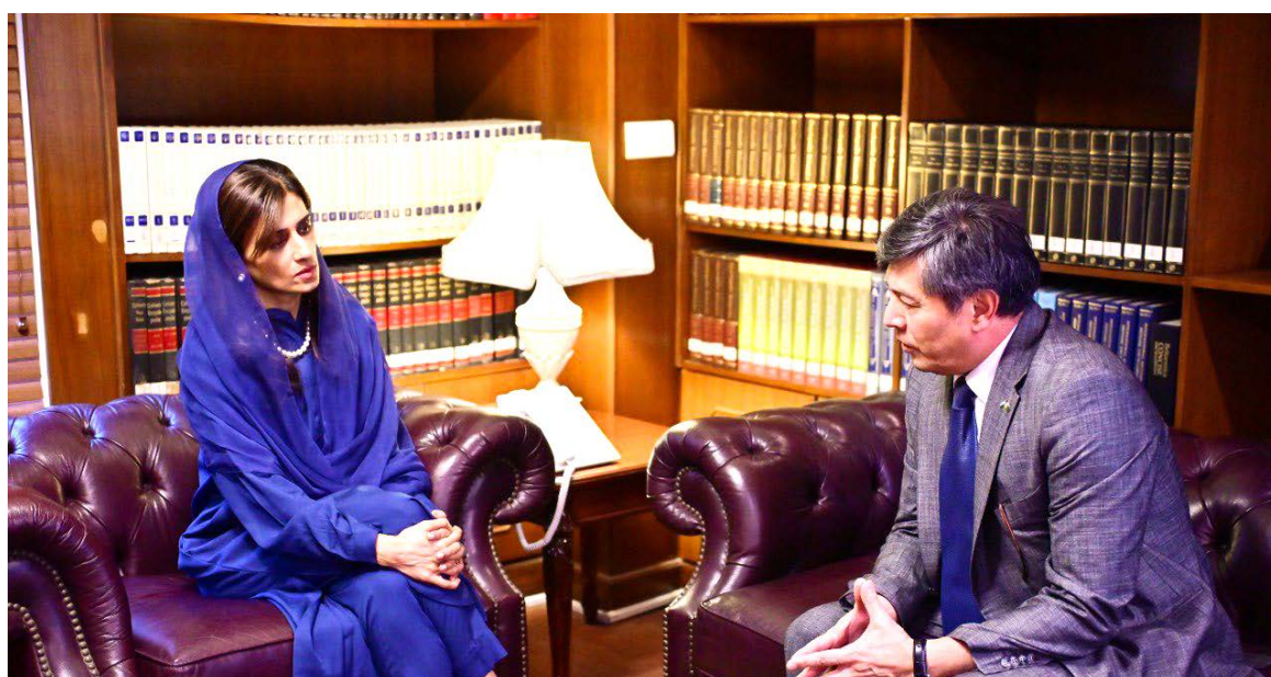
ISLAMABAD: Minister of State for Foreign Affairs, Hina Rabbani Khar, in a meeting with Uzbek Ambassador, Oybek Usmanov.

animals to humans. Pakistan has a large stock of livestock with a substantial viral and bacterial load. This makes it particularly important for the government to take concrete steps such as enhancing vaccination campaigns against common livestock diseases, formulating improved regulations for the establishment and operations of livestock colonies, and developing institutional capacities and protocols for surveillance, monitoring, and reporting system in both rural and urban areas. The "One Health" approach launched by Government provides an excellent opportunity to take a more holistic and integrated approach to human, animal, and plant health. The article added that the impact of COVID-19 pandemic was particularly severe on daily wage earners and others with no employment protection. The lockdowns imposed and disruption in economic activities increased food insecurity. An estimated 50% of the population ate less or switched to lower quality food. Some 40% of the population faced moderate to severe food insecurity during April to July 2020. The agriculture sector was also affected by lockdowns and disruptions in markets. Higher imports helped ensure consumers had ready access to key staples. For example, wheat imports reached 3.6 million tons in 2020 – a level not seen for several decades. – APP