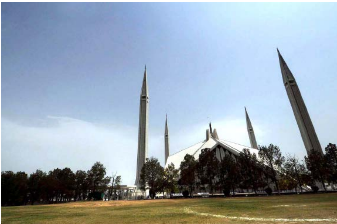
ISLAMABAD: A beautiful view of Faisal Mosque.