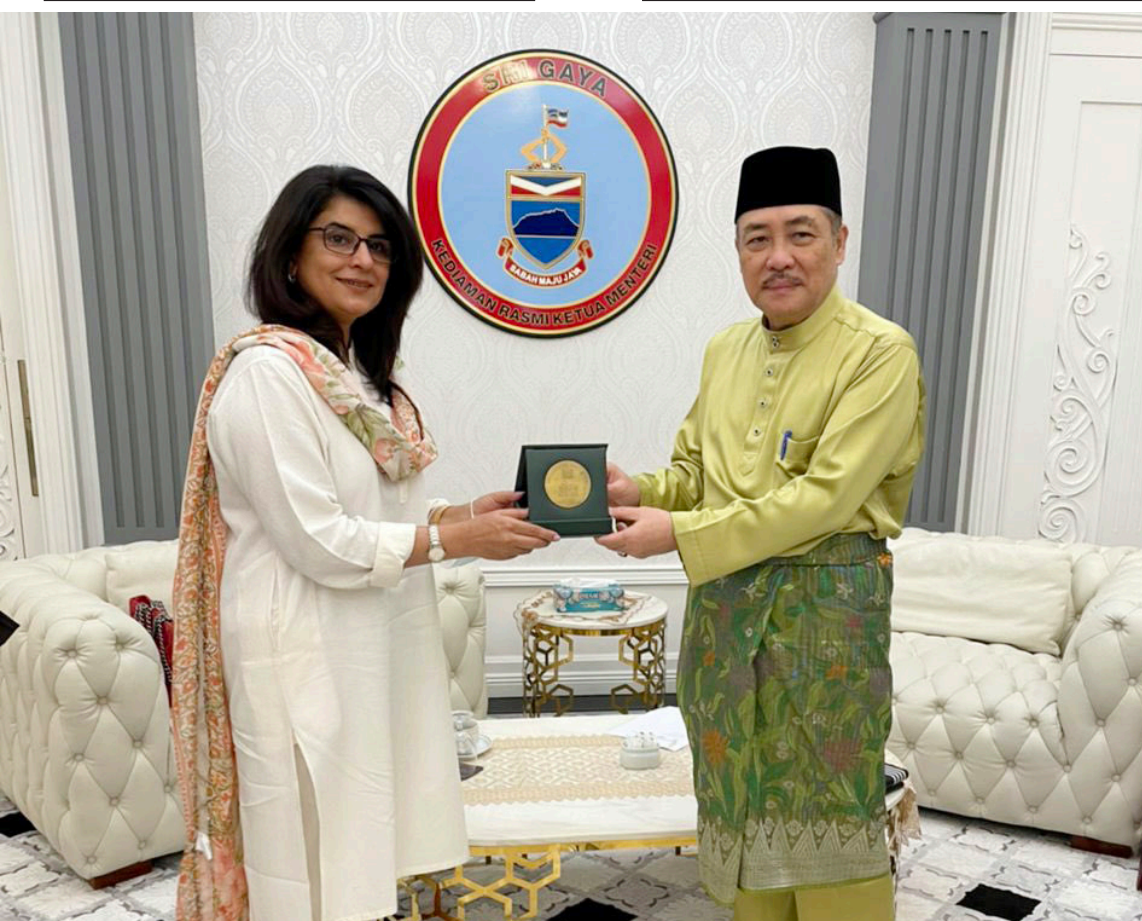
KUALA LUMPUR: Pakistan High Commissioner to Malaysia Amna Baloch calls on Chief Minister of Sabah, Datuk Seri Hajiji Bin Haji Noor. Views were exchanged on issues of mutual interest.

Secretary of State Erlan Karin, who spoke about the results of the work of the commission to Kazinform, said that the Prosecutor General's Office declassified more than 2.4 million materials, the National Security Committee declassified more than 1,500 archival documents, and the Ministry of Internal Affairs declassified more than 5,300 documents. The experts will also be engaged in methodological and consulting activities. An open digital database of repressed people and the publication of scientific collections will continue. - DNA