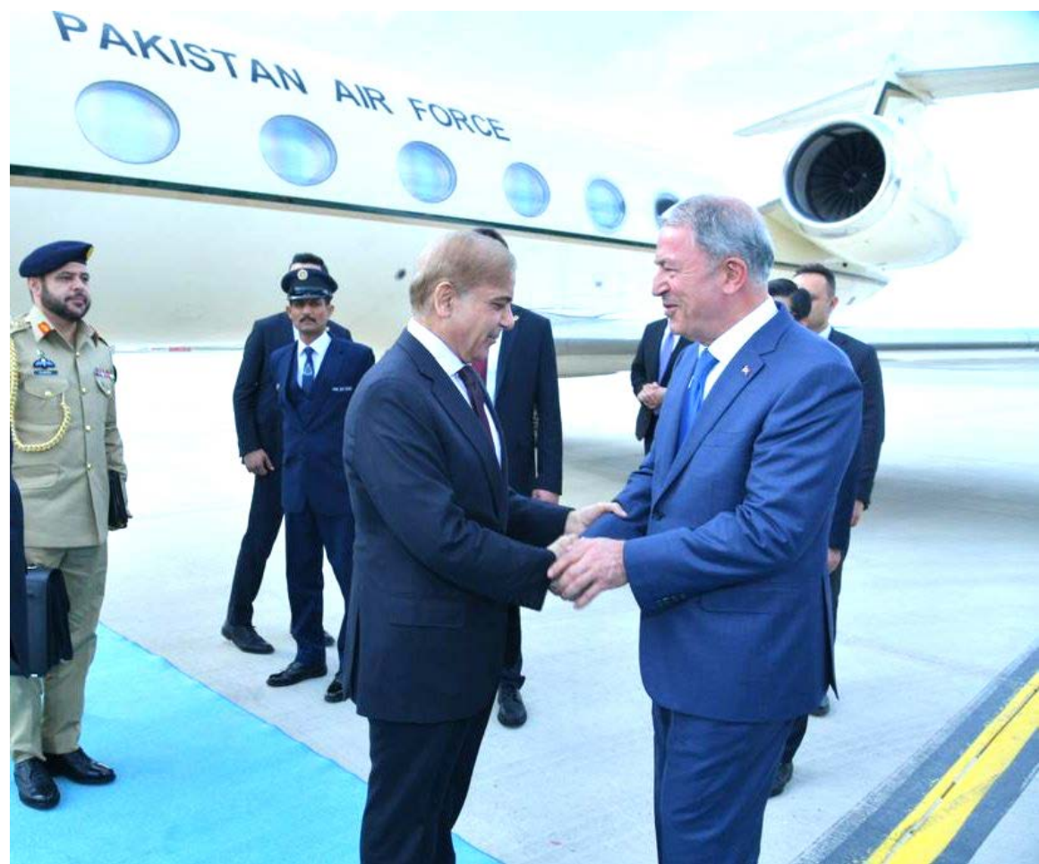
ANKARA: Minister of National Defence Turkey Hulusi Akar, receives Prime Minister Shehbaz Sharif on his arrival at Esenboga Airport, Ankara.