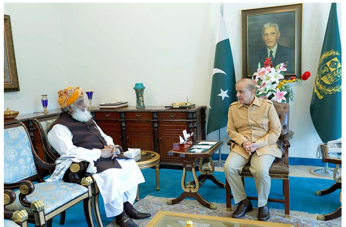
ISLAMABAD: JUI-F Chief Maulana Fazl ur Rehman calls on PM Shehbaz Sharif.