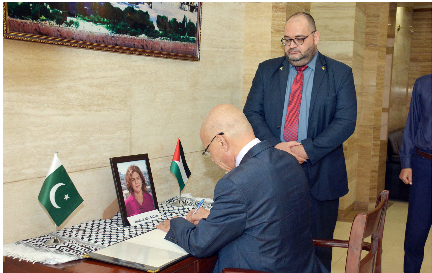
ISLAMABAD: Ambassador of Morocco Mohammad Karmoune signing the condolence book to condole death of Palestine journalist who was killed by the Israeli forces. - DNA

ISLAMABAD: Estate Office, Ministry of Housing Works (MoHW) has vacated as many as 13 government residences from the employees of the Water and Power Development Authority (WAPDA) and one other government department in one and half year. "The rest of the government accommodations will revert back to the pools of Estate Office," an official in the Ministry of Housing and Works told APP. He said the mechanism was decided by the Ministry of Housing and Works and WAPDA authorities amicably in a meeting during last year. However, the allottees who had been allotted accommodation prior to the promulgation of Accommodation Allocation Rules-2002 would be allowed to retain the government accommodation till their date of superannuation, he added. - APP