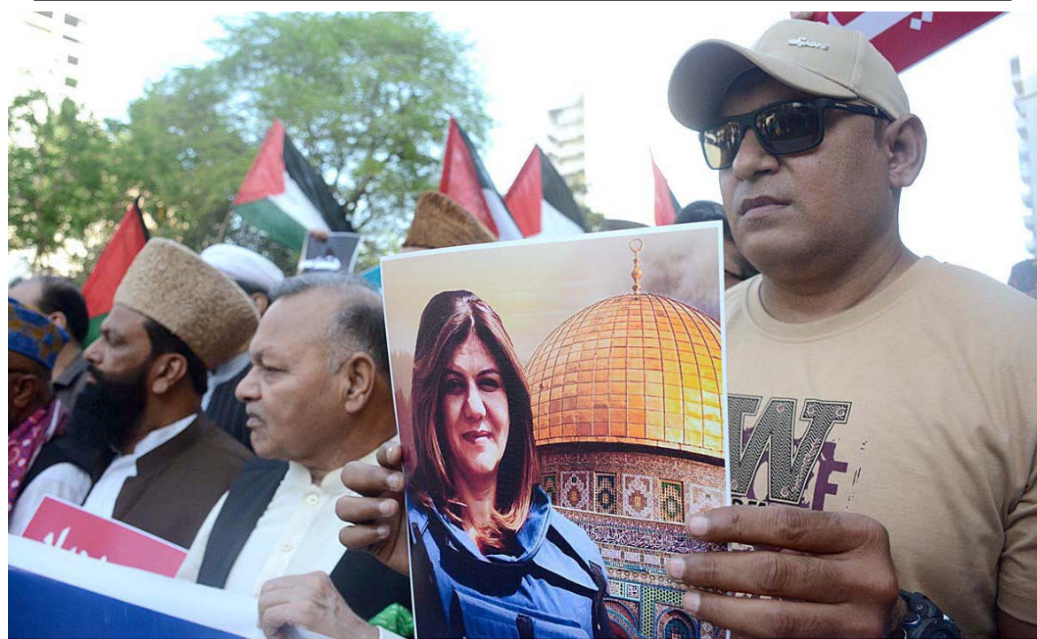
KARACHI: Activists of Palestine Foundation Pakistan (PLF) staged a rally for marking 74 years of Nakba (Israel's creation) at the Press Club.