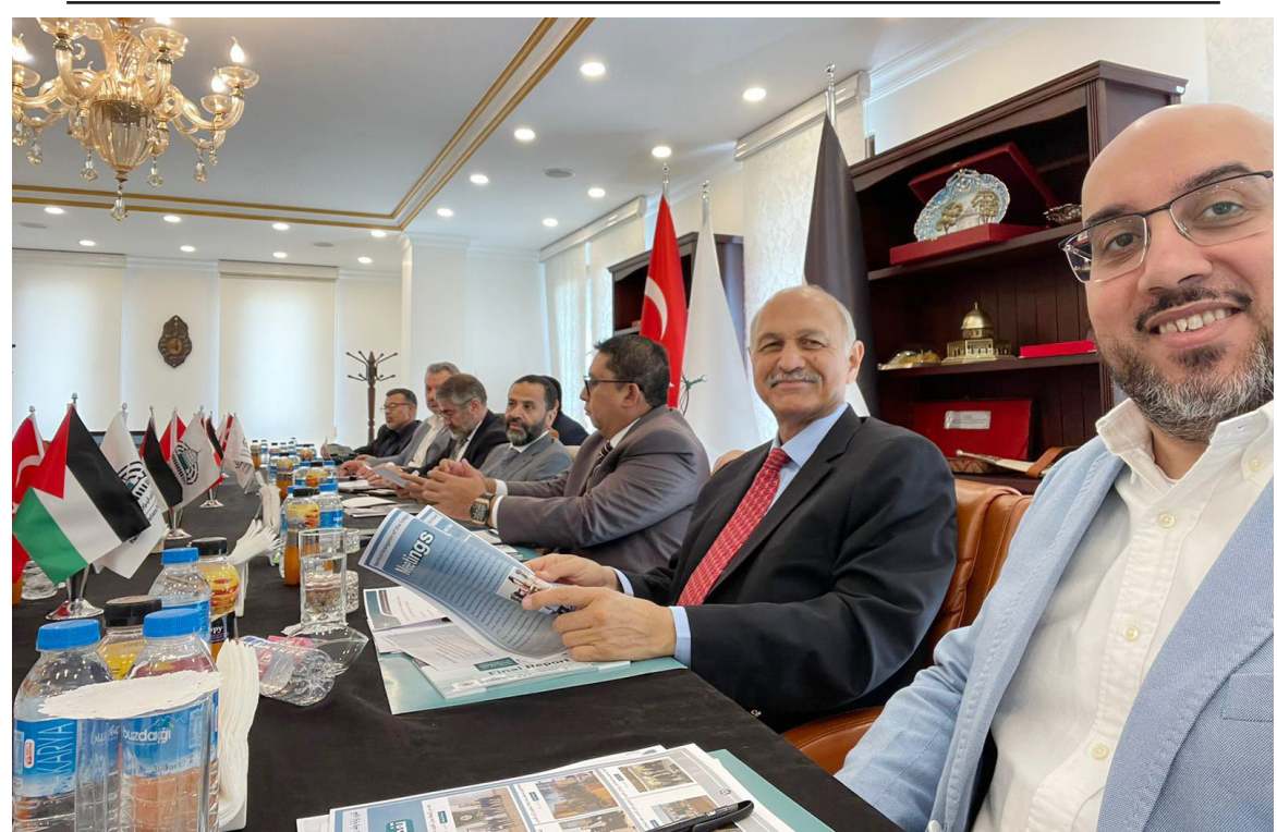
ISLAMABAD: Executive Committee meeting of League of Parliamentarians for Al Quds, based in Istanbul, which has MPs from over 100 countries, also attended by Turkiye's Finance Minister, Dr Nuruddin Nebatiand representative from Indonesia, Algeria, Morocco, Jordan, Kuwait, Yemen, Palestine & Pakistan. - DNA

initial wave of economic disruption than it was eight years ago. In particular, Russia's currency, the ruble, surprised the world after it bounced back from the West's initial sanctions that sunk it to lows of 150 to the US dollar in early March. By mid-May, it had risen to about 61.25 - its highest in 28 months. Some think this recovery is a sign of economic resilience, but well-known economists have warned that things are not bright as they appear. "The initial financial panic has indeed subsided, but that doesn't mean that the Russian economy is doing well. It's no way to say the Russian economy is resilient," said Sergei Guriev, an exiled Russian economist and professor at Sciences Po in Paris. In an exclusive interview with Anadolu Agency, Guriev said the current forecasts for the Russian economy are not promising at all, noting that the Russian Central Bank's projections for 2022 showed that the economy would experience a recession of 8% to 10%. "Instead of pre-war forecasts of plus 3% growth, recent leaks suggest that internal government forecasts point to a minus 12% GDP change in 2022," underlined the seasoned academic, who served as rector at the New Economic School in Moscow until he left the country in 2013. - Agencies