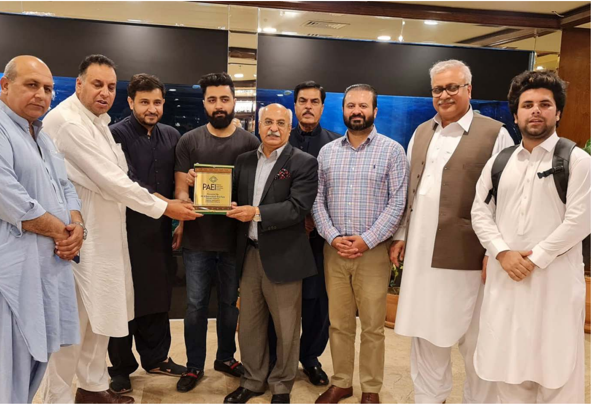
ISLAMABAD: Delegation of British Pakistani Forum from Birmingham UK had very fruitful meeting with Pakistan Association of Exhibition Industry at Marriott hotel.