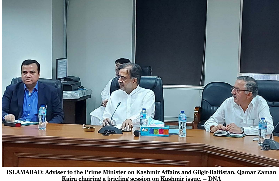
Kaira chairing a briefing session on Kashmir issue.

He said that an increase in temperatures was also likely to increase hydropower generation. He said that there was no balance in affairs of the previous government; had there been a balance, these problems would have not come up. He said the present government is fully aware of the plight of people and is working to alleviate it. Earlier, Chief Executive Officer (CEO) FESCO, Engr. Bashir Ahmed briefed the minister and stated that FESCO's recovery is 100% while its line losses are the lowest. He said that FESCO's distribution system had been upgraded and now FESCO's distribution system was able to carry maximum load during the summer season. He further said that FESCO had provided 256 transformer trolleys in all the subdivisions with the aim of restoring power supply immediately in case of any fault in the transformer. He said that FESCO had set up a state-of-the-art Customer Service Center for instant solution of consumer electricity related issues. Similarly, FESCO has introduced a mobile app "FESCO Light" for online information and registration of consumers' complaints, he added.