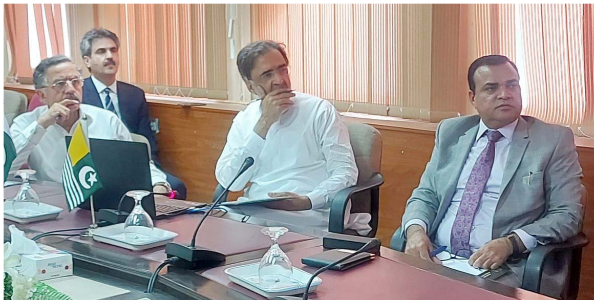
ISLAMABAD: Qamar Zaman Kaira Prime Minister Adviser on Gilgit Baltistan and Kashmir Affairs chairing a meeting to assess damages caused by floods in the area.