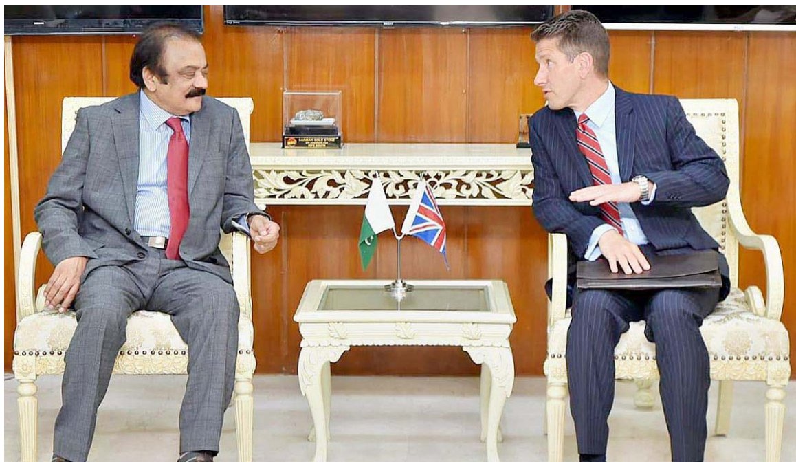
ISLAMABAD: British Ambassador Dr. Christian Turner called Interior Minister Rana Sanaullah Khan.

ISLAMABAD: Federal Minister for National Food Security and Research Tariq Bashir Cheema on Tuesday welcomed investment from China's Royal Group and directed the officials concerned to expedite investment process to achieve mutual benefits. The delegation management and top scientists of China's Royal Group met with federal minister and discussed matters related to agriculture and livestock sectors development in the country. The meeting was also attended by senior officials of the ministry including Secretary Ministry of National Food Security Captain (r) Muhammad Asif, said a press release. The delegation discussed business opportunities in Pakistan and briefed the minister that at present, the planned investment projects of the Royal Group was include the buffalo embryos laboratory project, the dairy buffalo farm project, and the buffalo milk deep processing. The minister was told that the dairy sector of Royal Group includes the whole industry chain business, such as forage grass planting, dairy farming, dairy products processing and sales. It has established and controlled 25 standardized dairy breeding bases with an annual dairy production capacity of 500,000 tons. Royal Group owns the only provincial Dairy Technology Research Center, the National Dairy Processing Technology Research and Development Sub-center and Yunnan Enterprise Technology Research Center in Guangxi Province.