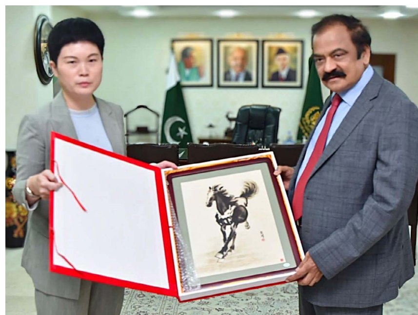
ISLAMABAD: Charge d' Affairs of China Her Excellency Pang Chunxue presenting a souvenir to Federal Minister for Interior Rana Sana Ullah Khan as she visits his office.