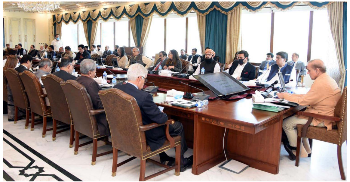
ISLAMABAD: Prime Minister Shehbaz Sharif chairs Federal Cabinet Meeting.