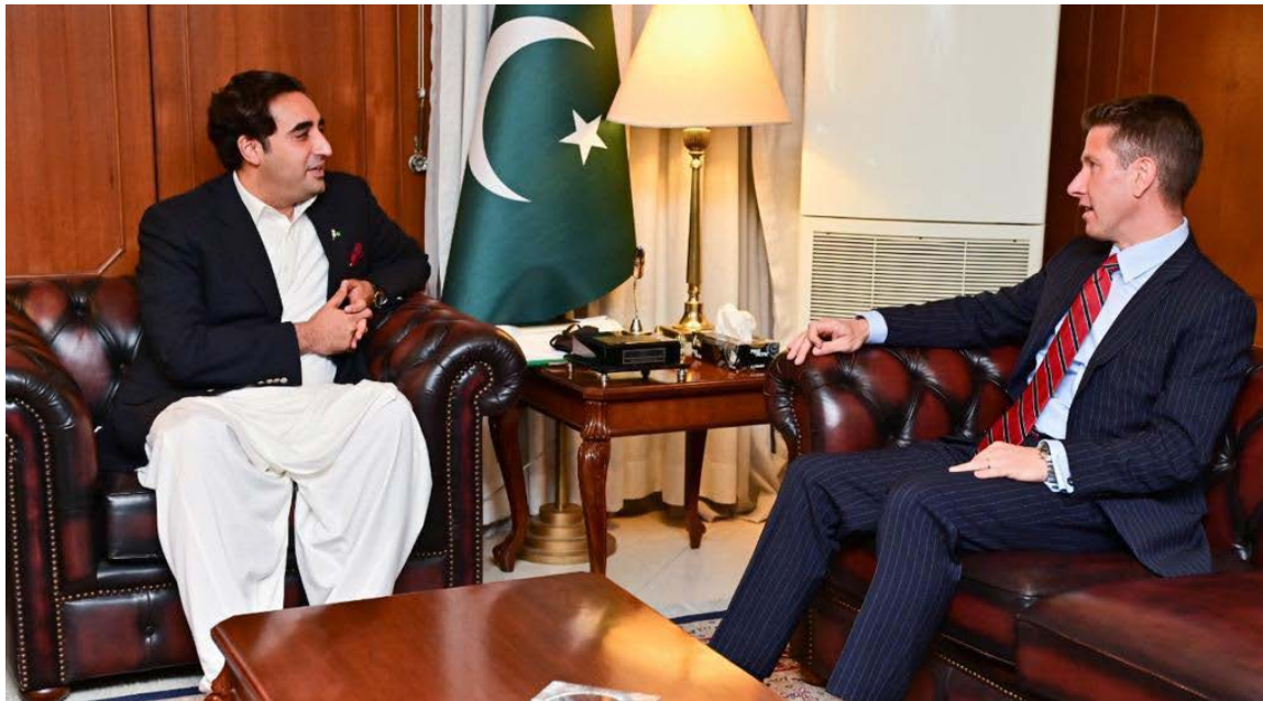
ISLAMABAD: British High Commissioner Dr. Christian Turner calls on Foreign Minister Bilawal Bhutto Zardari.

ISLAMABAD: Foreign Minister and Chair Pakistan Peoples Party, Bilawal Bhutto Zardari talking to the journalists in the parliament house said that whoever breaks and subverts the constitution has to be tried under article 6 of the constitution. Whatever happened and done from April 3 to 10th and afterwards by the PTI members amount to subverting constitution.