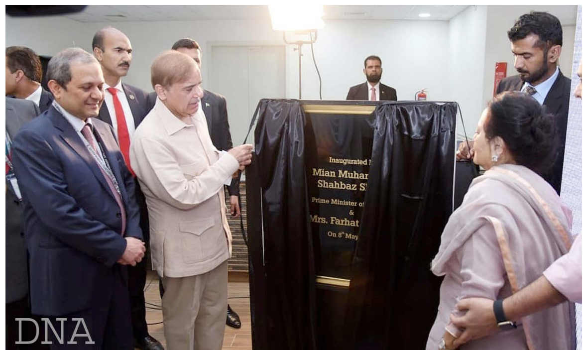
LAHORE: Prime Minister Muhammad Shehbaz Sharif inaugurates the Saleem Memorial Trust Hospital.

Thousands vote for Khalistan referendum in Italy A large number of Sikhs were present outside the polling stations