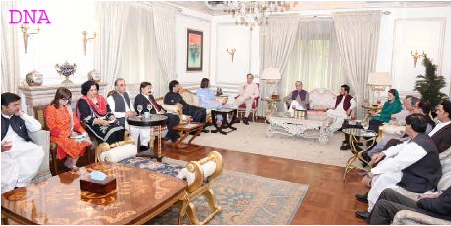
LAHORE: CPNE delegation in a meeting with Prime Minister.