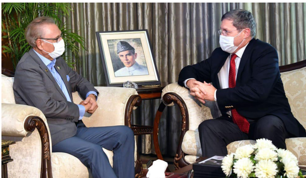
ISLAMABAD: Ambassador of Switzerland Benedict de Cerjat pays a farewell call on President Dr. Arif Alvi.

billion (US $ 2.3 billion) syndicate facility. He also thanked China for its support and assistance to Pakistan's efforts towards preventing the spread of COVID-19 pandemic by providing millions of vaccine doses as well as protective and medical equipment. The prime minister said that as a flagship of the visionary Belt and Road Initiative (BRI), CPEC had transformed Pakistan's economic base and strengthened capacity for self-development. He reaffirmed the government's resolve to accelerate the pace and complete CPEC projects at the earliest. The prime minister also underscored the high importance Pakistan attached to the strategic ML-I and other key projects including Karachi Circular Railway (KCR), Babusar Tunnel, and desalination plant in Karachi. The CPEC and growing economic linkages had deepened the roots of the abiding friendship between the peoples of both the countries, the prime minister noted. Atop this unshakable foundation, the Pakistan-China partnership would continue to play its valuable role as a factor of peace and stability in the region and beyond. – APP