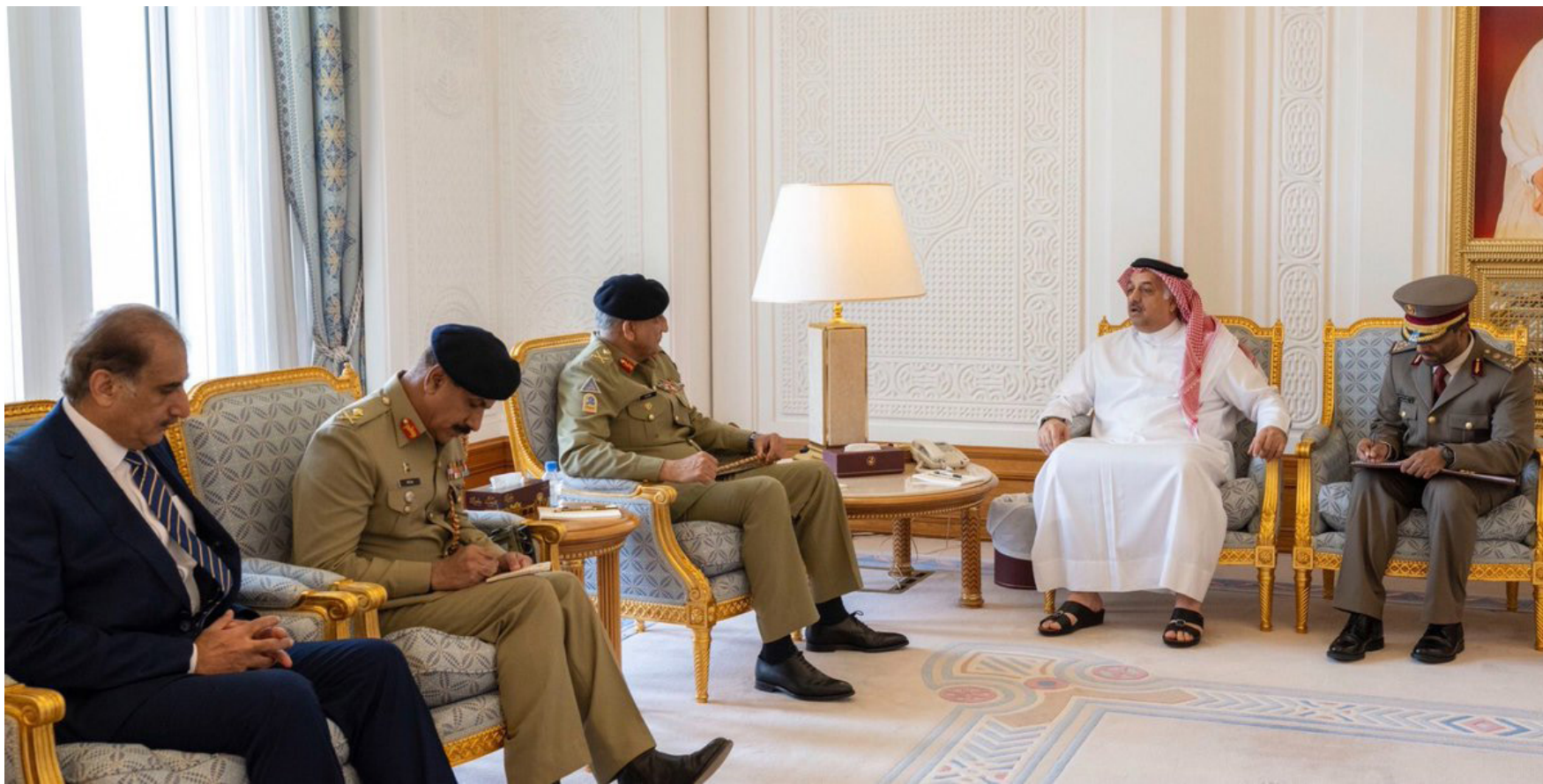
DOHA: Chief of the Army Staff of Pakistan General Qamar Javed Bajwa meets Deputy Prime Minister and Minister of State for Defense Affairs of Qatar Dr. Khalid bin Mohammed Al Attiyah.