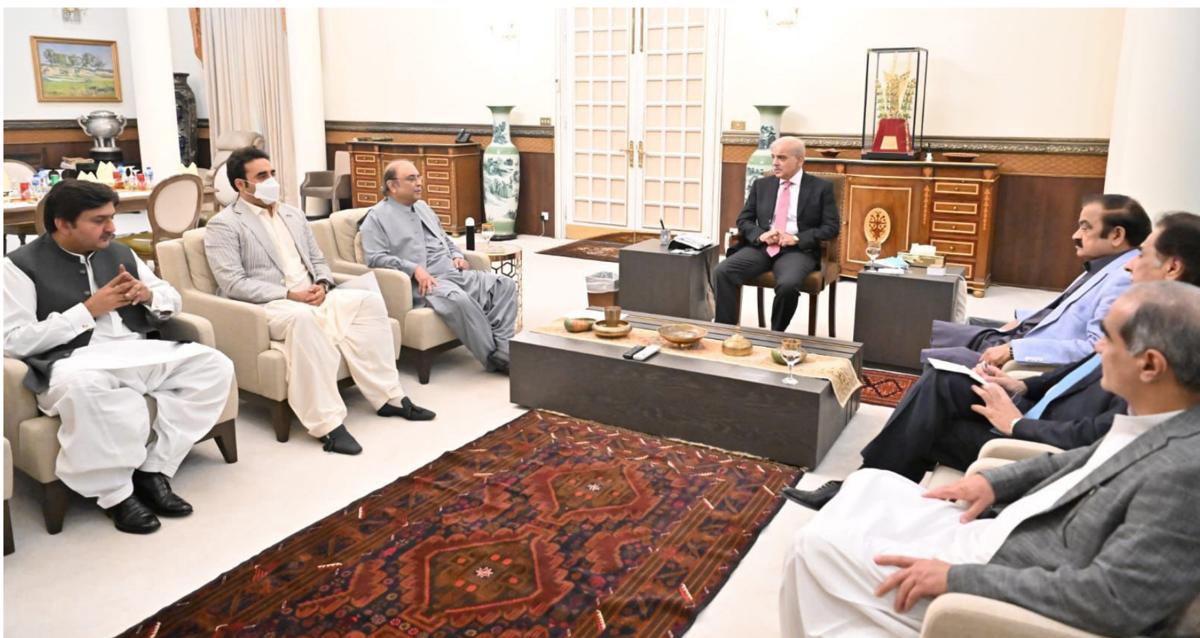
ISLAMABAD: President Pakistan Peoples Party Parliamentarians Asif Ali Zardari and Foreign Minister, Bilawal Bhutto Zardari call on Prime Minister Shehbaz Sharif.

BRUSSELS: European Commission chief Ursula von der Leyen said Thursday the EU and New Zealand had sealed a free trade deal after four years of talks, promising it would deepen ties. "This is a historic moment in our cooperation," von der Leyen told reporters at a joint press statement with New Zealand's Prime Minister Jacinda Ardern, adding that the deal had come after "tough negotiations". Ardern hailed a "historic further milestone in the strong partnership between two closely-connected like-minded friends." The pact brings economies of vastly different sizes closer together: New Zealand has a population of just five million people against the EU's 450 million. Once it has survived a long ratification process, the EU said the deal would eliminate all tariffs on its exports to New Zealand and will open markets in key sectors such as financial services, telecommunications, maritime transport and delivery services. – APP