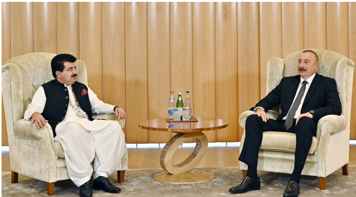
BAKU: Azerbaijan President Ilham Aliyev exchanging views with Chairman Senate Pakistan Muhammad Sadiq Sanjrani, who called on him on Thursday.