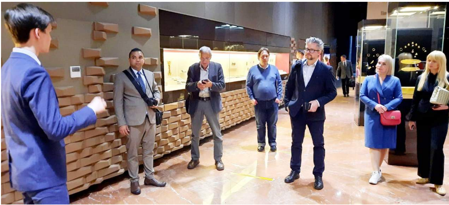
NUR SULTAN: Media people being briefed about the culture and history of Kazakhstan during their visit to the National Museum.

ISLAMABAD: The winning streak of the Pakistani rupee has continued to maintain its momentum on Thursday also as it was pushing the US dollar down towards Rs197 mark in intrabank trading. The US dollar lost 47 paise in its value and reached Rs197.40 at the start of the interbank trading on the second-last day of the current business week. On Wednesday, the Pakistani currency roared hard all day long by rocketing up by nearly one rupee but settled at 59 paise up as the business closed. The US dollar plummeted to Rs197.87 in the intrabank trading, the forex dealers said. The rupee, which had been struggling against the US dollar for the last three weeks, gained strength when the government in order to revive its loan programme with the IMF started implementing its directives and heavily increased the prices of petroleum products on Thursday last. The government announced a whopping increase of Rs30 per litre in the prices of petroleum products. The International Monetary Fund (IMF) had delayed the revival of the stalled $6-billion programme under the External Financing Facility (EFF) for Pakistan. The Fund, in a statement, emphasised the abolition of subsidies on petroleum products and electricity, among other conditions, as a prerequisite for the programme's revival.