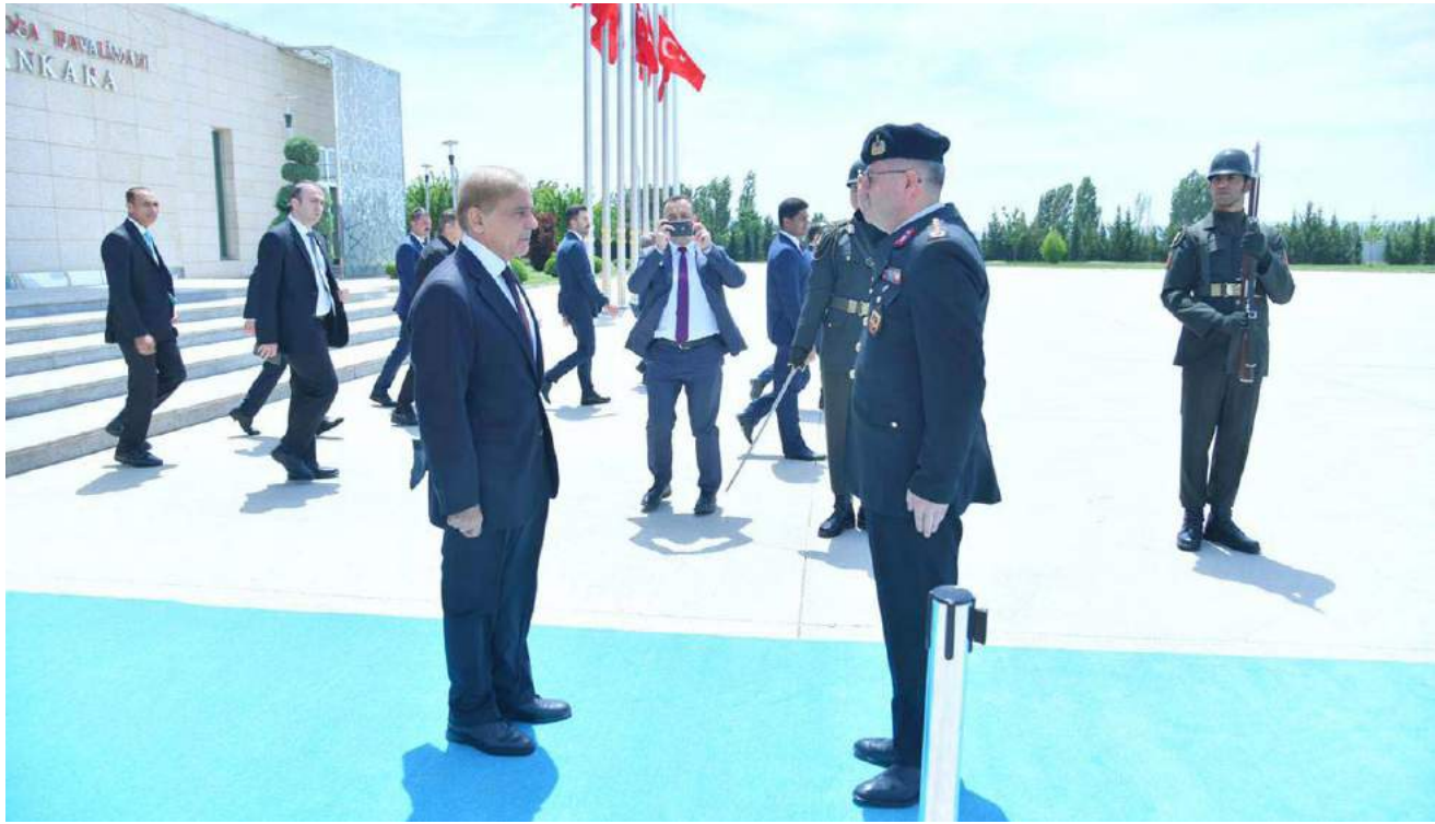
ANKARA: Prime Minister Shehbaz Sharif being presented a guard of honour upon departure after concluding his visit to Turkiye. - DNA

PARIS: French diplomats staged a one-day strike Thursday to protest a plan by President Emmanuel Macron to strip foreign envoys of their distinct status, a move they say will weaken Paris's influence abroad. France has the third-biggest foreign service in the world after China and the United States. And it is only the second time in the foreign ministry's history that the institution, which prizes discretion and compromise, has staged an open revolt over a government project. The decree calling for the diplomatic corps' "extinction" was unveiled in April by Macron, who wants to create a single pool of elite "state administrators" capable of transferring smoothly throughout the public sector. Diplomats say removing their special status fails to acknowledge their experience and expertise in defending French interests, by making posts available to all senior civil servants and not just those specifically trained for the foreign service. "The reform says that agents are, in a way, interchangeable," Olivier Da Silva, a diplomat and union chief, told media. - APP