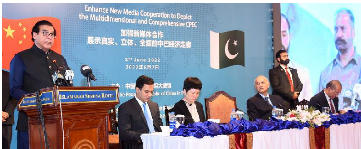
ISLAMABAD: Speaker National Assembly Raja Pervez Ashraf addressing the participants of 7th CPEC Forum.