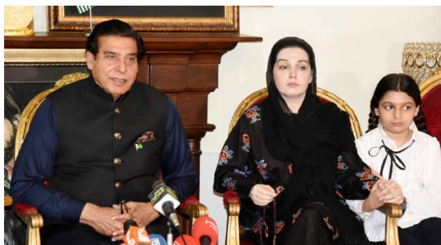
Speaker Raja Pervez Ashraf said that unilateral decision of Indian court could not stifle the spirit of freedom of Yasin Malik and Kashmiri people. He further said that Yasin Malik has raised the banner of truth by enduring the hardships of imprisonment.

ISLAMABAD: National Assembly Speaker Raja Pervez Ashraf on Thursday said the entire Pakistani nation was perturbed and strongly condemns the punishment of Yasin Malik by Indian courts.