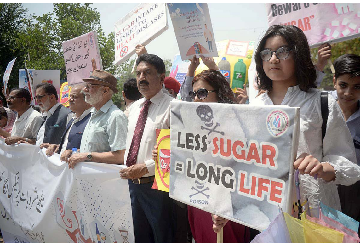
ISLAMABAD: Pakistan National Heart Association (PANAHA) members are holding a protest rally against sweet drinks outside National Press Club.

ISLAMABAD: State Minister for law and Justice Senator ShahadatAwan on Thursday said the appointment of new National Accountability Bureau (NAB)'s chairman would be made through a selection committee with the consultation of the leaders of the house and opposition. Responding to supplementary query raised by Pakistan Tehreek-e-Insaf's Senator Azam Khan Swati, he made it clear that the appointment of NAB chairman could not be made at the whim of any individual. Assuring at the floor of the upper house of the parliament, he said whosoever would be appointed in the chair, he would be neutral, competent, and independent with a good character and he would treat all the people equally without any prejudice. Replying to Senator Mushtaq Ahmed of Jamaat-e-Islami who pointed out the credibility and impartiality of NAB in the past, Shahadat said the aim of this institution was to remove corruption from all segments of the society but it could not perform its professional obligations in accordance with its mandate in the previous government's tenure. He assured that in this regime, the justice would prevail and those who had misused their authority in the past would be held accountable across the board. He said the legislation would be made in the NAB ordinance with the consultation of all parliamentary parties and they would be in the larger interest of the country and the nation. The NAB reforms would be introduced in a bid to make the country corruption free, he added.