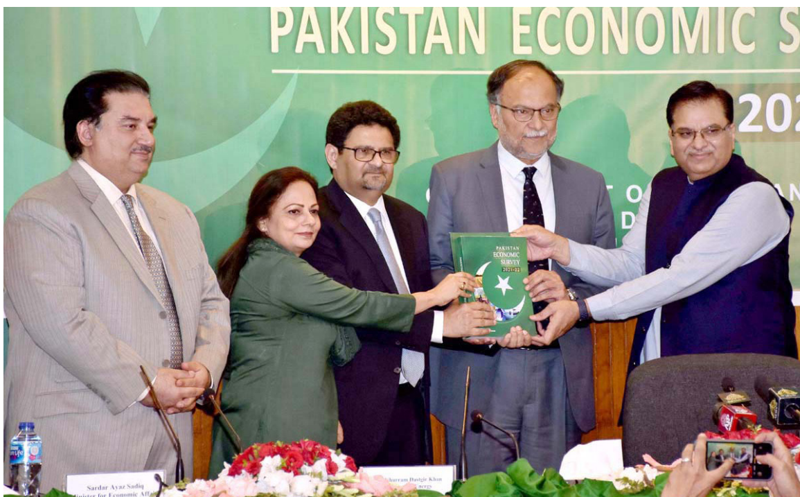
ISLAMABAD: Minister for Finance Miftah Ismail, Minister for Planning Development and Reform Ahsan Iqbal and Federal Minister for Power Khuram Dastgir Khan launching Pakistan Economic Survey 2021-22 at P-Block Auditorium.