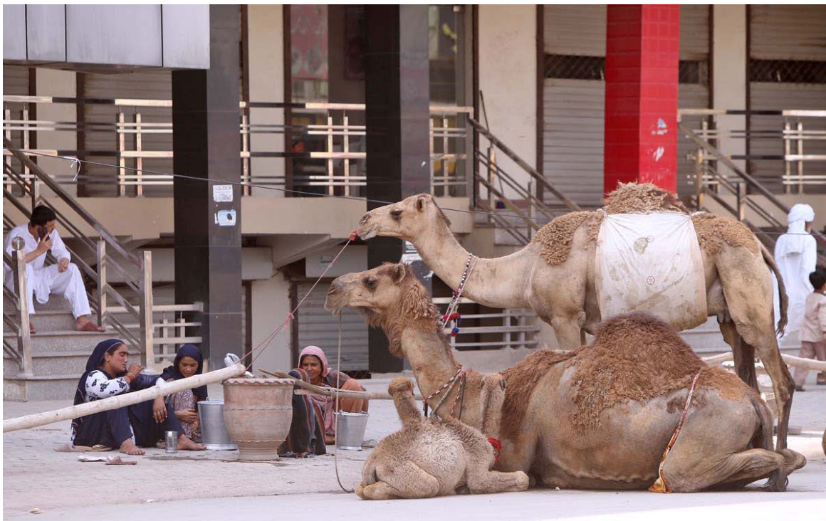
RAWALPINDI: Nomad women along with their camels sitting on a roadside waiting for customers to sell camel milk at Saddar.