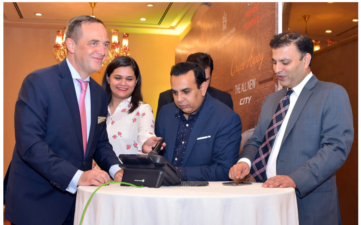
ISLAMABAD: General Manager Islamabad Serena Hotel holding a lucky draw to give brand new car to the winner.

A spokesman for the local administration said on Thursday that the magistrates inspected 765 shops in different markets and bazaars of Faisalabad and found dozens of shopkeepers involved in profiteering and overcharging. The magistrates imposed fine on them and warned that they would be sent behind bars if they did not shun profiteering, he added. - APP