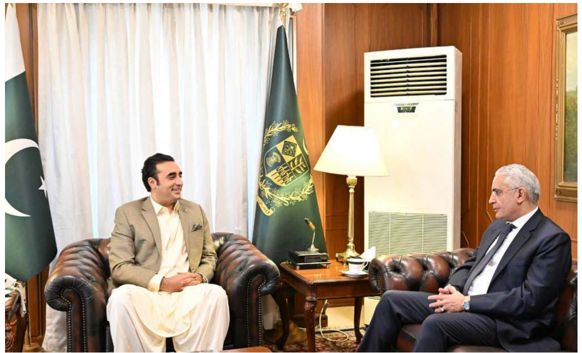
ISLAMABAD: Ambassador of Egypt to Pakistan Tarek Dahrour calls on Foreign Minister Bilawal Bhutto Zardari.

ISLAMABAD: The Ministry of National Health Services, Regulations, and Coordination in collaboration with the Council of Islamic Ideology (CII) on Monday arranged an Ulema Conference on the population issue. The conference was attended by a score of renowned religious scholars of different schools of thought. Minister for Health, Abdul Qadir Baloch was the chief guest at the Conference. Addressing the gathering, the minister said that the population of Pakistan is increasing unabatedly. Uncontrolled population increase puts pressure on the already fragile health and education sectors along with effecting climate change, he said. "There have been many efforts by the previous governments to control the population but we have not been able to reach our goals. We must strive to work on this," the minister said. He said that the role of Ulema is very important and appreciated the efforts of the population program wing to take Ulemas on board. He emphasized that the Ulemas can play an integral role in the social fabric of the society. He stressed the need of replicating these efforts on a provincial level. He added for the operationalization and implementation of CCI recommendations, a population action plan in consultation with the provinces and other stakeholders was prepared by the Ministry of National Health Services and approved by the Federal Task Force on Population. – APP