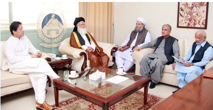
ISLAMABAD: Jamiat Ulema-e-Islam-Sherani group (JUI) leader Maulana Khan Sherani meets PTI Chairman Imran Khan.