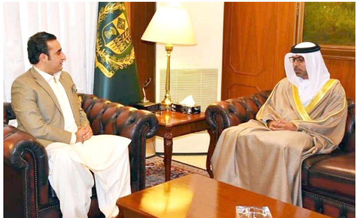
ISLAMABAD: Ambassador of UAE, Hamad Obaid Ibrahim Al-Zaabi calls on Foreign Minister Bilawal Bhutto Zardari.