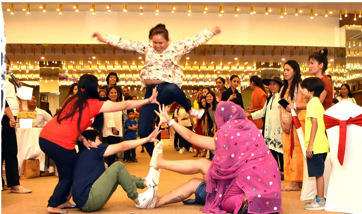
ISLAMABAD: Members of the Philippine Diaspora presenting a performance during a cultural show organized by the Philippine embassy.

ISLAMABAD: China had played a big role in promoting the education sector in Pakistan, Gwadar Pro reported on Monday quoting Minister for Planning and Development Ahsan Iqbal. "China was generously supporting Pakistan in the education sector," he said addressing the Paigham-e-Pakistan (message of Pakistan) conference. He maintained that the government had increased the higher education budget by 68% under the Public Sector Development Program (PSDP). "We have raised the budget from (Pakistani I) Rs 23 billion and set the target for Rs44 billion," he added. His remarks came a day after the government presented the federal budget worth Rs 9.5 trillion. The planning minister informed that the government had the vision to establish at least one university in every district of the country. "It is our duty to give opportunities to youth for the higher education and skills so that they can contribute back to the economy," Iqbal remarked. He announced a project to establish 250 vocational institutes across the country to provide better employment opportunities. – APP