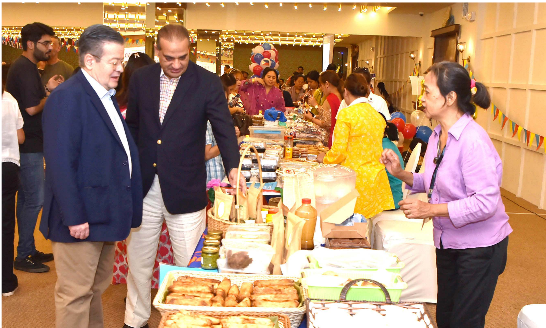
ISLAMABAD: Ambassador of France taking interest in various items during a cultural show organized by the Philippine embassy.

ISLAMABAD: Around one million Afghan refugees with children under the age of five have been issued new smart identity cards which would remain valid until June 30, 2023. Spokesman of United Nations High Commissioner for Refugees (UNHCR) said that the Documentation Renewal and Information Verification Exercise, known as DRIVE, was aimed at updating and verifying the data of Afghans holding a Proof of Registration (PoR) card. DRIVE also provided an opportunity for Afghan refugees to flag specific protection needs or vulnerabilities. More detailed information about refugees' socioeconomic circumstances will allow to better assist them for their self-reliance in Pakistan and more tailored support, for those who express their intention to return to Afghanistan, when conditions allow. He said that Government of Pakistan, with the support of UNHCR, the UN Refugee Agency, completed the verification of some 1.3 million registered Afghan refugees residing in Pakistan. Going forward, registered Afghan refugees will be able to update their registration data on an ongoing basis through 11 dedicated centres across the country. – APP