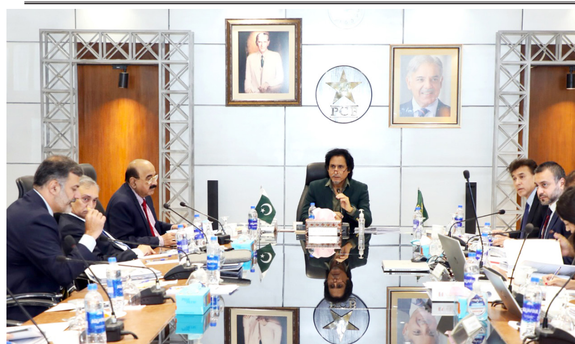
LAHORE: Chairman Pakistan Cricket Board, Ramiz Raja presiding 69th BoG meeting at the NHPC.

NEW YORK: From the streets of New York to the corridors of Congress, Americans expressed both outrage and delight at the Supreme Court's striking down of a gun law Thursday, reflecting the country's bitter divide. New York's governor Kathy Hochul said the decision marked a "dark day," while Big Apple mayor Eric Adams said it "may have opened an additional river feeding the sea of gun violence."