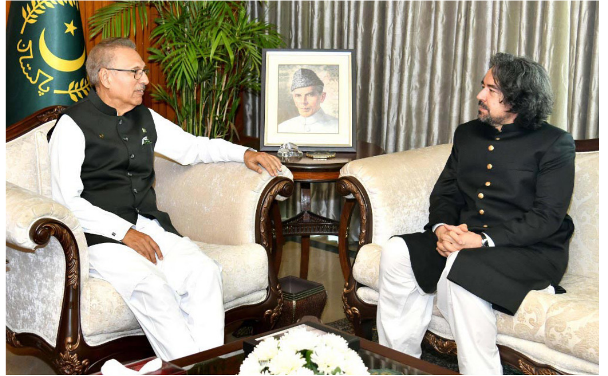
ISLAMABAD: The outgoing Ambassador of Turkey, Ihsan Mustafa Yurdakul called on President Dr. Arif Alvi at Aiwan-e-Sadr.