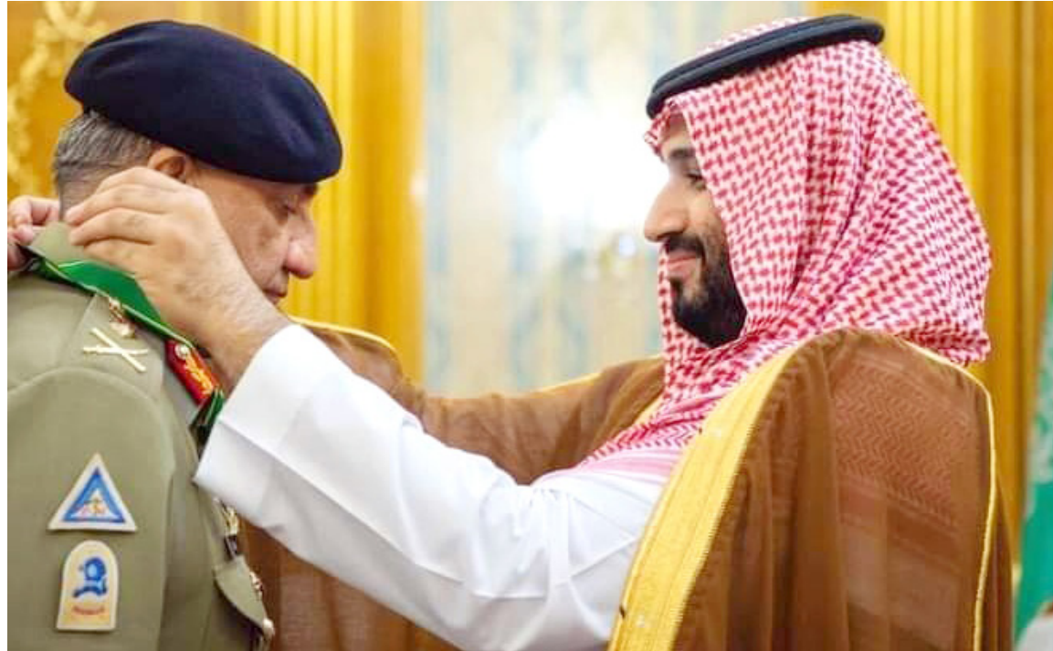
JEDDAH: General Qamar Javed Bajwa, Chief of Army staff (COAS) being conferred upon King Abdulaziz Medal of Excellence by Crown Prince Mohammad bin Salman bin Abdulaziz Al Saud.