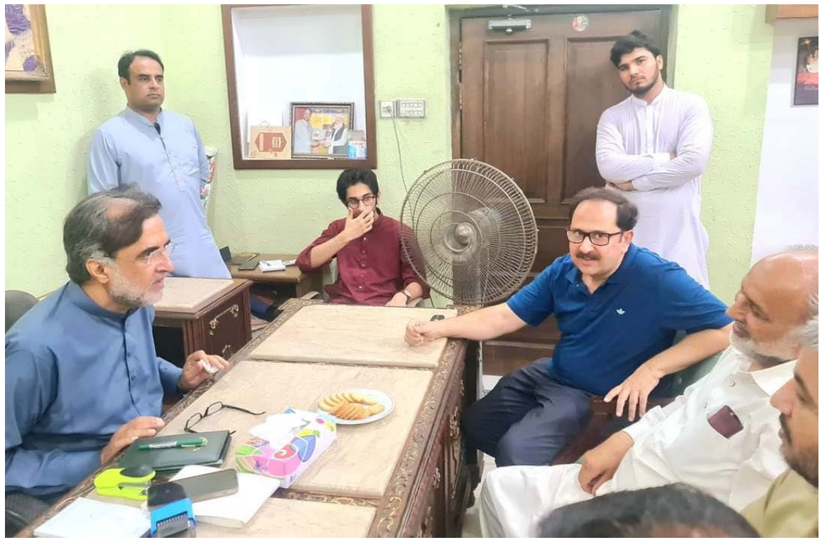
LALAMUSA: Prime Minister's Adviser on Gilgit Baltistan and Kashmir Affairs Qamar Zaman Kaibra meeting various delegations at his office in Lalamusa.

North Zone, it seems that they are always present in the office and if look at the fuel and TADA, it seems that they are always on a visit. If there is any irregularity in a project then action is taken only against the executive engineer. Why not action is taken against all those who receive heavy TA, DA and fuel bills in the name of inspection of projects. Surprisingly, the reputation of Pak PWD is being affected and no one knows anything about it. The Prime Minister of Pakistan, the Federal Minister for Housing and Works, the Federal Secretary for Housing and Works and the DG Pak PWD should immediately conduct an inquiry and also conduct a special audit. If the allegations are substantiated after the inquiry, all those responsible will be prosecuted in accordance with the law, no matter how influential someone may be.