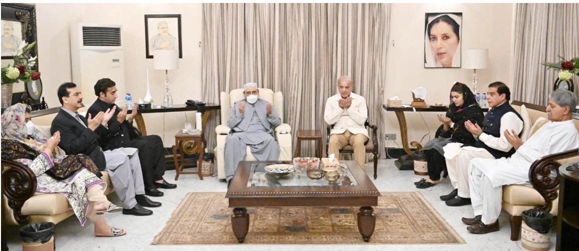
NAWABSHAH: Prime Minister Shehbaz Sharif offering Fateha for the deceased mother of Asif Ali Zardari.

KARACHI: Legendry squash player and former World Champion Jahangir Khan has said that sports has the power to build a better society and the Olympic Moment can bring people and nations from diverse origins, linguistic backgrounds, cultures and faiths together in peace and harmony. The objective of the Olympic Day celebrations is to spread the message to seeking togetherness, highlighting the power that sport has to build a better world, by uniting people under one roof in sports activities. As part of this, people are encouraged to move together for peace through a range of local and international activities. He was speaking as a chief guest at a function held in connection with the second phase of World Olympic Day celebrations by Pakistan Olympic Association Environment Commission (POAEC) here the other day. – APP