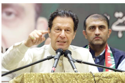
LAHORE: PTI Chairman addressing a public rally in the WAPDA Town in connection with the by-election campaign.

Asks people to vote for PTI in the by-polls