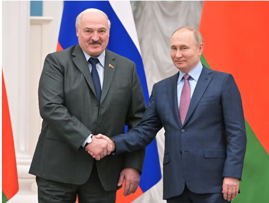
nuclear weapons amid soaring tensions with the West over Ukraine. Last month, Lukashenko said his country had bought Iskander nuclear-capable missiles and

MOSCOW: Russia will supply Belarus with missiles capable of carrying nuclear warheads after the president complained about nuclear-armed NATO flights coming close to the Belarusian border. President Vladimir Putin made the announcement on Saturday as he received Belarusian leader Alexander Lukashenko in Moscow. "In the coming months, we will transfer to Belarus Iskander-M tactical missile systems, which can use ballistic or cruise missiles, in their conventional and nuclear versions," Putin said in a broadcast on Russian television at the start of his meeting with Lukashenko in St Petersburg. At the meeting, Lukashenko expressed concern about the "aggressive", "confrontational", and "repulsive" policies of Belarus's neighbours Lithuania and Poland. He asked Putin to help his country mount a "symmetrical response" to what he said were nuclear-armed flights by the US-led NATO alliance near Belarus's borders. Putin offered to upgrade Belarusian warplanes to make them capable of carrying