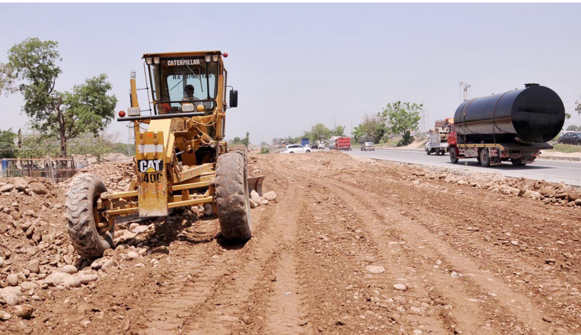
ISLAMABAD: Heavy machinery is being used to expand Expressway near PWD. – APP

ISLAMABAD: Keeping in view the plight of the public, Prime Minister Shehbaz Sharif has abolished the One Time Password System (OTP) used for purchases at utility stores. Original ID cards will now have to be displayed at the counter for purchasing subsidized items at utility stores, said a Press release issued by Utility Store Corporation (USC) here. The photocopy requirement has also been removed and declared to receive a confirmation SMS to the customer’s registered mobile number after purchase. The Utility Stores Corporation is pursuing a strategy of transparent transfer of federal government subsidies to the real beneficiaries. The Utility Stores Corporation is gradually increasing the number of POS counters at every supermarket store and mini market in Lahore and Islamabad on the direction of the Prime Minister. All zonal managers have been urged to contact all the Deputy Commissioners of Punjab and ICT for providing water coolers, tents, chairs, fans to the customers at the utility stores. Tent and water supply is already in place and orders have been issued to further improve it. Under the federal government subsidy, sugar is available at Rs 70 per kg, ghee at Rs 300 per kg and a 10 kg bag of flour at Rs 400 at all utility stores across the country. Rice and pulses are also being subsidized. In addition, more than 1,500 standard items are available at a much lower price than the general market. – APP