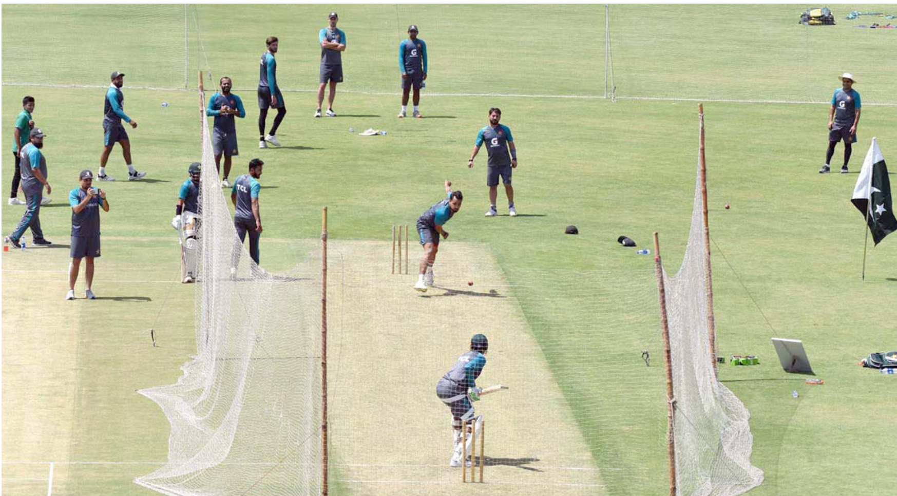
RAWALPINDI: Pakistani players take part in a practice session at Pindi Cricket Stadium for upcoming tour of Sri Lanka.

Earlier, Pakistan Tehreek-e-Insaf (PTI) Chairman Imran Khan decided to give a tough time to dissident members in the upcoming Punjab by-elections. The ECP has announced the schedule for election on 20 provincial seats vacated after defecting MPAs of the PTI were de-seated. The candidates will be announced as election symbols on June 24, while polling will be held on July 17. The ECP had de-seated 25 dissident Pakistan Tehreek-e-Insaf (PTI) MPAs who voted for PML-N's Hamza Shahbaz Sharif in Punjab chief minister's election.