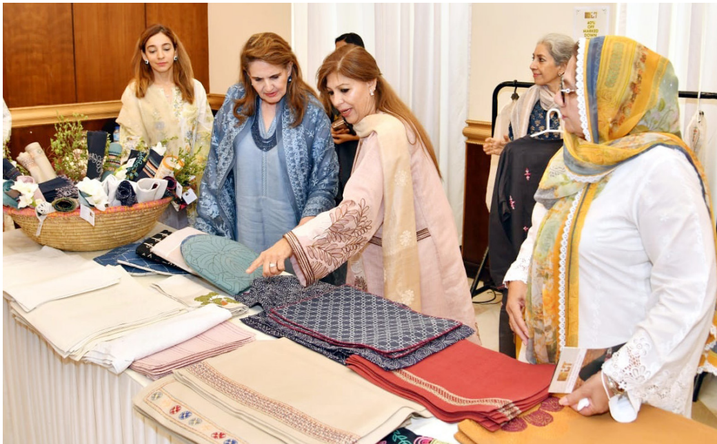
ISLAMABAD: First Lady, Begum Samina Arif Alvi, viewing the handiworks of women artisans at the arts and crafts exhibition organized by the Indus Heritage Trust, in Islamabad. – DNA

ISLAMABAD: First Lady Begum Samina Alvi on Saturday underlined the need for sustained efforts for the economic empowerment of women, especially from the under privileged areas of the country, by provision of equal opportunities in different fields. Addressing an inauguration ceremony of the arts and crafts exhibition arranged by Indus Heritage Trust titled “Celebrating the creative economy through the creative industry”, Begum Alvi stressed for revival of traditional arts and crafts which could not only help in preservation of the national heritage, but also provide equal income generating opportunities to the womenfolk. Lauding the efforts of the Trust for provision of business opportunities to the women from the underprivileged parts of the country through its efforts to preserve the traditional arts and crafts, she observed that economically empowered women always contributed towards a strong and progressive society. She said such efforts could be materialized with proper training and skills development of the womenfolk in traditional arts and