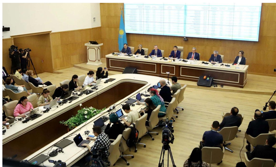
NUR SULTAN: The Chairman of the Central Election Commission announces the results of the referendum. A related news on the front page

to all of you," he said on Twitter. His tweet also included a montage of video clips and pictures of all media personnel killed in Ukraine since Russia launched the war on Feb. 24. According to the latest UN estimates, at least 4,183 civilians have been killed and 5,014 injured in Ukraine, with the true toll believed to be much higher. More than 6.9 million people have fled to other countries, while more than 7.7 million have been internally displaced, according to UN figures.