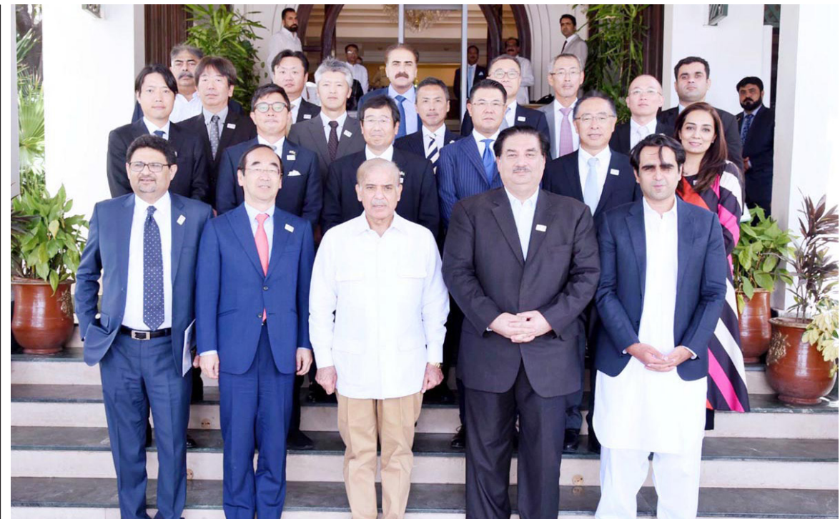
ISLAMABAD: Prime Minister Shehbaz Sharif in a group photo with a delegation of Japanese investors and representatives of Japanese companies operating in Pakistan.