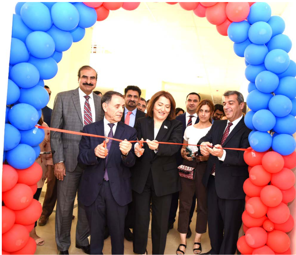
ISLAMABAD: Azerbaijan University of Languages with support of Azerbaijan Embassy opened Azerbaijan Language & Culture center at NUML. Azerbaijan Ambassador is inaugurating the center with other officials.