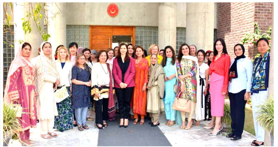
ISLAMABAD: Wives of diplomats posing for photo during a breakfast event organised by the wife of the Turkish ambassador at the Turkish residence.

role in starting direct international flights from Faisalabad and now we are trying to develop an independent civilian airport in this city." He said that originally Pindi-Bhatian-Faisalabad motorway was designed with six lanes which was later on trimmed to four due to financial constraints. He stressed the need for restoring it with six lanes as it has become imperative due to heavy traffic load on this motorway as it has been expanded up to Gojra. He also demanded that Faisalabad should be linked with Lahore-Kot-Abdul Hakeem motorway as it would reduce travel timing between Faisalabad and Lahore to one hour and ten minutes only. He also demanded expansion in Allied Hospital and Faisalabad Institute of Cardiology in addition to the repair and maintenance of Faisalabad-Chiniot Road. He also demanded that Chiniot dam should be built on priority basis to meet future needs of drinking water for this entire region.