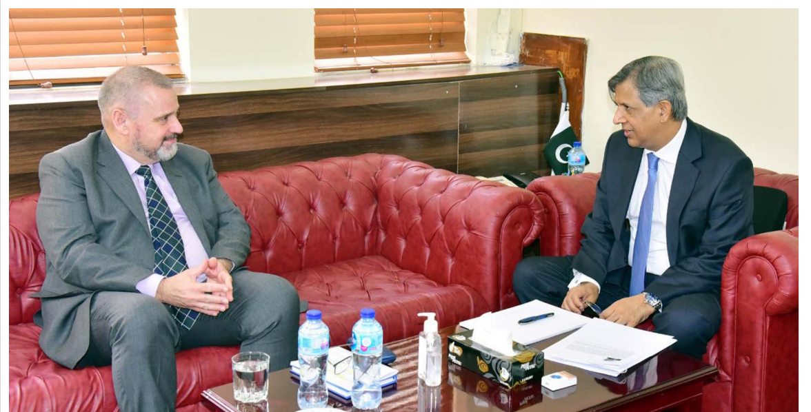
Mr. Thomas Seiler, charge d'affaires, delegation of the European union (EU) to Pakistan called on Federal Minister for Law and Justice, Senator Azam Nazeer Tarar at Ministry of Law in Islamabad. - DNA

FAISALABAD: City Police Officer (CPO) Syed Ali Nasir Rizvi on Monday held an open court (Khuli Kutcheri) at Kotwali police station and listened to the problems of the people. A large number of people thronged in the Khuli Kutcheri and presented 18 applications, complaining against police department. FESCO issues shutdown notice: The power supply from the following feeders will remain suspended on June 8, Wednesday on account of necessary repair, maintenance and expansion of electricity lines. According to the schedule, power supply from Lyallpur Chemical, al-Habib, Islamabad, Canal Road, ATM, Barala, 240 Morh, Lahore Road, Dana Abad and Ashiq Ali Shaheed feeders linked with 132-KV Jaranwala grid station will remain suspended from 6 a.m. to 8 a.m. - APP