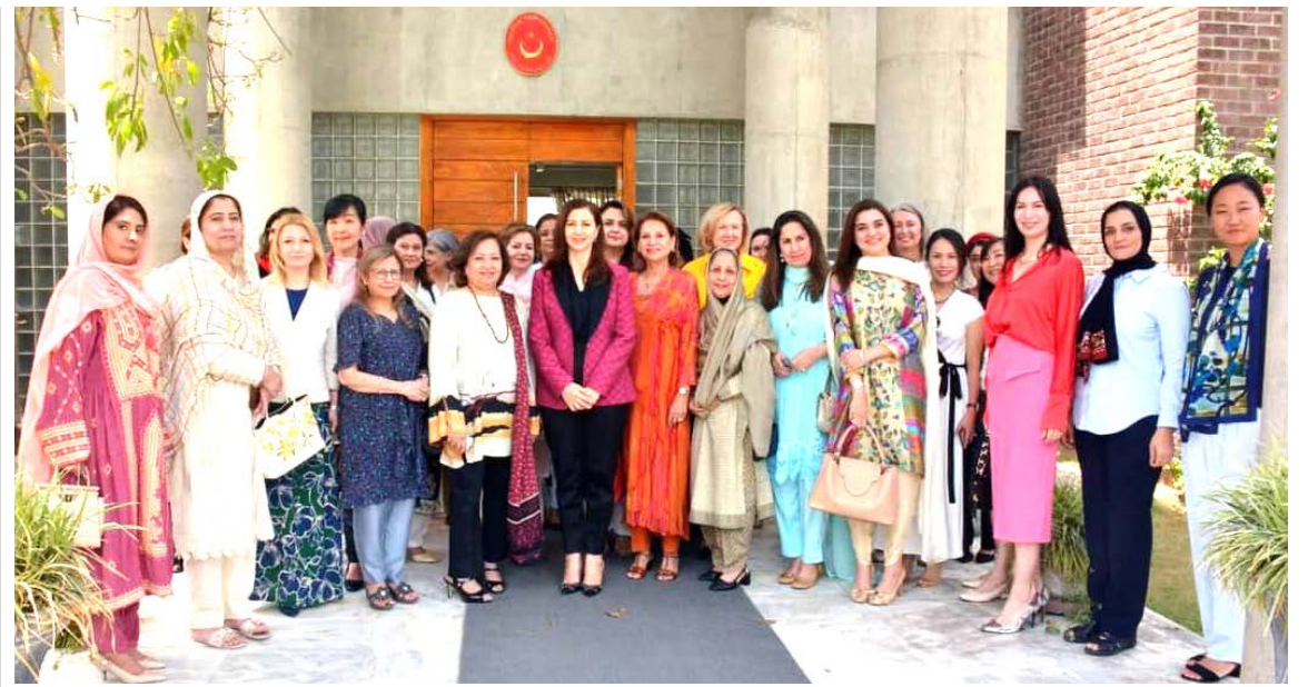
ISLAMABAD: Wives of diplomats posing for photo during a breakfast event organised by the wife of the Turkish ambassador at the Turkish residence.