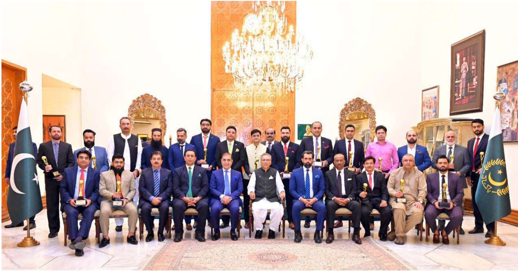
ISLAMABAD: President Dr. Arif Alvi in a group photo with the participants of Technology Awards – 2022 organized by Rawalpindi Chamber of Commerce and Industry at Aiwan-e-Sadr.

The north of Aktoke region is to expect thunderstorms at daytime. Northwesterly, westerly wind is to gust up to 18mps in the north and east during the day. The city of Aktoke is to brace for thunderstorms at daytime. The northwest, west, south, and east of East Kazakhstan region are to see thunderstorms at daytime. Southwesterly wind turning southwesterly gusting up to 15-20mps in the northwest and west is predicted.