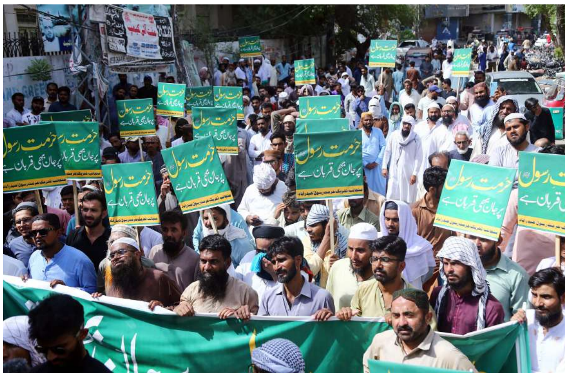
HYDERABAD: Religious party workers are holding the protest against Indian Government outside Press Club.

tive. This is the perfect time to make its mark in the industry as travel restrictions have now been lifted and people have started to travel more. In addition, it will be a sigh of relief for the customers as a new entrant will provide more options and convenience in terms of time and monetary resources when it comes to domestic travel. Sasticket.pk welcomes the arrival of Fly Jinnah and expects that the airline will perform well in the near future and mark its name in the industry.