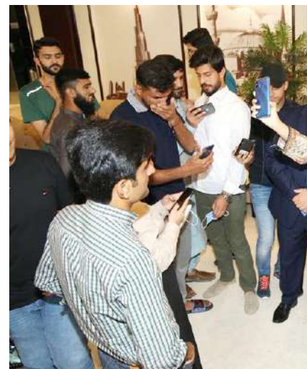
entation session, Ambassador Blome commended the students on their selection to the competitive program. The Ambassador

ISLAMABAD: US Ambassador to Pakistan Donald Blome met with a group of 44 students from across Pakistan to congratulate them on their imminent departure for the United States to attend the Study of the U.S. Institutes (SUSI) for Student Leaders program, funded by the U.S. Department of State. Participants will attend an academic program on comparative public policymaking, exploring issues of public policy and democracy in the United States and comparing U.S. policy development with that of Pakistan. Together, Pakistani and American undergraduate students will examine issues such as civil rights, food security, environmental policy, and democracy. The program will take place at the University of Massachusetts in Amherst, Massachusetts. Another group of 19 students will depart on June 25 for their program. Addressing the group at a pre-departure ori-