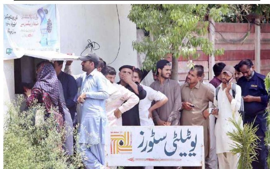
RAWALPINDI: People standing in a queue outside a utility store to purchase some groceries at F-6 Sector in the Federal Capital.