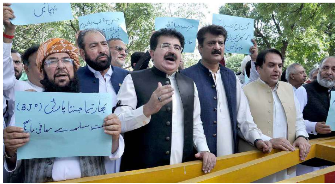
ISLAMABAD: Chairman Senate, Muhammad Sadiq Sanjrani and other parliamentarians protesting over the highly derogatory remarks made by senior officials of Indian ruling Bharitya Jantha Party (BJP) against the Holy Prophet Muhammad (PBUH), in front of Indian Embassy.

advisor, formally delivered welcome address to honourable Vice Chancellors, Focal Persons and key representatives from seven universities including University of Sargodha, Govt. College Women University of Faisalabad, Pir Mehr Ali Shah Arid Agriculture University, Kohsar University Murree, Quaid-i-Azam University, Women University Swabi, and Hazara University Mansehra.