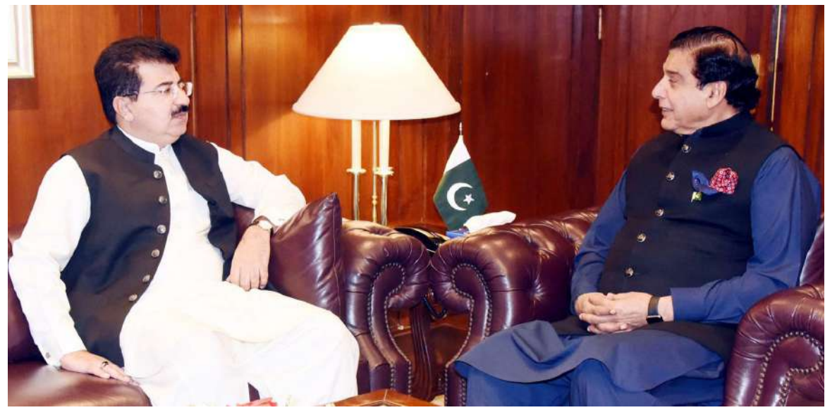
ISLAMABAD: Chairman Senate Sadiq Sanjrani called on Speaker National Assembly Raja Pervaiz Ashraf at Parliament House.