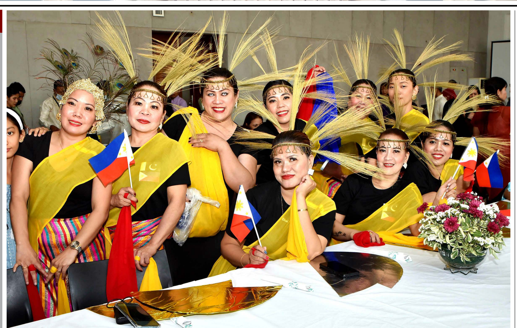
ISLAMABAD: Members of the Philippine community living in Pakistan posing for a picture on the occasion of cultural performance to mark the 124 Anniversary of the Philippine Independence Day.