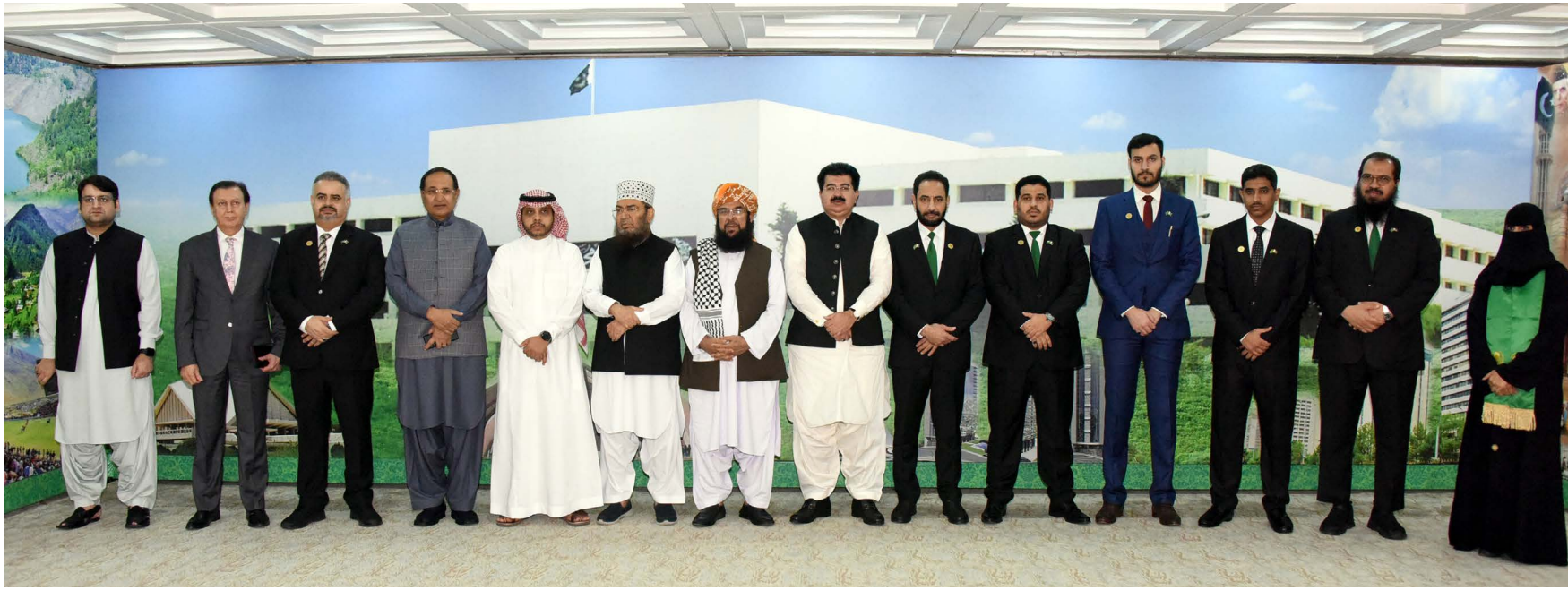
ISLAMABAD: Chairman Senate, Sadiq Sanjrani in a group photo with Saudi media delegation at Parliament House.