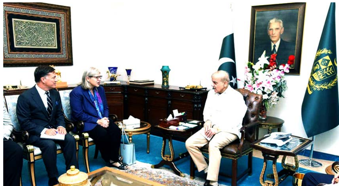
ISLAMABAD: Prime Minister Shehbaz Sharif in a meeting with High Commissioner for Canada in Pakistan Wendy Gilmour.