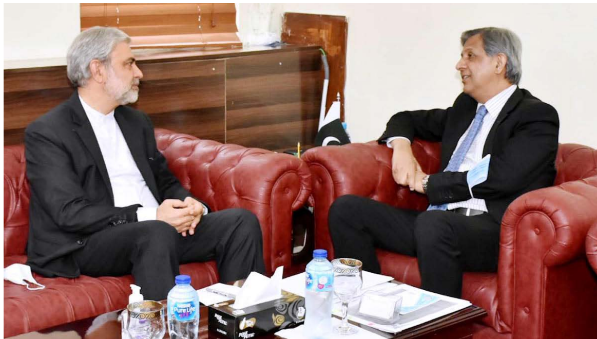
ISLAMABAD: Ambassador of Islamic Republic of Iran to Pakistan Seyed Mohammad Ali Hosseini called on Federal Minister for Law and Justice Senator Azam Nazeer Tarar at Ministry of Law.