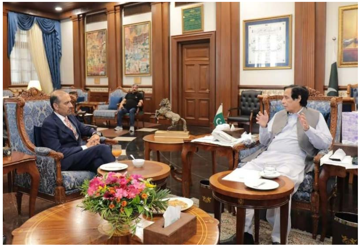
LAHORE: Special Representative for Commercial and Business Affairs Dilawar Syed met with Speaker Punjab Assembly Chaudhry Pervaiz Elahi and discuss the growing economic ties between US-Pak.

in a quandary due to the uncertain economic conditions prevailing in Pakistan. He said that we were expecting that the import substitution industry would grow due to the ban of various luxury items and rise in freight charges but this dream is not being materialized. Responding to a question about inflation, he clarified that subsidies provided for the industrial sector fall under the preview of development and it could not be considered a burden on the national kitty. He said that the industrial sector was getting electricity and gas at subsidized rates for the last three- and half-year despite the corona. He said that the business community has no affiliation with any political party as their interests are directly linked with the industry, business and trade.