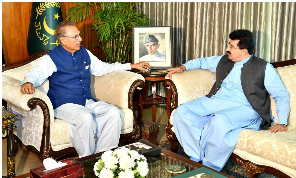
ISLAMABAD: Chairman Senate, Muhammad Sadiq Sanjrani called on President Dr Arif Alvi at Aiwan-e-Sadr.

Last month, local media and residents said masked AQAP terrorists appeared in some valleys and areas in Abyan, ambushing troops and kidnapping residents. Local security officials accuse AQAP of orchestrating a string of attacks that killed at least 10 soldiers in Abyan and Shabwa governorate last month. In 2015, AQAP exploited instability stemming from the war in Yemen to seize large swaths of land in southern governorates, including Hadramout, Abyan and Lahj. Thanks to military support from the Arab coalition, Yemeni troops managed to push AQAP from key cities, killing and capturing hundreds of terrorists.