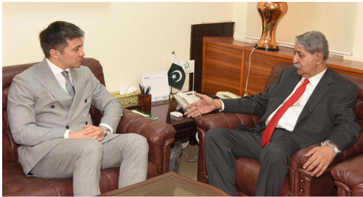
ISLAMABAD: Ambassador of Kazakhstan, Yerzhan Kistafin exchanging views with Federal Minister for Commerce, Naveed Qamer.

It is worth mentioning that Islamabad police have merged all police emergency services at Safe City and introduced new helpline with the name of "Pukaar-15" for prompt action in case of any mishap and provision of police report to the complainant on the spot. Police said that Interior Ministry has directed the revamping of Safe City and reforms in the police. - APP