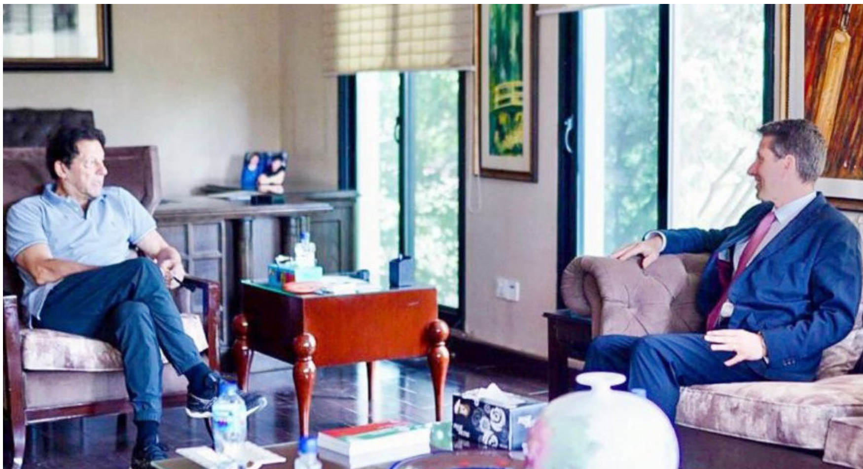
ISLAMABAD: British High Commissioner Dr. Christian Turner calls on PTI Chairman Imran Khan.