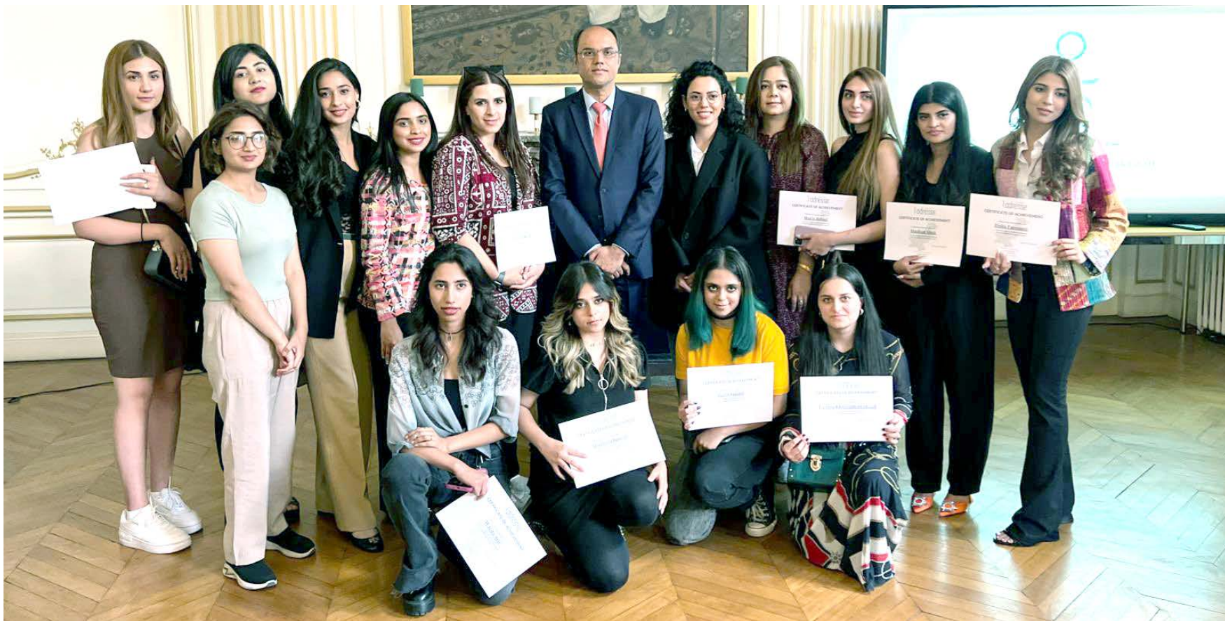
PARIS: Fashion students and young designers from Pakistani universities visited the embassy and interacted with the Cd'A. They discussed their experience of a Brand Building Summer Course organised by L'adresse Paris.

JAKARTA: The US Secretary of State Antony J. Blinken will travel to Bali, Indonesia, to attend the G20 Foreign Ministers' Meeting scheduled on July 6-9, 2022. "Secretary Blinken will first travel to Bali, Indonesia, to attend the G20 Foreign Ministers' Meeting, and then Bangkok, Thailand, from July 6 to July 11, 2022," US Department of Foreign Affairs spokesperson Ned Price noted in a press statement issued by the US Embassy here on Wednesday. At the G20 meeting in Bali, Blinken will reinforce US' commitment to working with international partners to confront global challenges, including food and energy insecurity and the threat of Russia's continued war against Ukraine, according to the statement. - ANTARA