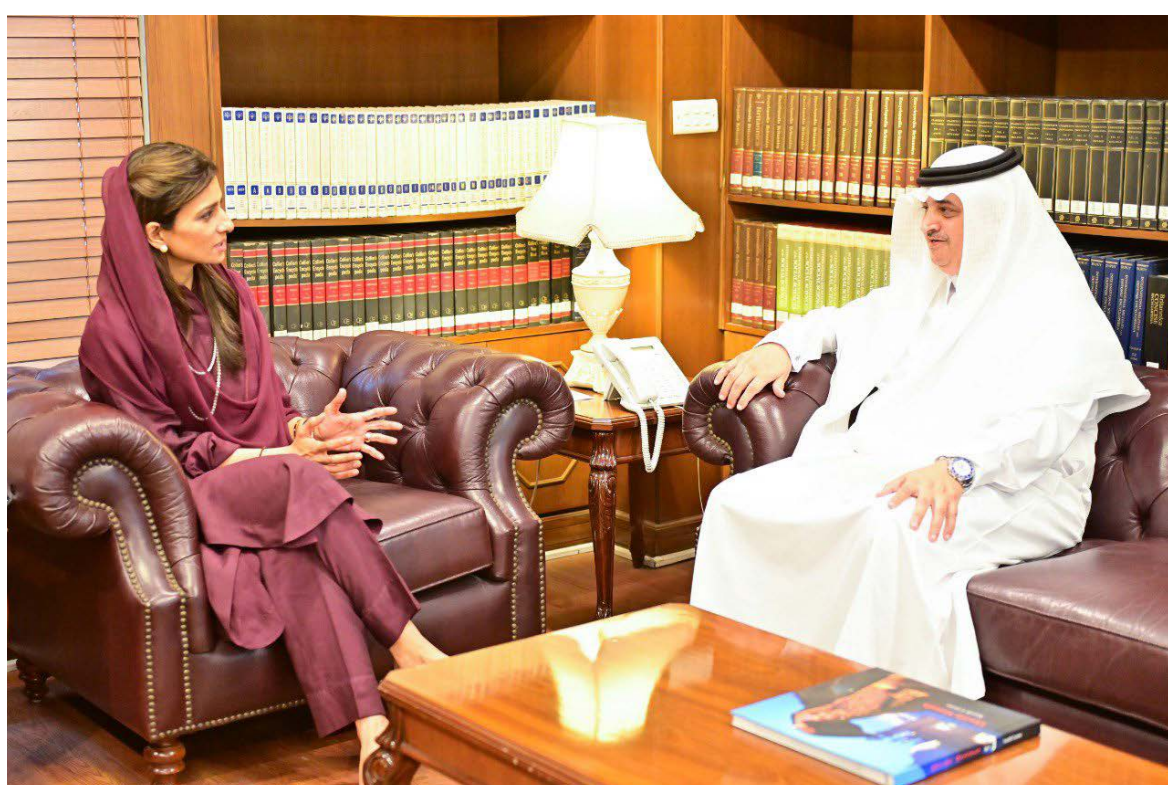
ISLAMABAD: Ambassador of Saudi Arabia Nawaf Bin Said Al-Malki calls on State Minister for Foreign Affairs, Hina Rabbani Khar. - DNA

covered the topics of Earth, Atmosphere, Aviation, Rocketry and Satellite Technology and concluded with an exciting session on Astronomy & Astrophysics. The participating students were engaged in a structured process of brainstorming and information exchange through interactive hands-on activities. The students also got firsthand experimental experience on especially designed space technology kits, including telescopes, small satellites, quadcopters, water rockets, and navigation receivers. The workshop was aimed at familiarizing the youth of these districts with the latest techniques and modern trends of space science and technology. The initiative was designed to incorporate this distinct segment of the society towards harnessing the potential of space science and technology for the socio-economic development of Pakistan. - APP