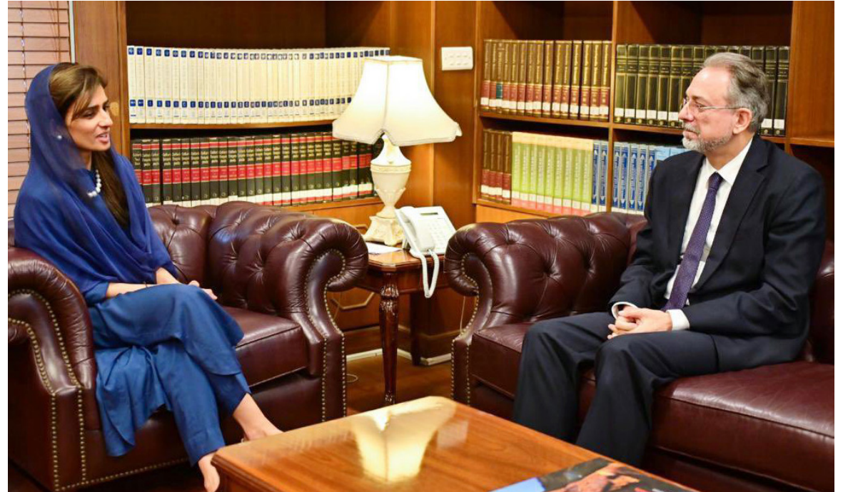
ISLAMABAD: Minister of State for Foreign Affairs, Hina Rabbani Khar exchanging views with Ambassador of Türkiye Mehmet Pacaci at the Foreign Office.