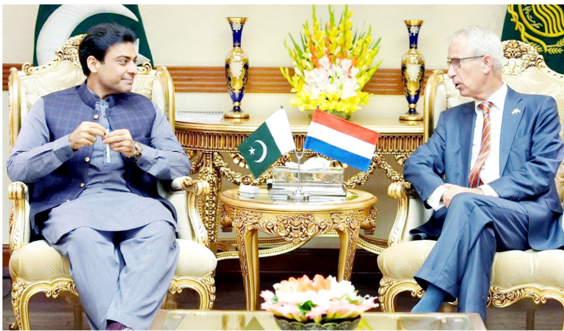
LAHORE: Ambassador of the Netherlands to Pakistan Wouter Plomp meets Punjab Chief Minister Hamza Shahbaz.

tial source for creation of livelihood for thousands of people and can bring prosperity in the region badly impacted by terrorism and militancy, Zia added. Zia said role of PAJCCI in promotion of Pak-Afghan trade would be remembered in the region and will benefit hundreds of thousands of people across the border. He also expressed the hope that after completion of PAJCCI's sponsored meetings of stakeholders of Pak-Afghan trade will bear more fruits in removal of hurdles and improvement of bilateral trade between the two countries. In this connection he also gave a mention of recent meetings of stakeholders in Peshawar and Chaman (Baluchistan) for holding discussion in regard with barter trade and for recommending a viable policy to both the governments.