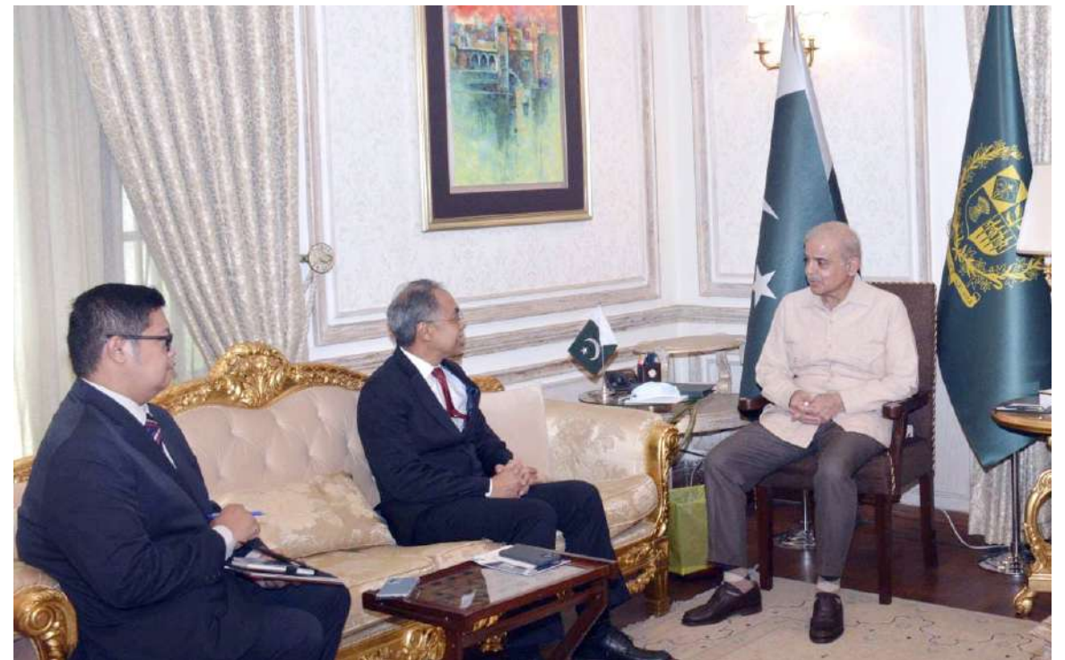
LAHORE: Ambassador of the Republic of Indonesia for Pakistan Adam Mulawarman Tugio calls on Prime Minister Shehbaz Sharif. - DNA