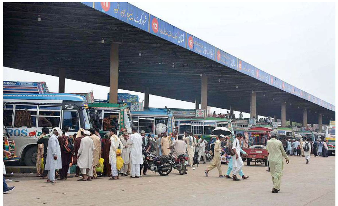
FAISALABAD: People arrives at General Bus Stand to leave for hometowns to celebrate Eid ul Azha with their loved ones.