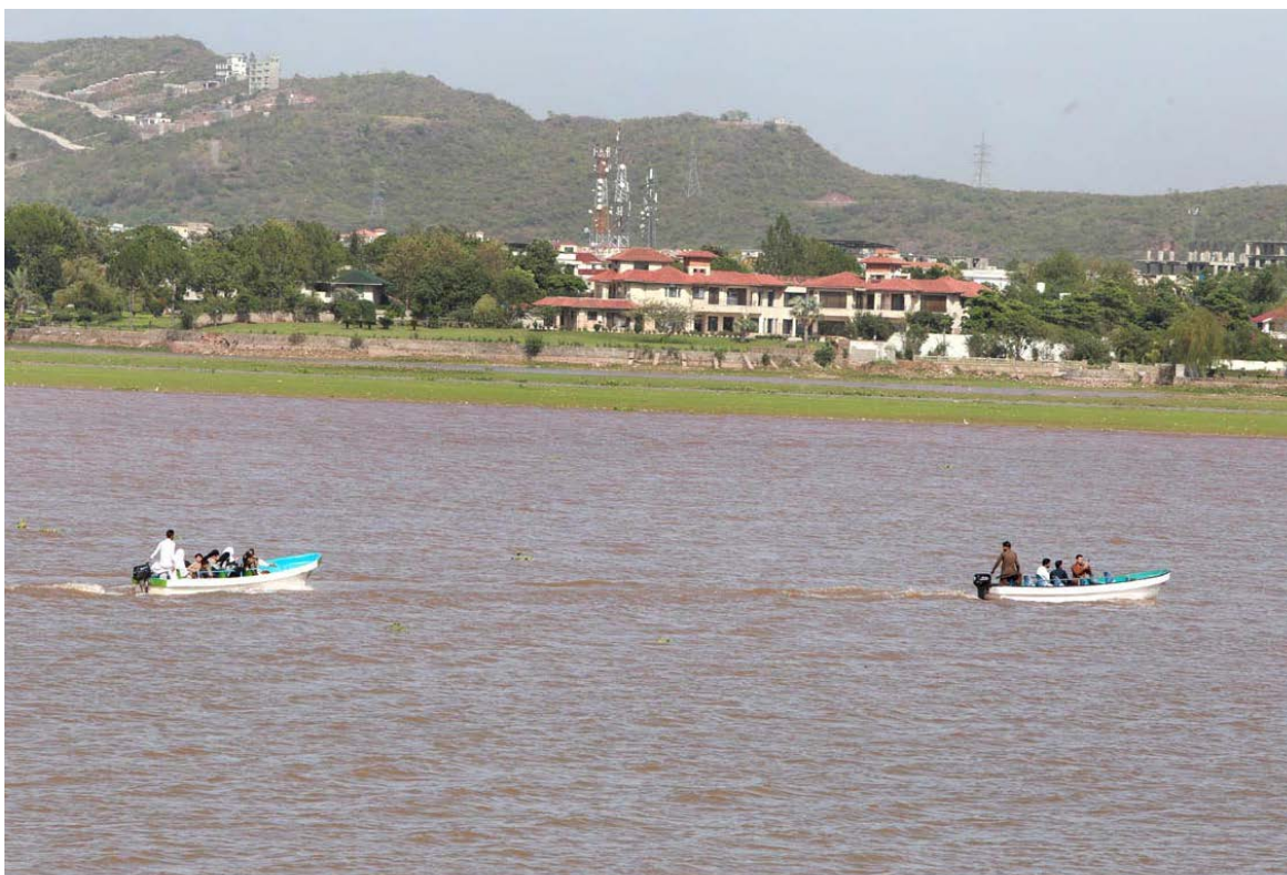
ISLAMABAD: People enjoying boat riding at Lake View Park in the Federal Capital. - APP

He said the government had given top priority to the subject of population and its development in order to address the matters related to the country's population inclusively. He expressed the hope that Pakistan would take every step possible to fulfill its international commitments and implement the National Action Plan on population while taking all stakeholders and implementing partners on board. The minister highlighted the need for raising awareness about family planning among the citizens to control the exponentially rising population of Pakistan. He urged the provincial governments, civil society organizations, and the private sector to join hands with the Federal Government to advance the agenda of population and development in the country. - APP