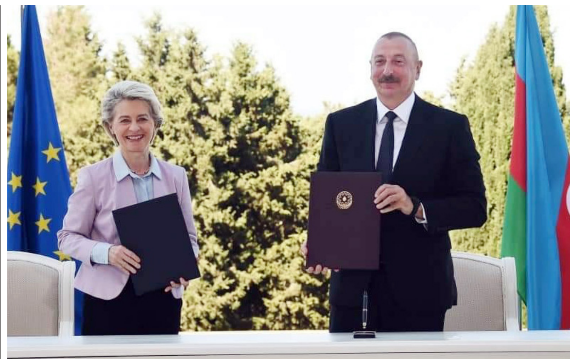
BAKU: President of Azerbaijan Ilham Aliyev and President of European Commission Ursula von der Leyen signed MoU on Strategic Partnership in field of energy.

in transparent, impartial elections and the observance of democratic governance and the election of the previous day is a practical demonstration of this. She said when Imran Sahib had the federal government and Punjab government, he created records of rigging and broke the constitution on April 3 to save himself. "On the contrary, the Muslim League (N) did not use its power in the Federation and Punjab to kidnap the staff of the Election Commission, attack the constitution and violate the constitution," added Mariyum Aurangzeb.