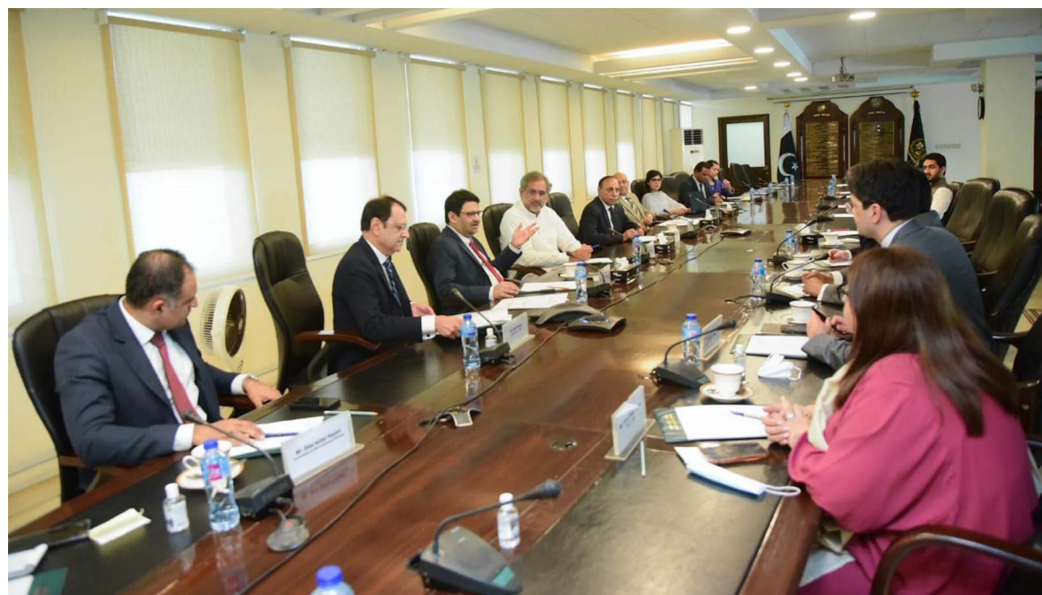
ISLAMABAD: Federal Minister for Finance and Revenue Miftah Ismail held a meeting with representatives of Pakistan Pharmaceutical Industry at Finance Division.