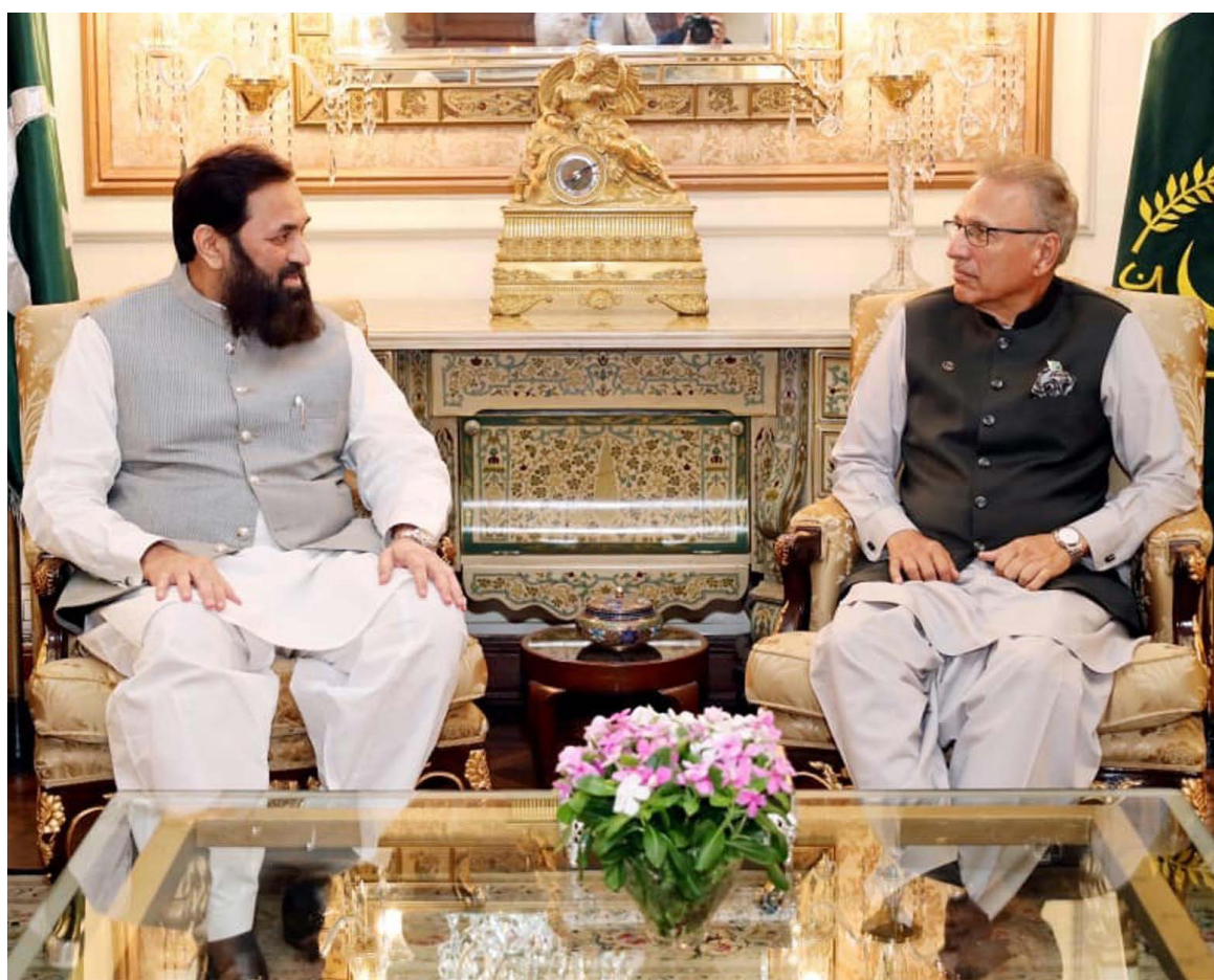
LAHORE: President Dr Arif Alvi meeting with Governor Punjab, Baligh Ur Rehman, at Governor House, Lahore.