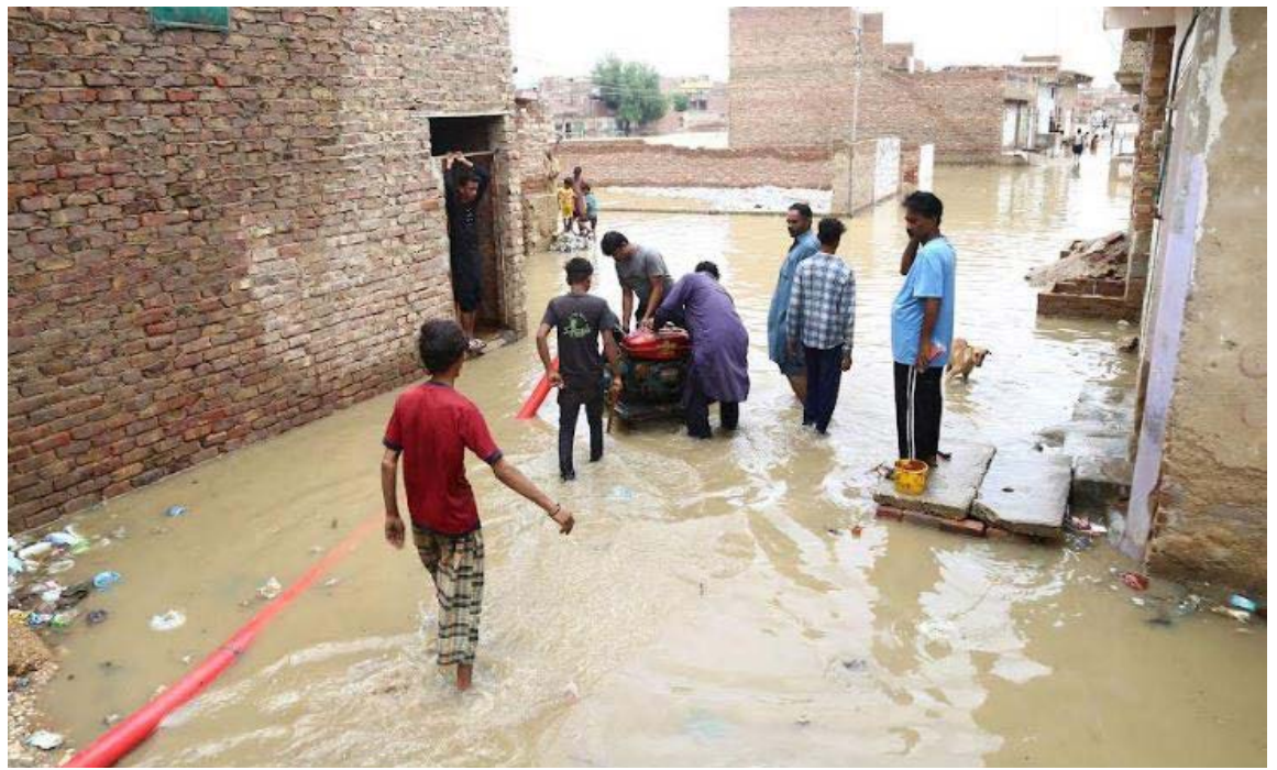
HYDERABAD: District employees draining out rain water from the streets.