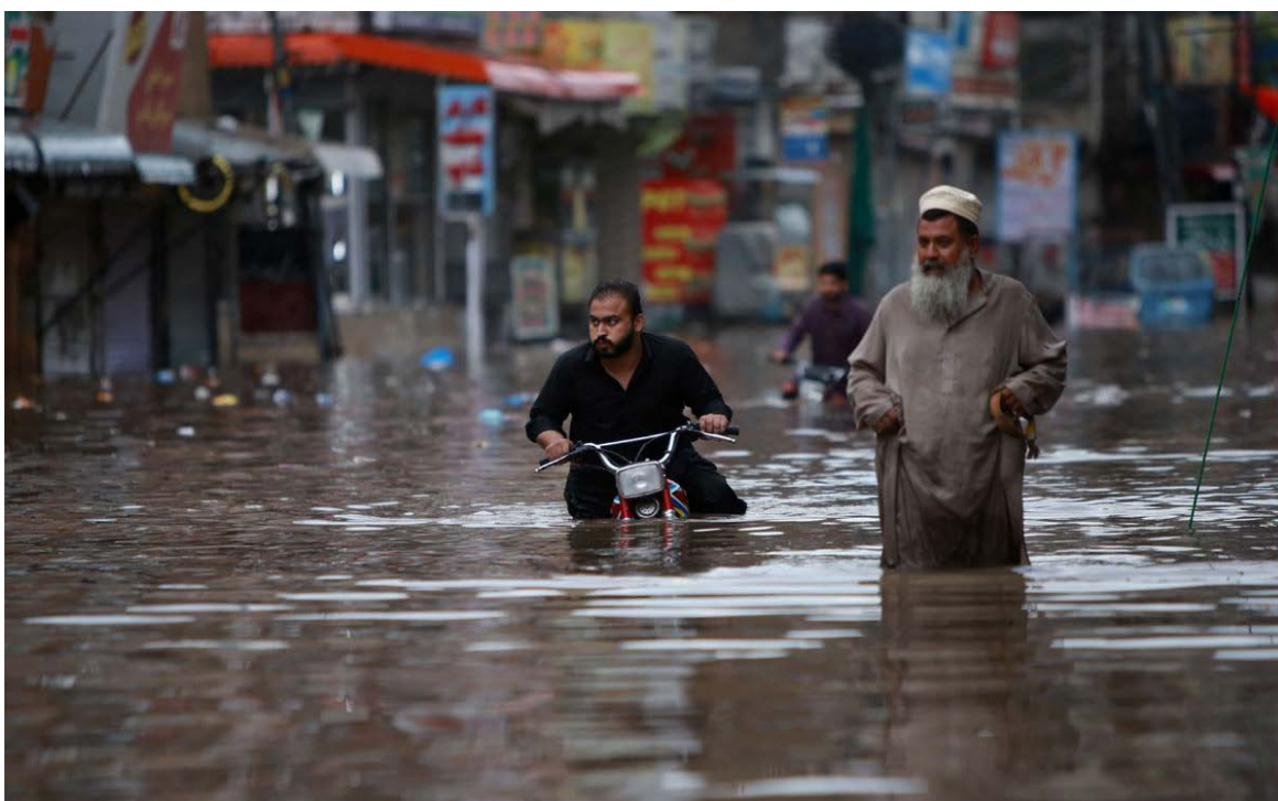
RAWALPINDI: Motorcyclist struggles to pass through accumulated rain water after heavy rain in the city. – APP

ISLAMABAD: Furniture exports during the twelve months of fiscal year of 2021-22 grew up by 79.74 percent as compared to the exports of the commodity during the corresponding period of last year. During the period from July-May 2021-22, Furniture worth US $9,361 were exported as compared to the exports of US $ 5,208 during the same period of last year. According to the data released by the Pakistan Bureau of Statistics, the exports of Gems increased by 14.10 percent, worth US $ 7,626 as compared to exports of $6,684 during the same period of last year. Meanwhile, Jewellery exports also increased by 4.56 percent as the exports during current fiscal year recorded worth US $14,361 as compared to the exports during the same period of last year which recorded US $13,735. During the period under review, Guar and guar products exports increased by 40.26 percent, worth US$ 49,549 in current fiscal year, as compared to the exports of valuing US$ 35,326 of the same period of last year. – APP