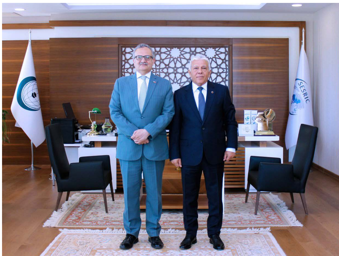
ANKARA: Pakistan ambassador to Türkiye, Syrus Qazi paid a courtesy visit to Nebil DABUR, DG of SESRIC, a subsidiary of OIC.

The diplomatic relations between Azerbaijan and the United Arab Emirates were established on September 1, 1992. The trade turnover between the two countries amounted to $50.4 million in 2021. Last year, Azerbaijan and the UAE signed agreements on pilot projects in renewable energy. Under the agreement, the building of a 230-MW solar power plant is envisaged. On March 15, a groundbreaking ceremony for the 230 MW Garadagh solar power plant, to be constructed by the United Arab Emirates' Masdar company, was held in Baku's Gulistan Palace. The plant is designed to produce 500 million kWh of electricity per year and supply it to approximately 110,000 households. It will reduce gas consumption by 110 million cubic meters and environmental emissions by 200,000 tons.