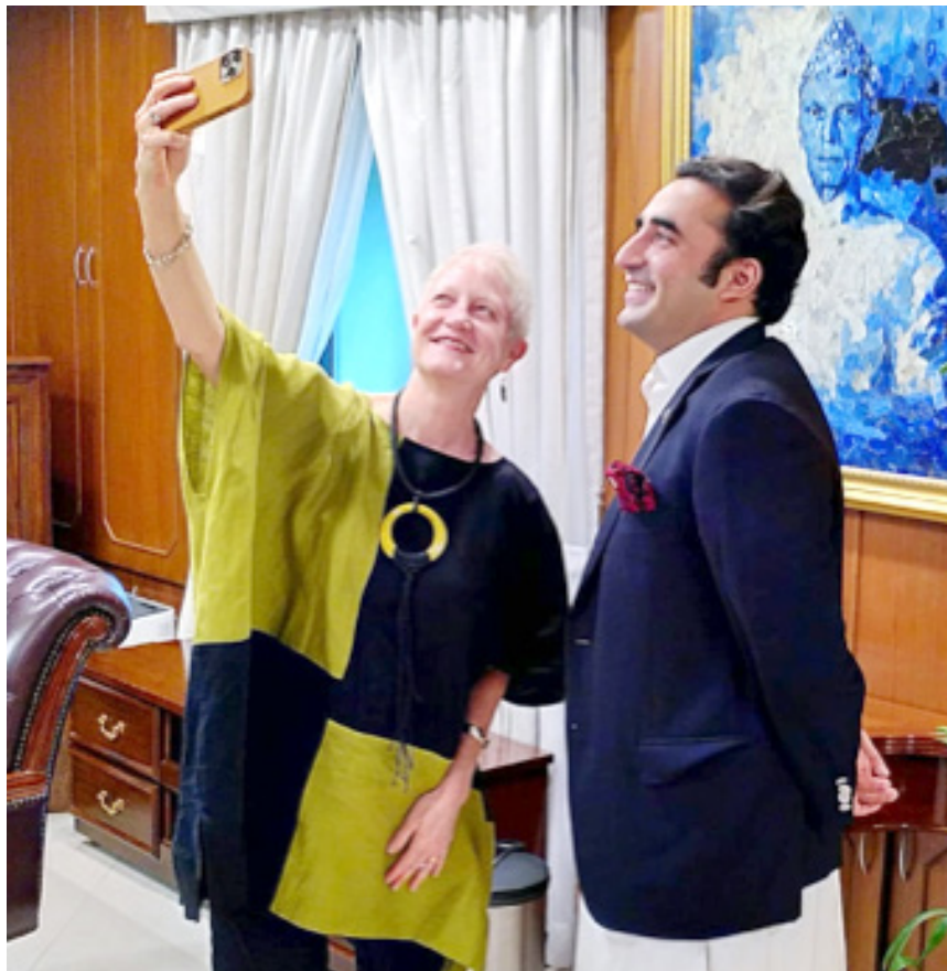
ISLAMABAD: Ambassador of European Union Riina Koinka taking a selfie with the Foreign Minister Bilawal Bhutto Zardari during her visit to the Ministry of Foreign Affairs.

tions (ISPR) news release said. The Forum took comprehensive review of the security situation with particular focus on Border and Internal Security. The COAS lauded successful ongoing counter terrorism operations and paid rich tribute to the supreme sacrifices of officers and men to ensure security of borders and safety of masses. The COAS also appreciated the efforts of formations in relief operations to mitigate challenges of people affected due to floods and heavy rainfalls in the country. "The forum reaffirmed the resolve of the Armed Forces to extend complete support to civil administration in rescue and rehabilitation activities," the ISPR said.