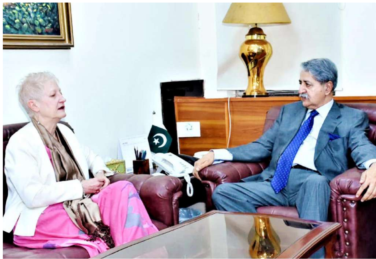
ISLAMABAD: EU Ambassador Dr. Riina Koinka meets with Federal Minister for Commerce, Syed Naveed Qamar.

In Gwadar, Army dewatering teams had cleared Gawadar area whereas the costal highway blocked at Aghore was opened for traffic. In Jhal Magsi, four sorties of Army aviation helicopters operated delivering 1.3 tons of relief items including rations and medicines. Water level considerably receded after no rain was reported in the area. The connectivity of Gandhawa was resumed with Jhal Magsi, and efforts were underway to resume connectivity on other two roads whereas 200 individuals were evacuated. In Khuzdar, water level was still high in Mula River whereas work on connectivity of M-8 would be resumed by NHA after water recedes. The General Officer Commanding at Khuzdar also visited Bela and surroundings to oversee relief efforts.