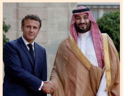
The 36-year-old became a pariah in the West following the killing of Washington Post journalist Jamal Khashoggi by Saudi agents inside Saudi Arabia's consulate in Istanbul

Paris, July 29 (AFP/APP): Saudi Arabia's Crown Prince Mohammed bin Salman on Friday thanked French President Emmanuel Macron for his "warm reception" during talks in Paris that have outraged rights groups. "As I leave your friendly country, it gives me great pleasure to express to your Excellency my deepest gratitude and appreciation for the warm reception and hospitality accorded to me and the accompanying delegation," bin Salman wrote in a message posted by the Saudi foreign ministry. The dinner on Thursday evening was the latest step in the diplomatic rehabilitation of the de-facto leader of the Saudi kingdom.