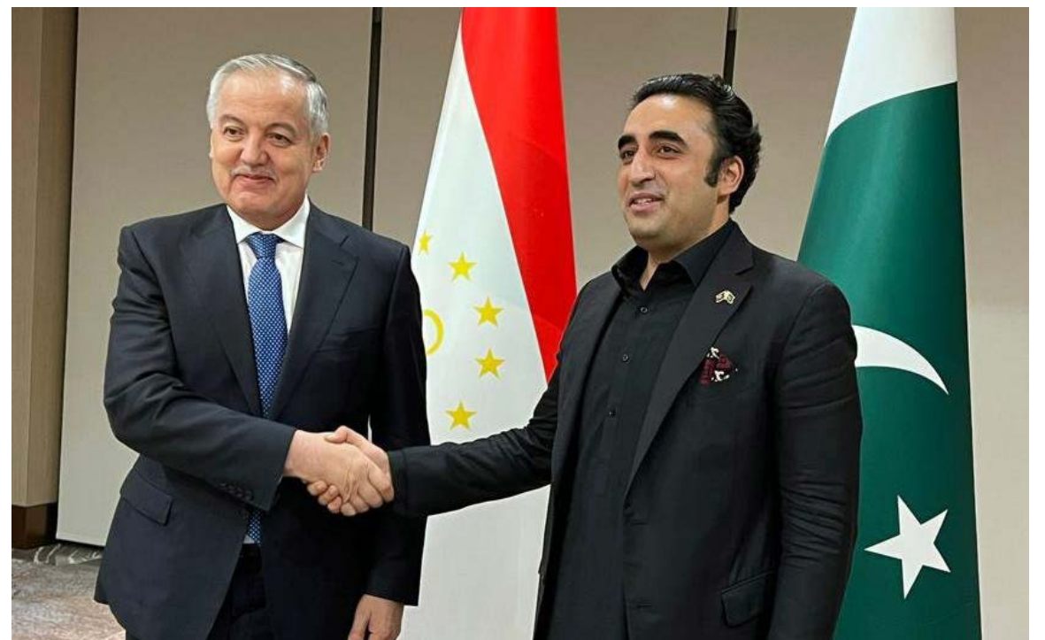
TASHKENT: Foreign Minister Bilawal Bhutto Zardari meets with Foreign Minister of Tajikistan Sirojiddin Muhriddin on the sidelines of the SCO Foreign Ministers moot.