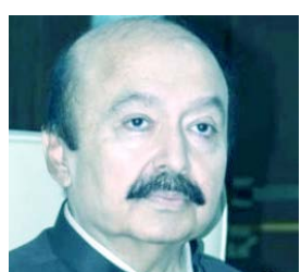
LAHORE: The Punjab Assembly elected PTI's Sibtain Khan, who was a joint candidate of his party and the PML-Q, as the new speaker on Friday. The Punjab Assembly speaker's seat fell vacant after the former office bearer, Pervez Elahi was elected as the Punjab chief minister.