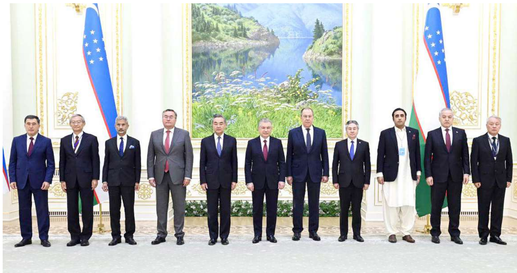
TASHKENT: President of Uzbekistan Shavkat Mirziyoyev has received the Heads of delegations of the SCO member states, who are to be taking part in the meeting of the Council of the Ministers of Foreign Affairs of the SCO.

KARACHI: Chief Minister Sindh Syed Murad Ali Shah telephoned Chief Minister Balochistan Abdul Qudus Bizenjo and expressed solidarity on the losses and damages caused by heavy rains in the province and offered him full support. The CM Sindh made this call on the directives of Chairman PPP Bilawal Bhutto Zardari, said a statement issued here on Friday. "The heavy downpour has caused serious damages to our Baloch brothers living in Chagi, Qila Saifullah, Noshki districts and various other areas, and they need our support," Bilawal Bhutto told Murad Ali Shah. During the telephonic contact, the CM Sindh offered every kind of support to the CM Balochistan for the rehabilitation of the rain-affected people. "We had sent 500 tents to Lasbela on Wednesday and dispatching 100 more tents to Uthal today [Friday]," he said, adding that the Relief Department Sindh would coordinate with the concerned divisional commissioners in Balochistan for dispatch of other relief items.