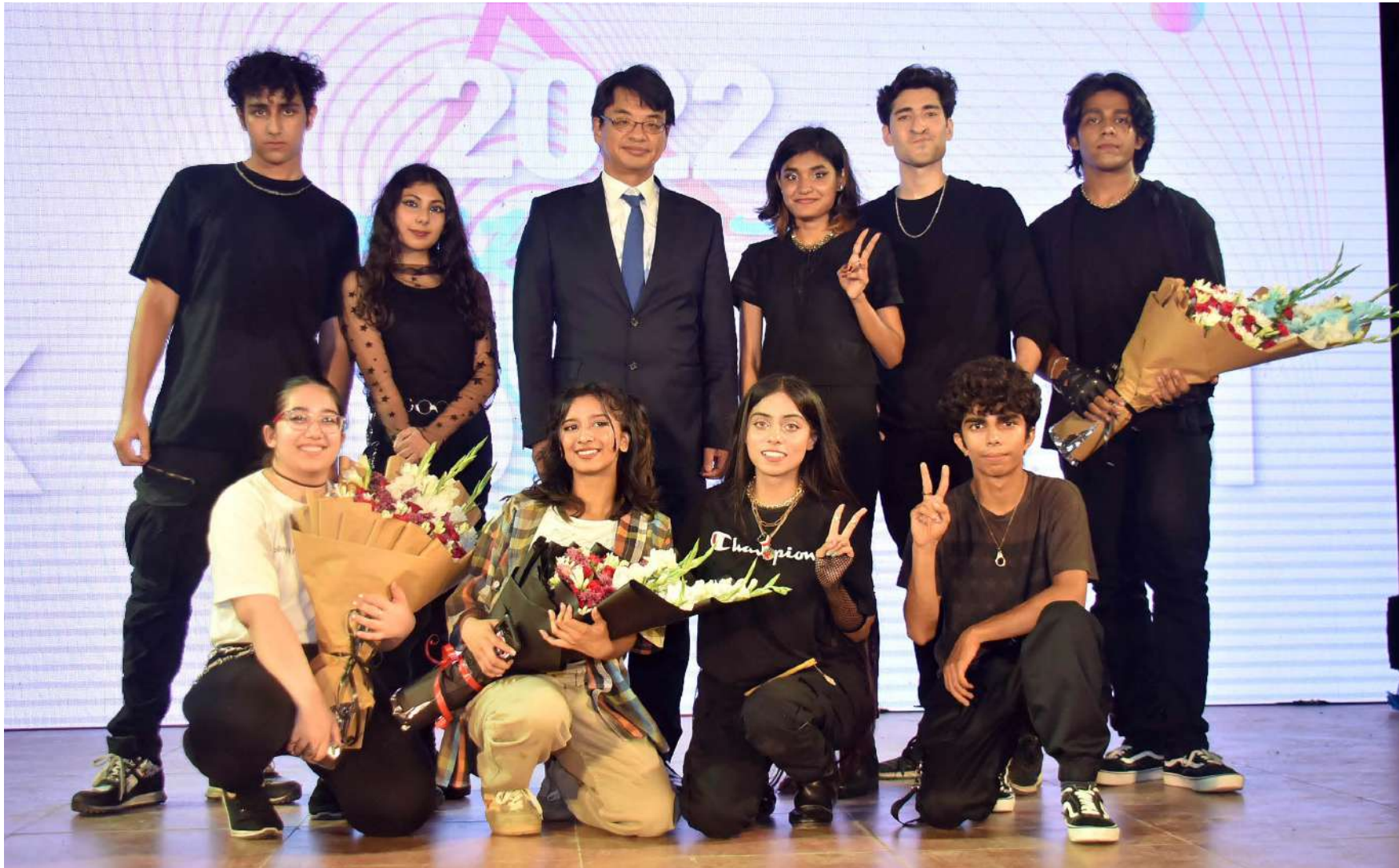
ISLAMAAD: Ambassador of Republic of Korea Suh Sangpyo in a group photo with winners of the KPOP music competition, organized by the Korean embassy