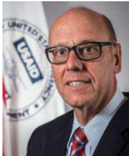
uation ceremony: "As we celebrate 75 years of relations with Pakistan this year, today's milestone shows the scope of this amazing partnership. This program supports wom-