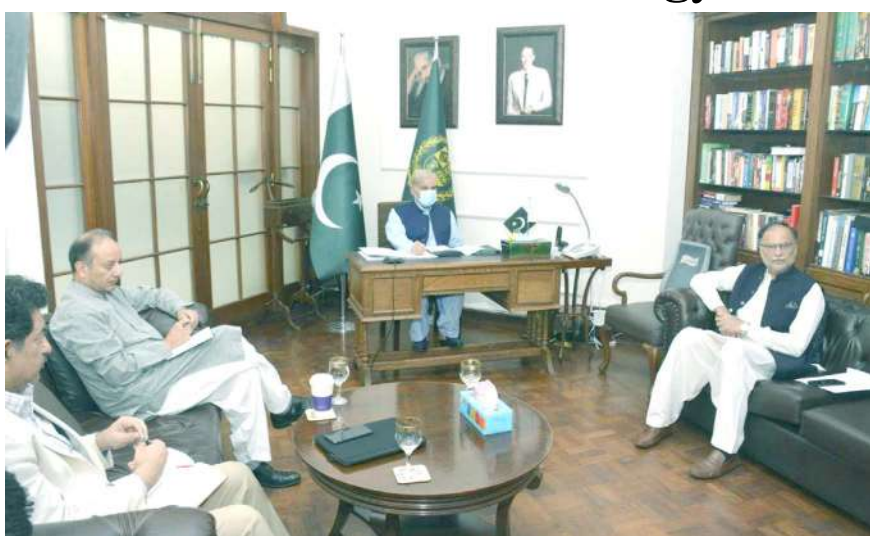
LAHORE: Prime Minister Shehbaz Sharif chairing a meeting on power load-shedding issues. - DNA

Prime Minister chaired a meeting to overcome the issues of energy crises