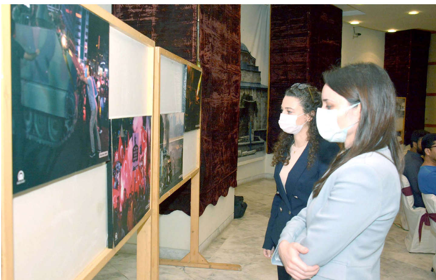
ISLAMABAD: Women taking interest in pictures displayed during the press briefing by the Ambassador of Turkiye about the thwarted coup attempted by Fethullah Gülen Terrorist Organization (FETO) and Democracy and National Unity Day.

our greatest strength. The inauguration of this new Lincoln Corner will continue to strengthen those ties. The U.S. Embassy is proud to partner with educational institutions and the government of Pakistan to ensure young Pakistanis are prepared to face 21st century challenges." Representatives from the U.S. Embassy joined NUST leadership, faculty, and students in the inauguration event of the latest Lincoln Corner, one of 18 across Pakistan. By hosting a Lincoln Corner, NUST joins a strong network of partnerships between the U.S. Mission to Pakistan and Pakistani institutions of education and culture.