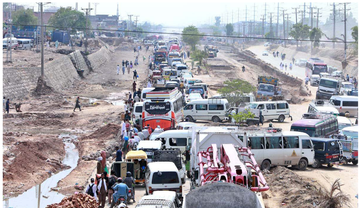
RAWALPINDI: A view of massive traffic jam at Pirwadhai.