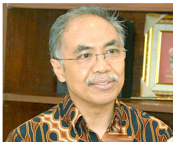
ISLAMABAD: Ambassador of Indonesia Adam Tugio giving details of the upcoming cultural exhibition.

cultural links between the two brotherly countries. 'A Night at Lok Virsa Museum' intends to feature the fusion of Indonesia-Pakistan's cultural history and artworks through a selected collection of photographs and videos, which will shed light on the inter-regional connectivity and cross-cultural influence during the course of history of respective countries. The exhibition aims to offer fresh perspectives into historical connections, religious backgrounds, and the confluence of civilization of both countries from past to present', he added. Ambassador Tugio further said, the Exhibition will highlight the religious-cultural influence and similarities between