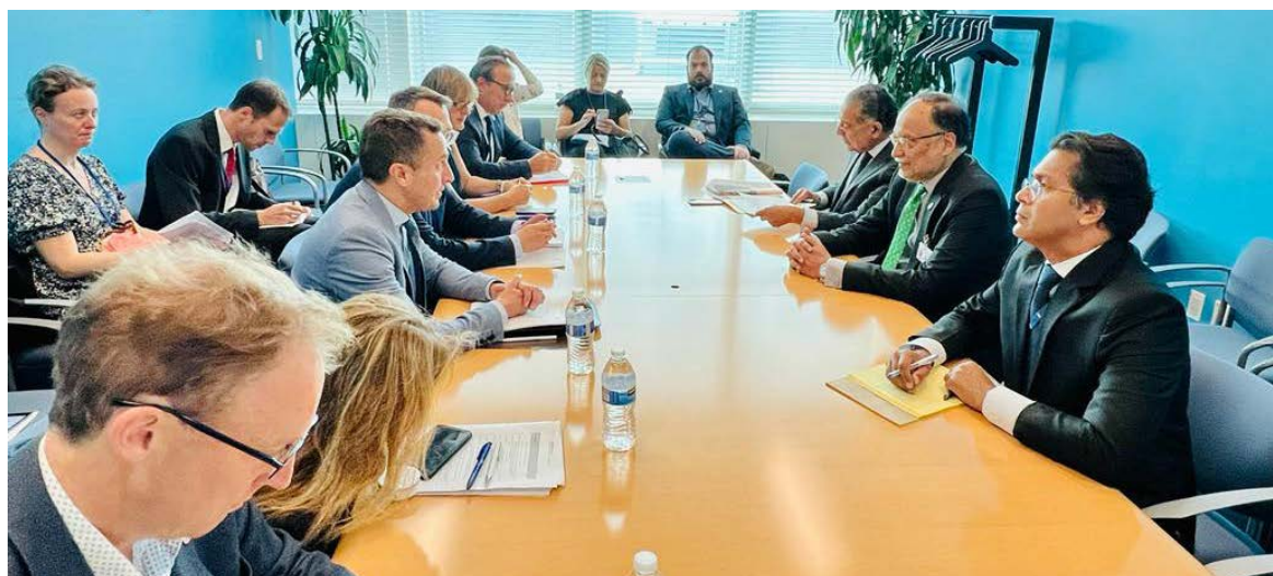
NEW YORK: Minister for Planning, Development and Special Initiatives, Prof. Ahsan Iqbal is meeting with members of the European Parliament on the sidelines of Un HLPF 2022. - DNA

nation that does not recognise it. In 2017, his predecessor, Donald Trump, made the journey in reverse. Riyadh has repeatedly said it would stick to the decades-old Arab League position of not establishing official ties with Israel until the conflict with the Palestinians is resolved. But the kingdom did not show any opposition when its regional ally, the United Arab Emirates, established diplomatic ties with Israel in 2020, followed by Bahrain and Morocco under the US-brokered Abraham Accords.