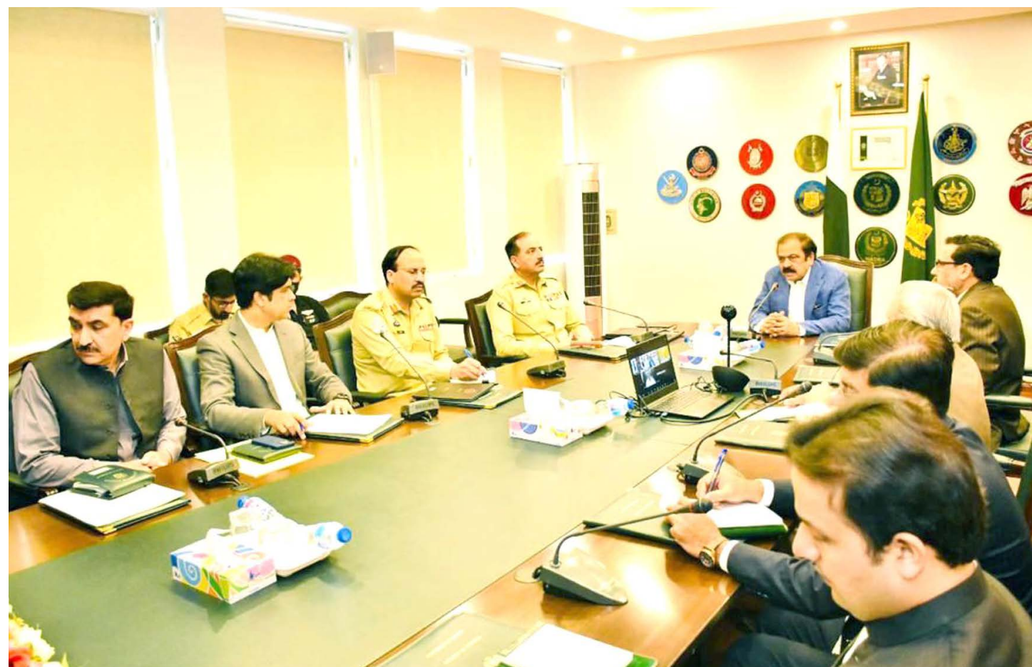
ISLAMABAD: Federal minister for Interior Rana Sana Ullah chairing a meeting to finalize security arrangements for By-Elections.