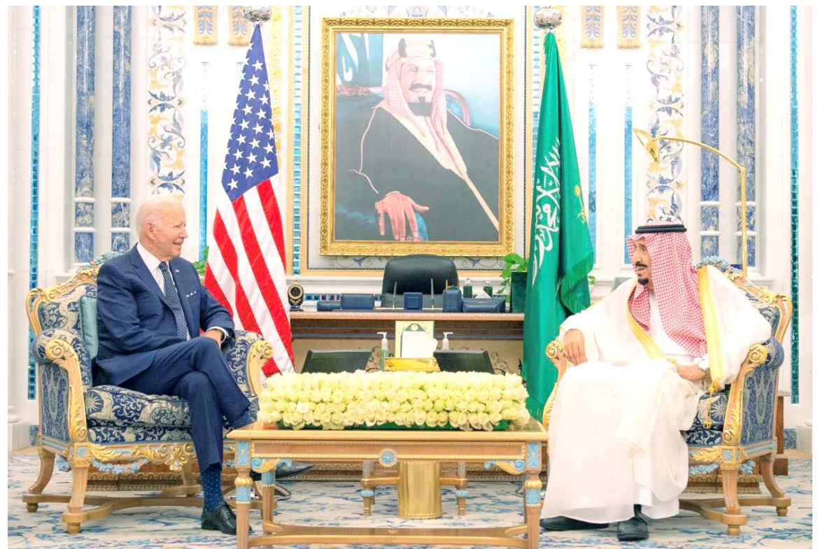
JEDDAH: The Custodian of the Two Holy Mosques, King Salman Bin Abdul Aziz meets President of America Joe Biden.