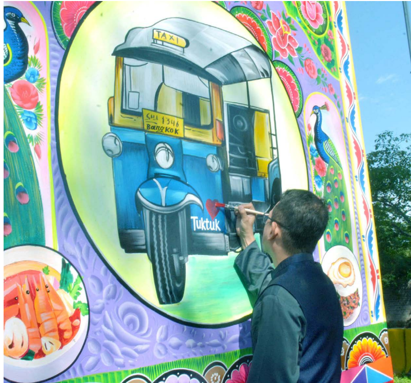
ISLAMABAD: Ambassador of Thailand Chakkrid Krachaiwong painting the wall.