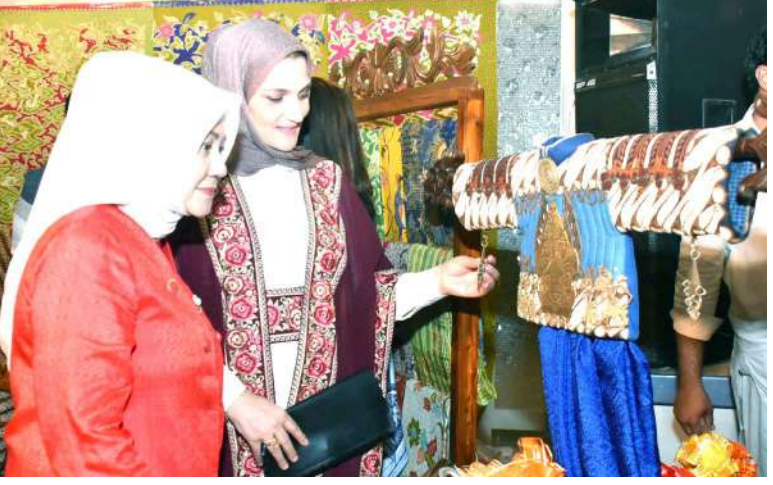
ISLAMABAD: Wives of the Indonesian and Palestine ambassadors taking interest in Batik.