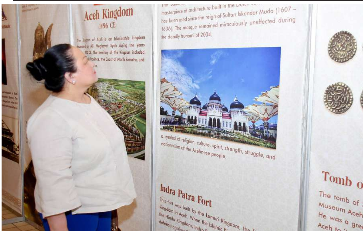
ISLAMABAD: Charge d'Affaires of Philippines Embassy witnessing photo exhibition arranged by the Indonesian Embassy at Lok Virsa.

Furthermore, he stressed that in order to cash the geo-economic benefits of the Indian Ocean; the world needs to maintain stability in the region by collectively countering the geostrategic and geo-political challenges.