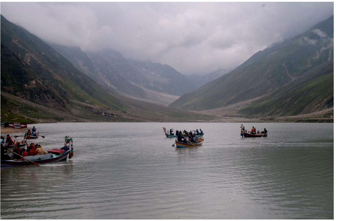
NARAN: People enjoying boat rides in Saif ul Malook lake.

shortly to facilitate the passengers. The source said the establishment of Chaman Terminal in collaboration with Federal Board of Revenue (FBR) and track renewal Sibi-Khost section was also in progress.