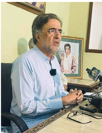
LALAMUSA: PM Adviser on Gilgit-Baltistan and Kashmir Affairs, Qamar Zaman Kaira addressing a press conference.

LALAMUSA: Advisor to Prime Minister on Kashmir Affairs and Gilgit-Baltistan Qamar Zaman Kaira called for the Apex Court to constitute a full court bench for hearing the current political and constitutional crisis in the Punjab. Addressing a press conference at Lala Musa, he said that incumbent government and its allies have their reservation over the current apex court bench which was hearing the current Punjab Chief Minister election case. Qamar expressed that the decision of full court bench would be acceptable to all political parties of the country. He criticised the role of Pakistan Tehreek e Insaf head Imran Khan who is blaming and threatening the national institutions. The Advisor blamed that the members of PML-Q have violated the direction of party head adding he said there is no space of such thing in the constitution and rejected the term of Trustee Chief Minister. To a question, Kaira said the incumbent regime and its allies will accept the court decision.