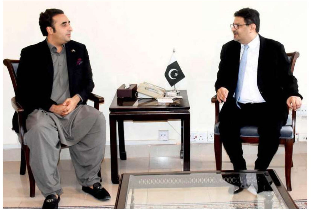
ISLAMABAD: Federal Minister for Finance Miftah Ismail held a meeting with Foreign Minister of Pakistan Bilawal Bhutto Zardari. – DNA

lations 2020 is not eliminated. It should be noted that if a property is falling under the category of non-conferring use, then the non-conferring use must be terminated before the property is transferred to the legal heirs. Similarly, the period for issuance of No Demand Certificate (NDC) issued by Estate Management-I and Estate Management-II has also been reduced to 4 days. In this regard, instructions have been issued to complete the process of issuing NDC within 4 days after submission of application. In this context, in case of any legal complication, the allottee or the applicant will be informed in time as to why the NDC is not being issued on their request. It should be noted that the present management of CDA has taken several steps for early disposal of property related issues of general public. CDA Facilitation Center has been activated and helpline 1819 has also been established to provide efficient facilities to the citizens using modern technology. These initiatives are aimed at quick resolution of citizens' problems and will also help in making CDA an effective service delivery institution.