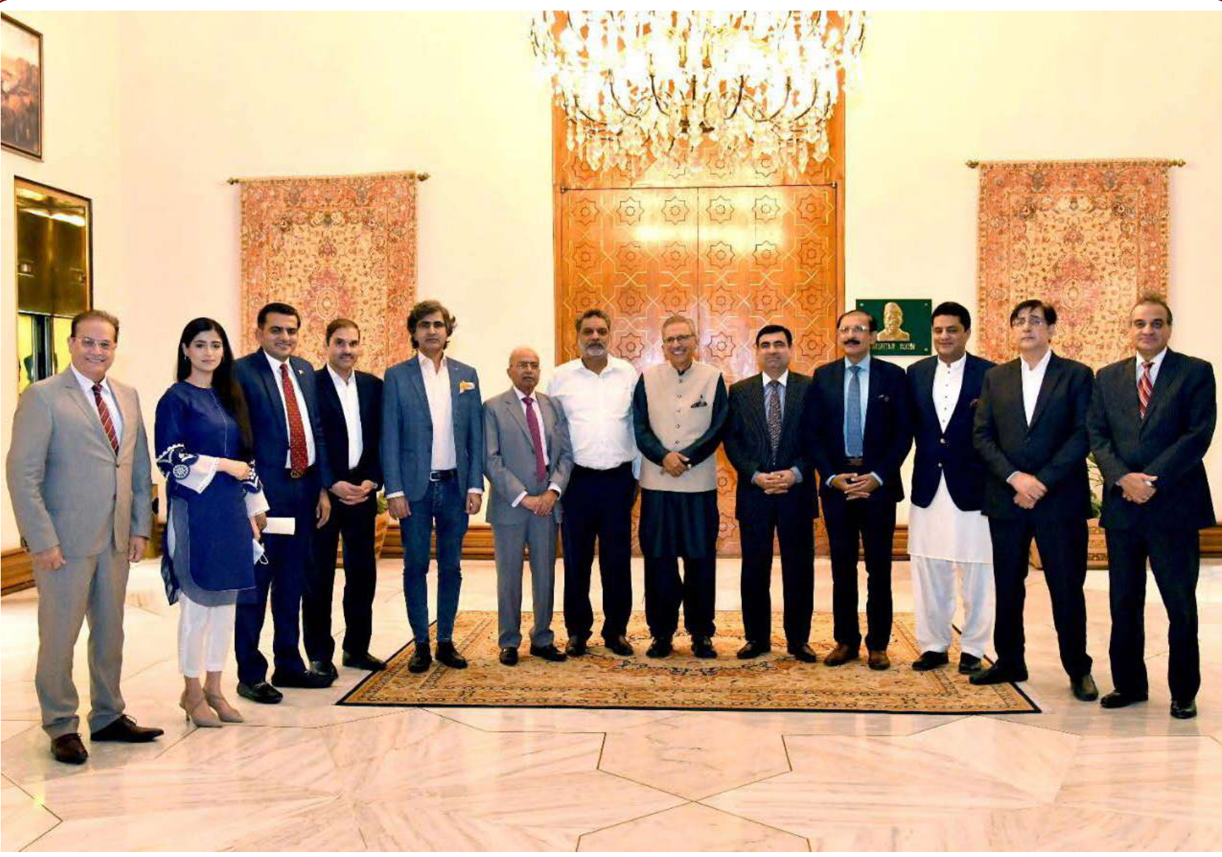
ISLAMABAD: Senior journalists in a group photo with the President Dr Arif Alvi during a media interaction at the President House on Tuesday.