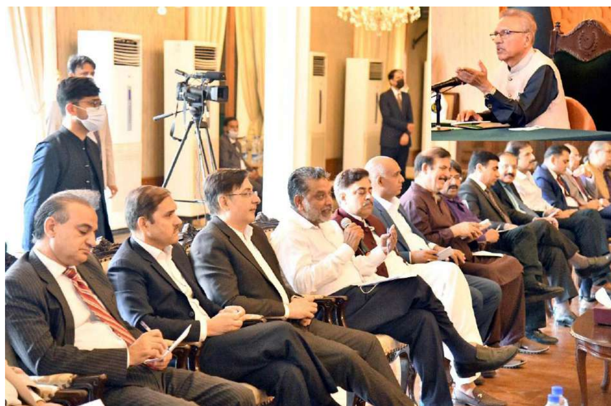
ISLAMABAD: President of Pakistan Dr Arif Alvi holding an interactive session with the senior journalist, at the President House, on Tuesday.

President Alvi further said by dissolving the National Assembly on the advice of the then Prime Minister, he in fact had acted as per the provisions of the Constitution. After getting such an advice he was bound to act. To a question about the 58 8 2 B, according to which the Presidents could dissolve the assemblies, the President said he personally was not in favour of investing so much powers in one person therefore it was good decision to do away with the 58 2 B. When the president was asked what he thinks of the suggestion that the