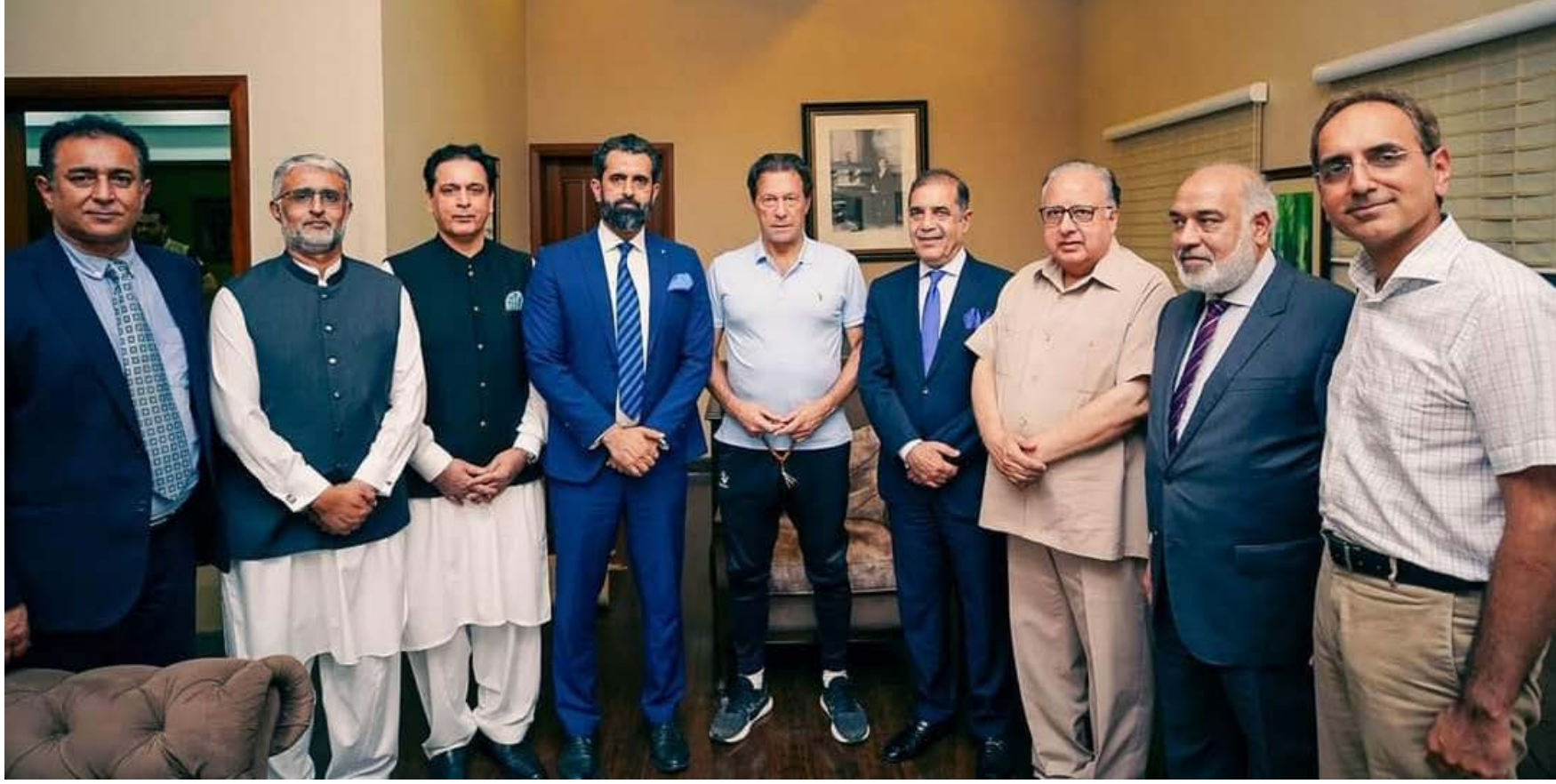
ISLAMABAD: Members of RCCI had a meeting with Former PM Imran Khan in line with campaign for Charter of Economy. Imran Khan agreed to sign a Charter of Economy to be prepared by RCCI. – DNA

The elections will be the fourth in two years for Bulgaria, which has been marred by political instability since Prime Minister Kiril Petkov's government was toppled in a no-confidence vote last month. Svelenski's announcement came after a parliament vote on a governance plan drawn up by the BSP, Petkov's We Continue the Change (WCC) and Democratic Bulgaria was shelved. The vote was opposed by the coalition of the former ruling party GERB and the Union of Democratic Forces (UDF), along with the Movement for Rights and Freedoms, There Is Such a People (ITN) and Vuzrazhdane.