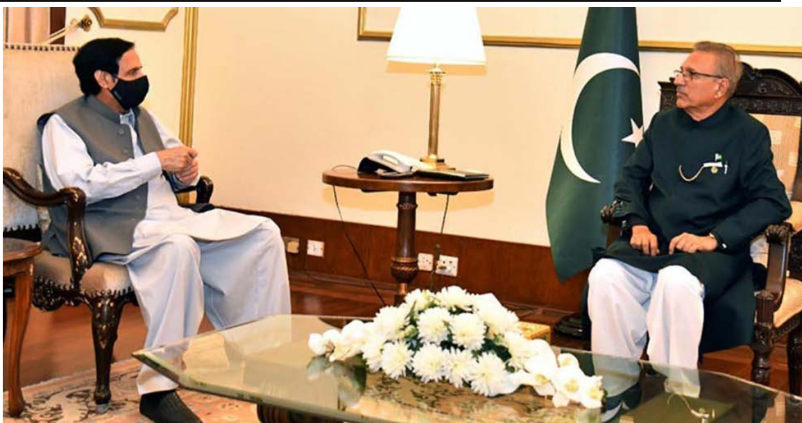
ISLAMABAD: Chief Minister-Elect, Chaudhary Pervaiz Elahi called on President Dr Arif Alvi before oath taking ceremony, at his chamber at Aiwan-e-Sadr.