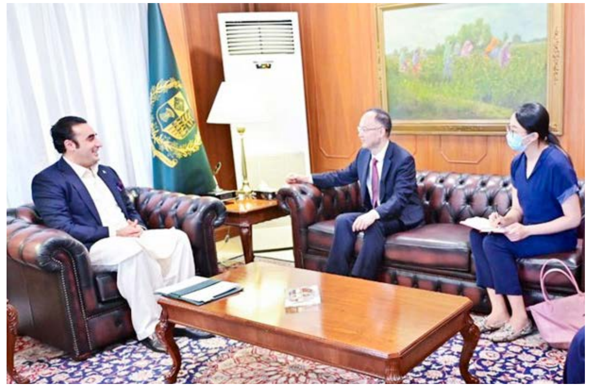
ISLAMABAD: Foreign Minister Bilawal Bhutto Zardari and Chinese ambassador to Pakistan Nong Rong exchanging views during a meeting.

Marketing Company, Zamoung Textile Company, Al Hayat Groups of Companies, NSB Bearing (Pvt) Limited, City University of Science and IT, Malik Group of Travels and Tours, Makka Agency, Shakir and Associates, Malik and Associates, R-Sheen Fashion Paradise and AYS International. Similarly, for the year 2020-21, as many as 12 business organizations were awarded trophies for best performance in industrial and commercial sectors that's include Gadoon Textile Mills Limited, Cherat Cement Co Limited, Top Stars Industries (Pvt) Limited, Khalid Nawaz Enterprises, Daudsons Armoury (Pvt) Limited, Aziz Oil Solvent Extraction (Pvt) Limited, Sohail Associates, Sher Ali & Sons Seed Company, Jan and Sons, 091 Mall, MKB Pharmaceutical (Pvt) Ltd, and Jolly Collection. On the sideline of the conferences, the SCCI's and different chambers of commerce and industry signed Memorandum of Understandings (MoUs), aiming at promoting mutual trade, launching joint ventures, collaboration in various sectors, establishing close liaison between the business community and attracting foreign investment in KP.