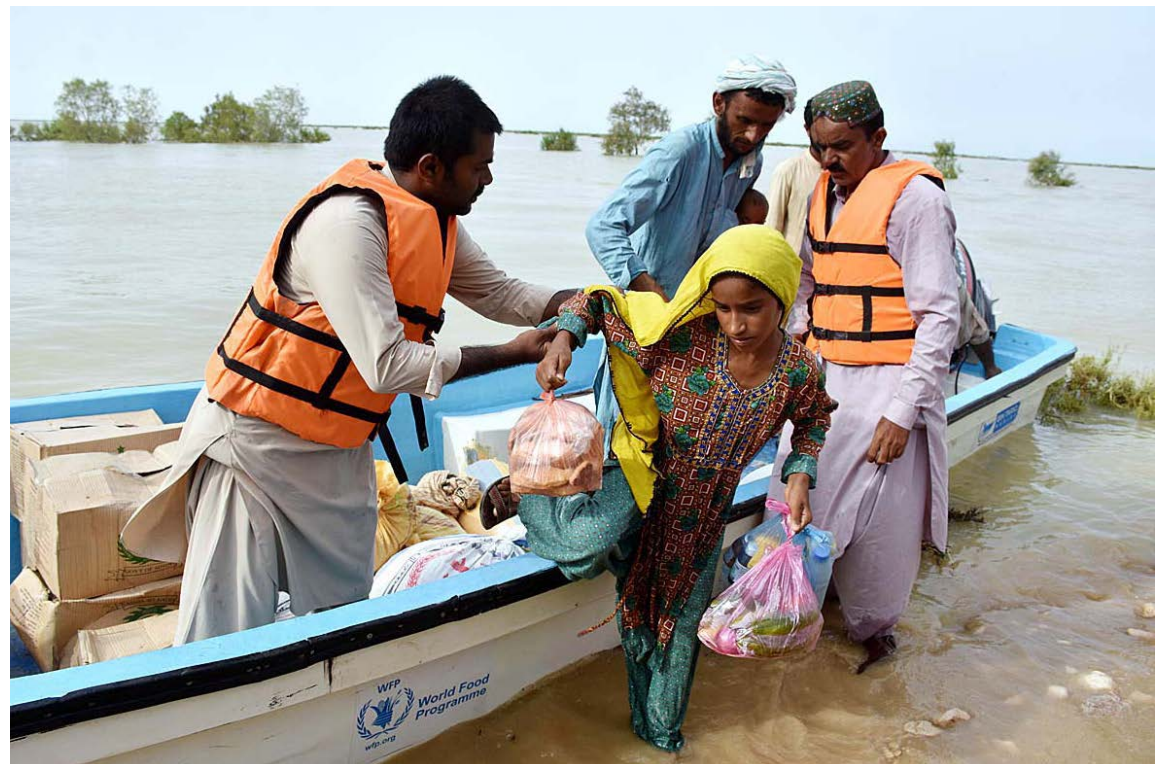
LARKANA: Rescue personnel shifting the flood affected people to the safer places by boat during flood relief operations in flood affected Kacha area of Qubo Saeed Khan.