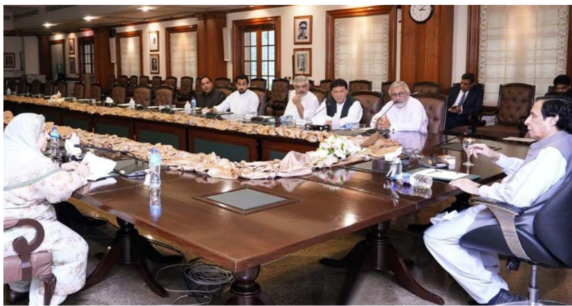
LAHORE: Ch. Pervaiz Ilahi, Chief Minister Punjab presided over the meeting to review relief activities in flood-affected areas.