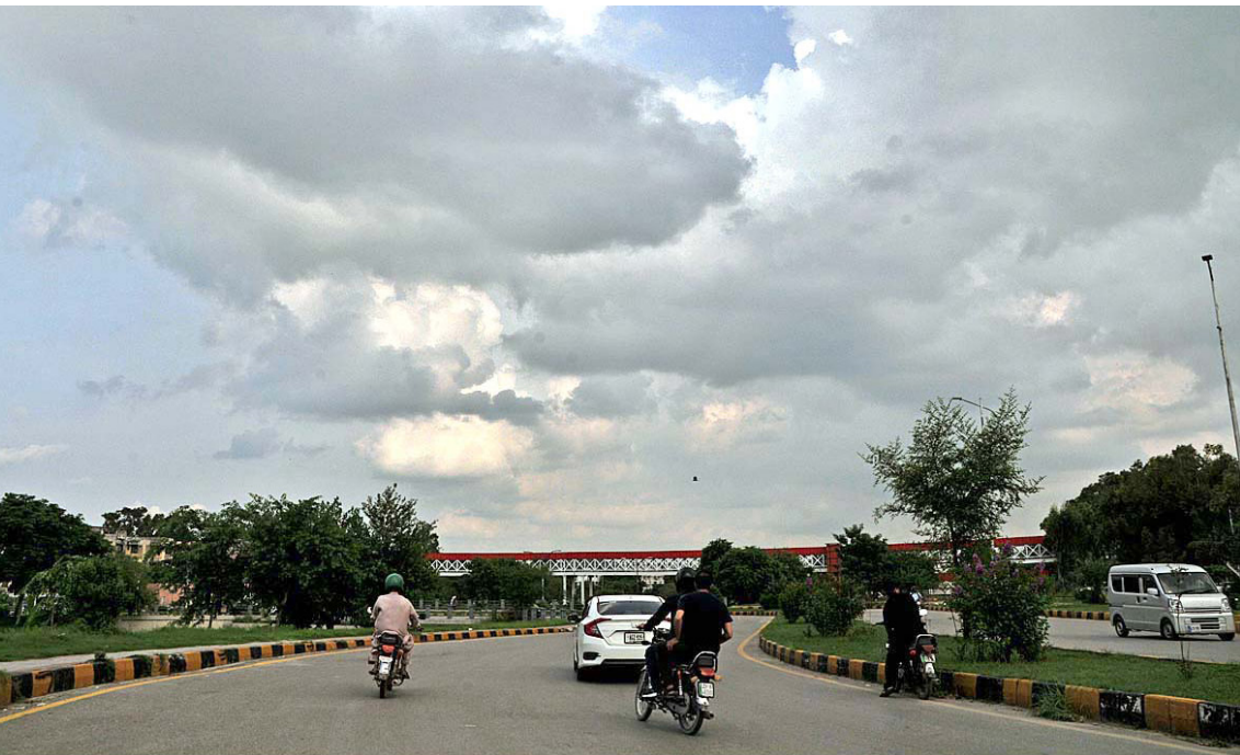
ISLAMABAD: Thick clouds hovering over federal capital at G8 area.