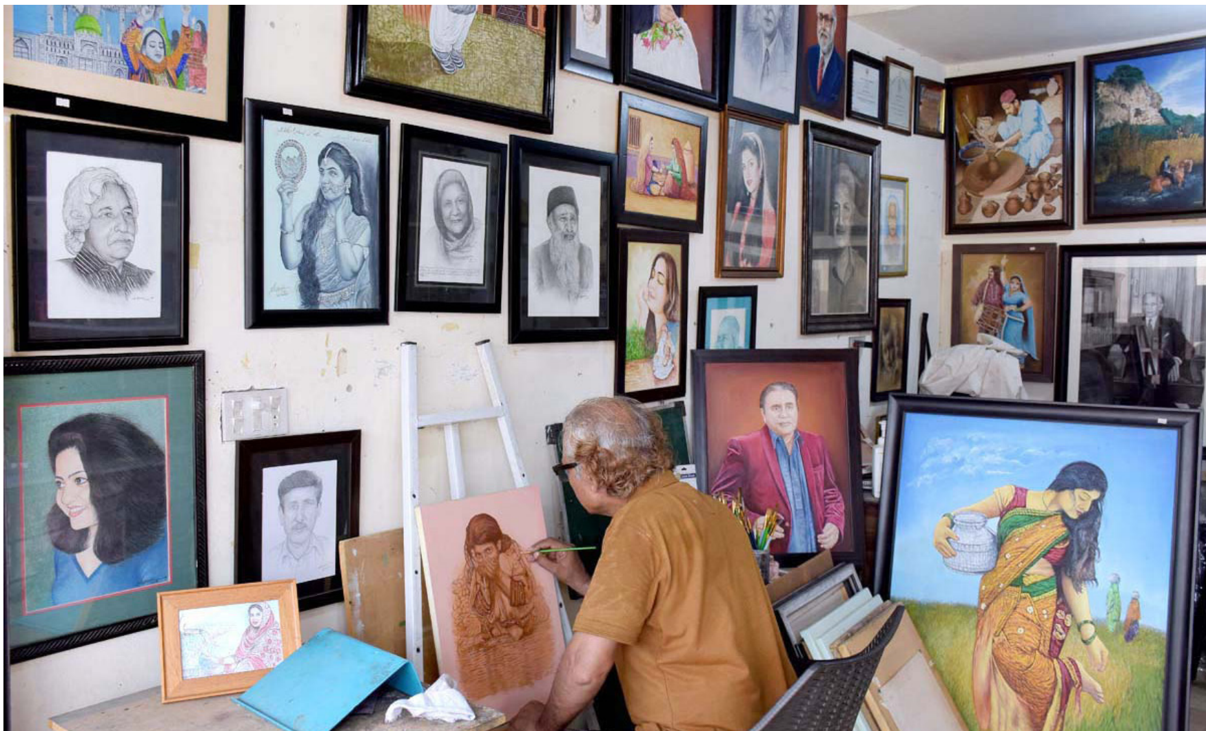
ISLAMABAD: An artist giving final touches to artwork at his workplace in Lok Virsa.