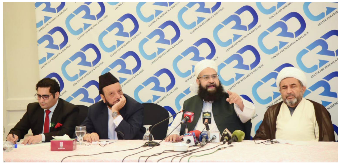
ISLAMABAD: Special Representative to the PM on Interfaith Harmony, Hafiz Tahir Ashrafi addressing at a dialogue held in connection with National Day of Minorities.

and miserable in big cities in the country. Cholistan is one of the most affected areas, which is going through acute shortages of water. People are suffering and losing their sources of livelihood, e.g. livestock. Sixty percent of the population of Pakistan is directly or indirectly reliant upon rain-fed agriculture that depends on predictable weather patterns. Global climatic change affects its agriculture and its impacts seem to increase daily. Therefore, Pakistan should seek cooperation with China on diverse sectors of agriculture production, climate change, water conservation, cultivation of hybrid crops, scientific cooperation to mitigate spillo-