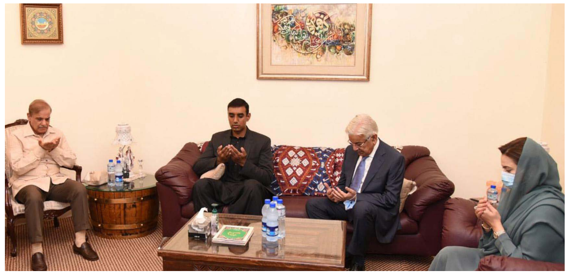
RWALPINDI: Prime Minister Shehbaz Sharif offers Fatiha for Lt General Sarfraz Ali, who got martyred in Balochistan helicopter incident, at his residence. Minister for Defence Khawaja Asif and Minister for Information Marriam Aurangzeb also accompanied the Prime Minister.

Minister Rehman remarked, "Countries are enhancing their climate literacy and seeking to decarbonize their production cycle. Everybody is looking at the nature to go back to default, which is not happening, it will not, not on its own. We have to reset priorities to level up our resources and face climate disasters head-on. The provinces, too, will need to scale up. Our ambit is to provide them with policy guidelines. We need to build green technology and goals, and we would appreciate initiatives from the Tech companies. Many companies are merely greenwashing their pollution by funding projects to merely tick boxes with a dash of CSR. This needs to stop. Companies with innovations and technology to help deal with this climate crisis are welcomed and should come forward. A company's climate plan should not stop at decarbonization; rather, it should start there. Transparent & ethical sourcing of materials, environmentally conscious manufacturing practices, waste-conscious packaging, shipping choices negating carbon footprint are just a few ideas of sustainable practices."