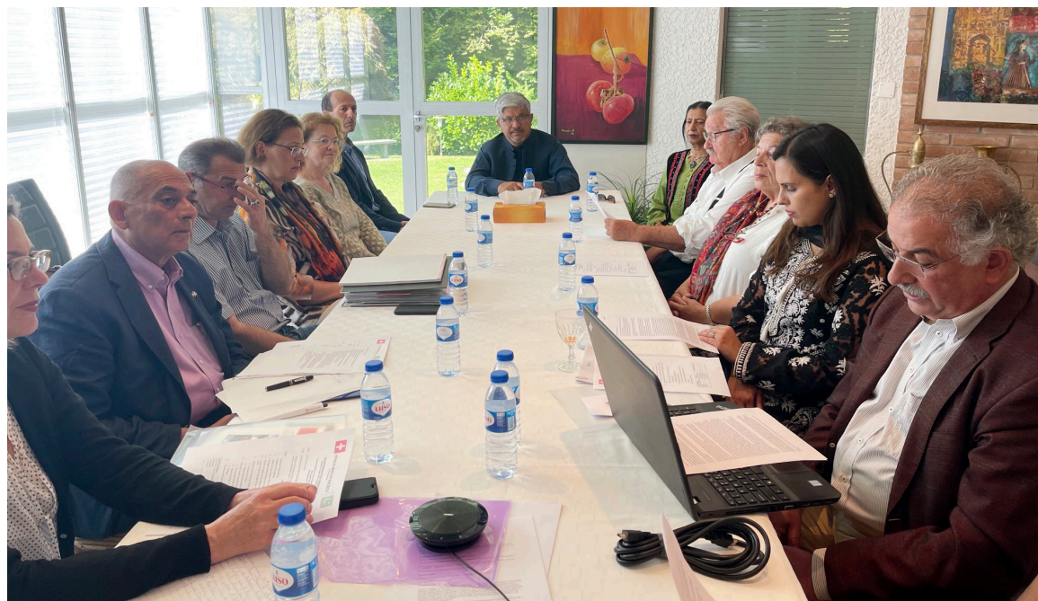
BERN: Pakistan ambassador to Switzerland, Aamir Shouket hosted the annual general meeting of Swiss Pakistan Society at Pakistan House Bern. Embassy will be organizing series of events to promote Pakistan in Switzerland in the coming months. - DNA

The run-of-river facility is one of the early-harvest clean energy projects under China-Pakistan Economic Corridor (CPEC). Gezhouba Group, China is implementing the project at around $2 billion. Also, the 5-kilometre-long relocated portion of National Highway 15 (N-15) is open to traffic. The existing portion of N-15 will submerge in the reservoir of the Suki Kinari hydropower project; therefore, the new road was constructed at a higher elevation. The new road also has a 411-metre-long tunnel. The project is expected to complete by the end of 2023 or mid 2024, an official said.