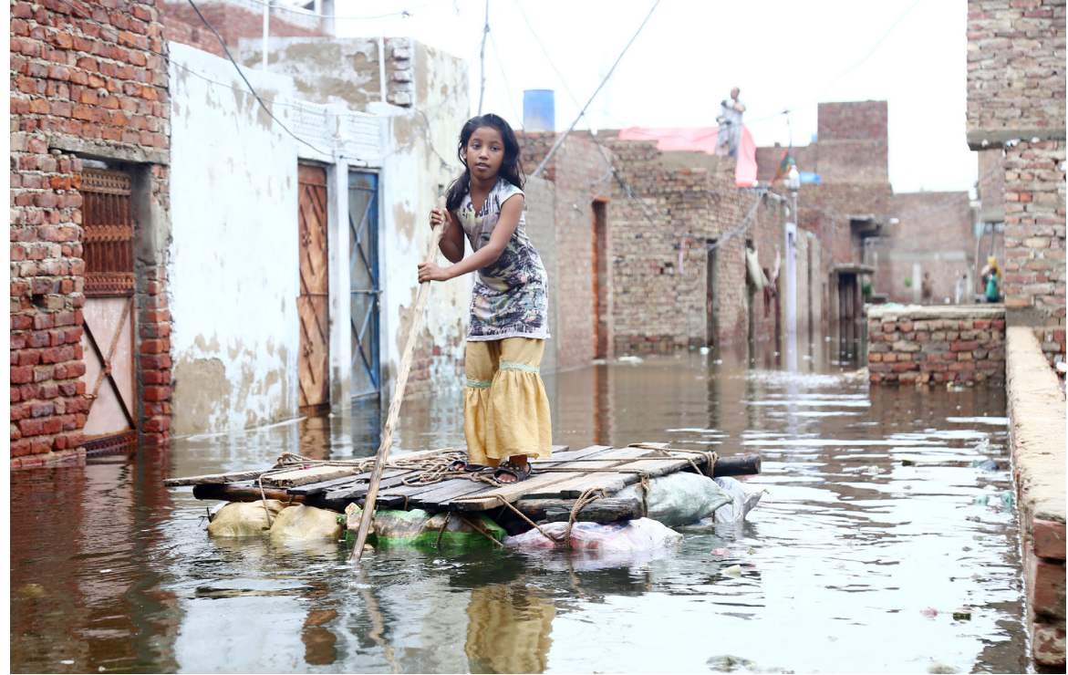
HYDERABAD: A girl trying to reach her destination by using a make-shift boat as rain inundated most parts of the Hyderabad city.

Pakistan rejects India's false allegations