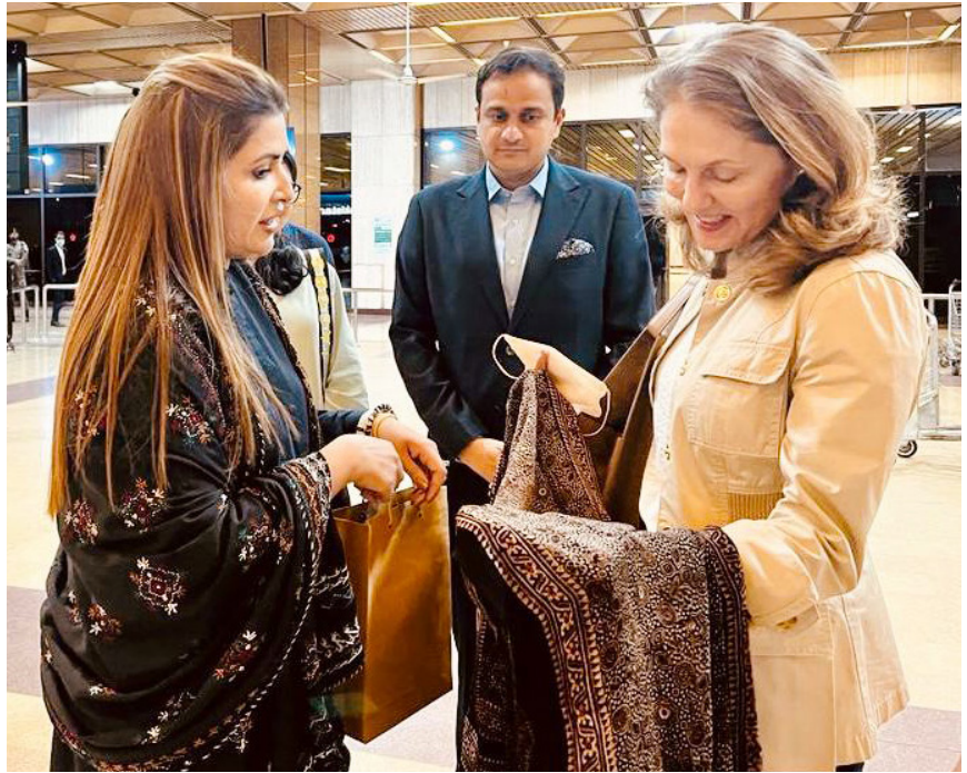
KARACHI: The Princess of Jordan Sarah Zeid, who is also the WFP Ambassador and Special Advisor on Nutrition, arrived in Pakistan. She was received by Minister for Poverty Alleviation Shazia Marri.