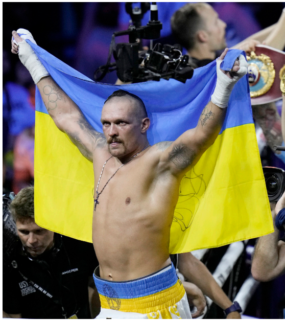
"I just spoke from my heart. It has been so tough," Joshua said afterwards, adding: "It takes real strength and tonight there's a little crack in the armour." The judges scored it 113-115, 115-113 and 116-112 for Usyk as Joshua narrowed the gap but was still found wanting.

The fight was watched on free-to-air TV by millions of Ukrainians living under the Russian invasion. Usyk signed up to fight for his country before accepting the rematch. "I give this victory to my country, to my family, to my team and to all the military who are defending the country," he told the 12,000-seat King Abdullah Sports City Arena in Jeddah. An angered Joshua hurled down Usyk's belts and peppered his post-fight speech with expletives despite the presence of Crown Prince Mohammed bin Salman, de facto ruler of the deeply religious country.