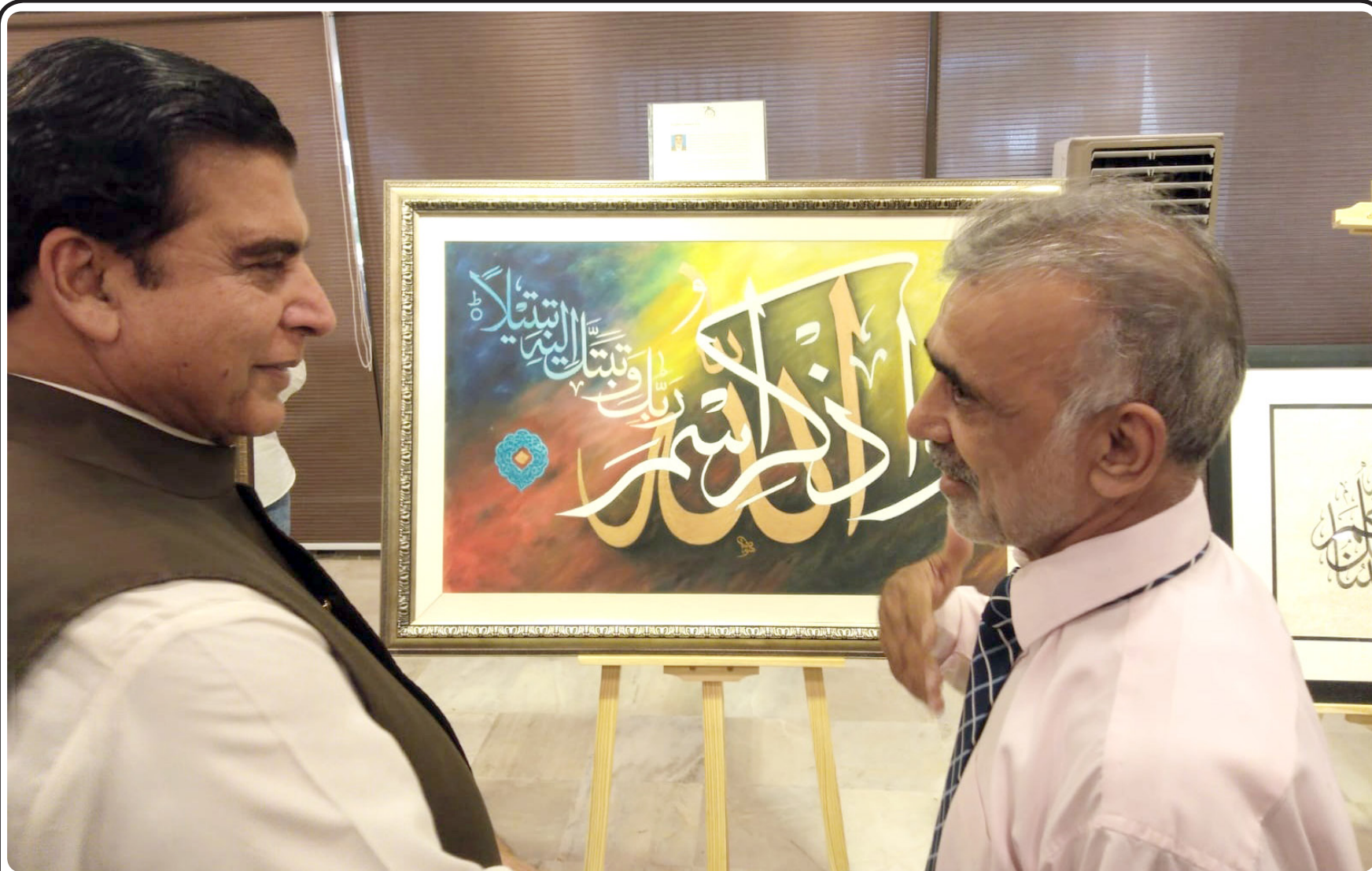
ISLAMABAD: Speaker National Assembly Raja Pervez Ashraf witnessing a paintings exhibition at the Parliament House. The exhibition featured paintings of Shabbir Ahmad Zia, instructor Calligraphy National Council of Arts, Pakistan. Shabbir briefed the National Assembly Speaker about his works.