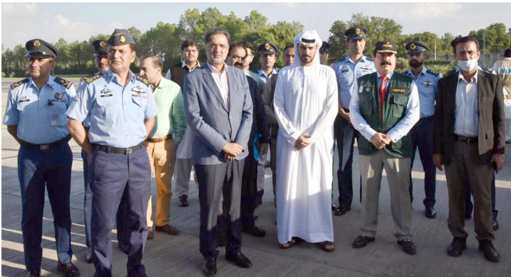
ISLAMABAD: Prime Minister Adviser on Gilgit Baltistan and Kashmir Affairs Qamar Zaman Kaira received relief goods from UAE at the Nur Khan Air Base.