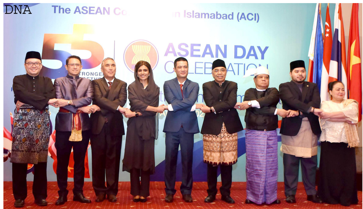
ISLAMABAD: Hina Rabbani Khar, State Minister for Foreign Affairs, Ambassadors and High Commissioners of the ASEAN member states posing for a picture on the occasion of 55th ASEAN Day celebrations.