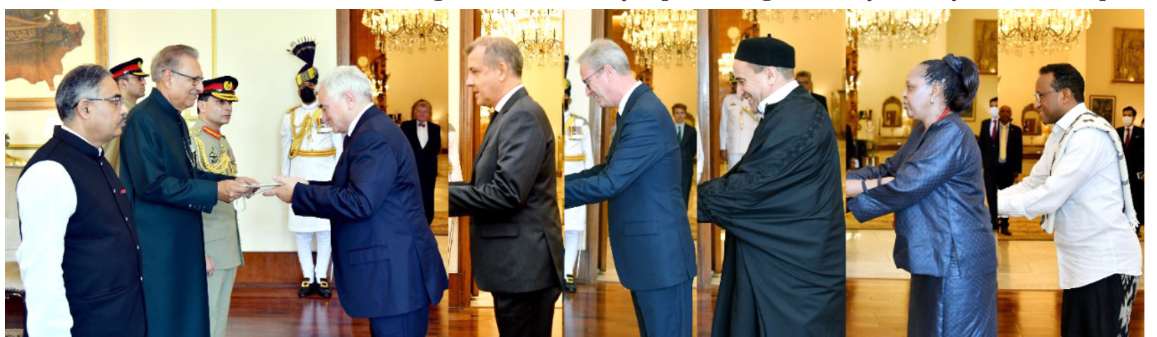
ISLAMABAD: Newly-arrived Ambassadors of Germany, Spain, Belgium, Libya, Kenya and Ethiopia presenting credentials to the President of Pakistan Dr. Arif Alvi.