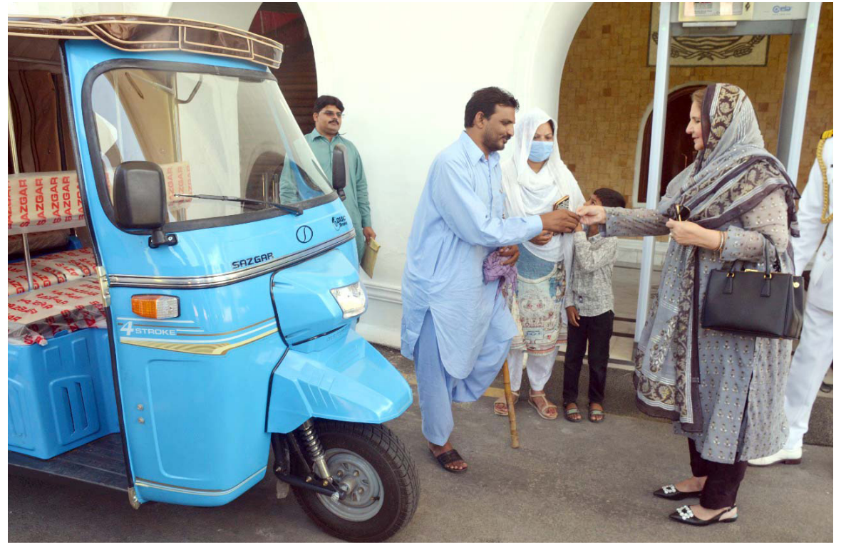
LAHORE: First Lady Begum Samina Arif Alvi giving the key of a rickshaw to a differently-abled person, at Governor's House, Lahore.