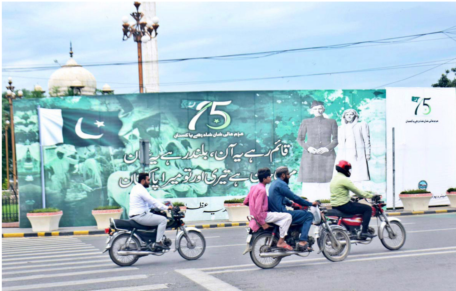
LAHORE: Mall road decorated with huge posters of diamond jubilee on 75th Independent Days of Pakistan.