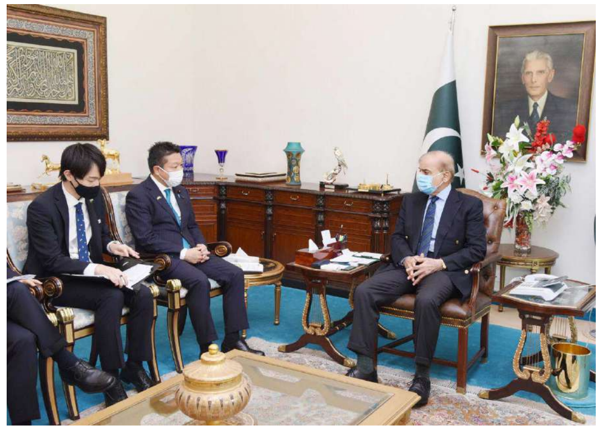
ISLAMABAD: Prime Minister in a meeting with Parliamentary Vice Minister for Foreign Affairs of Japan Honda Taro.

Australian HC grieved over Helicopter incident