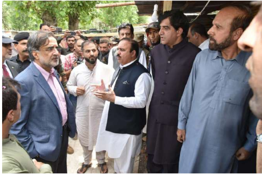
ister had given special directives to ensure immediate response in this regard. "All-out efforts will be made to protect the Kashmiri brethren. There is a need to de-

MUZAFFARABAD: Advisor to the Prime Minister on Kashmir and Gilgit-Baltistan Affairs Qamar Zaman Kaira on Wednesday said the federal government was ready to extend all possible cooperation to the Azad Jammu and Kashmir (AJK) government to help the flood victims. "Quick and easy payment of relief funds to the victims will be ensured and all-out efforts will be made to protect the people," he said during a one-day visit to Muzaffarabad after a briefing given by State Disaster Management Authority (SDMA) about damages and measures taken for mitigating floods due to monsoon rains. Kaira said climate change had become a potent challenge to the world including Pakistan and the government was ready for all kind of cooperation to prevent losses caused by floods. The Ministry of Kashmir Affairs would provide all possible cooperation to AJK government in this regard, he said, adding that the ministry had also been working to allocate to separate budget for relief assistance to flood affectees. Kaira said the AJK government should inform the center of its needs to combat climate change as the prime min-