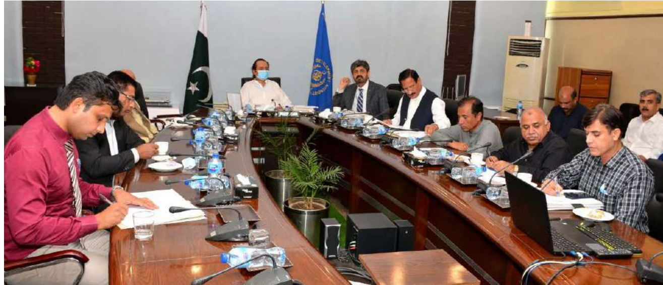
of Margalla Hill Sanctuary Park Islamabad after addressing the reservations of the Planning Commission. The project will be carried out in collaboration of IWMB for the care and protection & preservation of flora and fauna. It will be managed by IWMB. The meeting also approved PC-II to hire consultants for establishment of Capital Medical College in Capital Hospital Islamabad.

ISLAMABAD: Dated 3rd August, 2022: 58th meeting of Capital Development Authority DWP was held at CDA Headquarters under the chairmanship of Chairman CDA. The meeting was attended by officers from relevant departments. Several projects were presented for approval in the meeting, which were approved after a detailed deliberation. According to the details, the Nilor Heights revised project was approved in the CDA-DWP meeting. One component of the Nilor Heights project is low-cost and the other is high-end. The high-end category will cost Rs. 7000 per square feet. The project is being completed through FWO which was approved by the Federal Cabinet. Similarly, the Islamabad bus service project for the entire city of Islamabad was also approved in the meeting. It will cost Rs 7240.62 million. This project will help in fulfilling future traveling needs in Islamabad. In this regard, 8 different routes were approved. Moreover, the meeting approved the creation