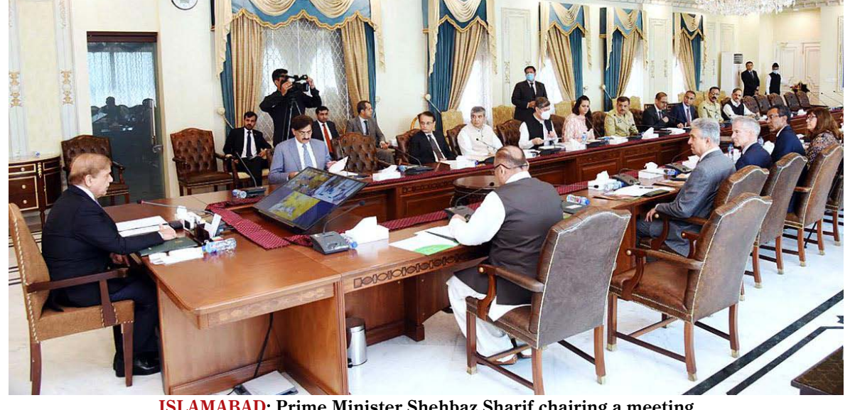
ISLAMABAD: Prime Minister Shehbaz Sharif chairing a meeting of National Task Force for Polio eradication.