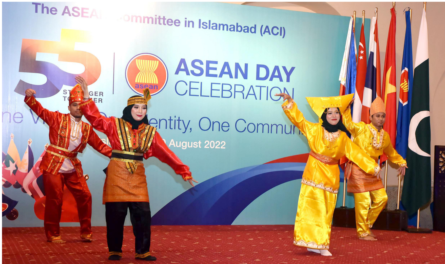
ISLAMABAD: Artists from Indonesia perform during 55th Asean Day celebrations, at Islamabad Serena Hotel. — DNA

ISLAMABAD: The number of 3G and 4G service users in Pakistan has increased significantly and reached 119 million by the end of July 2022. According to the details available on PTA's official site, the number of active mobile SIMs reached 195 million during the same period. The number of broadband subscribers reached 122 million while broadband penetration was recorded at 55.17 per cent. — APP