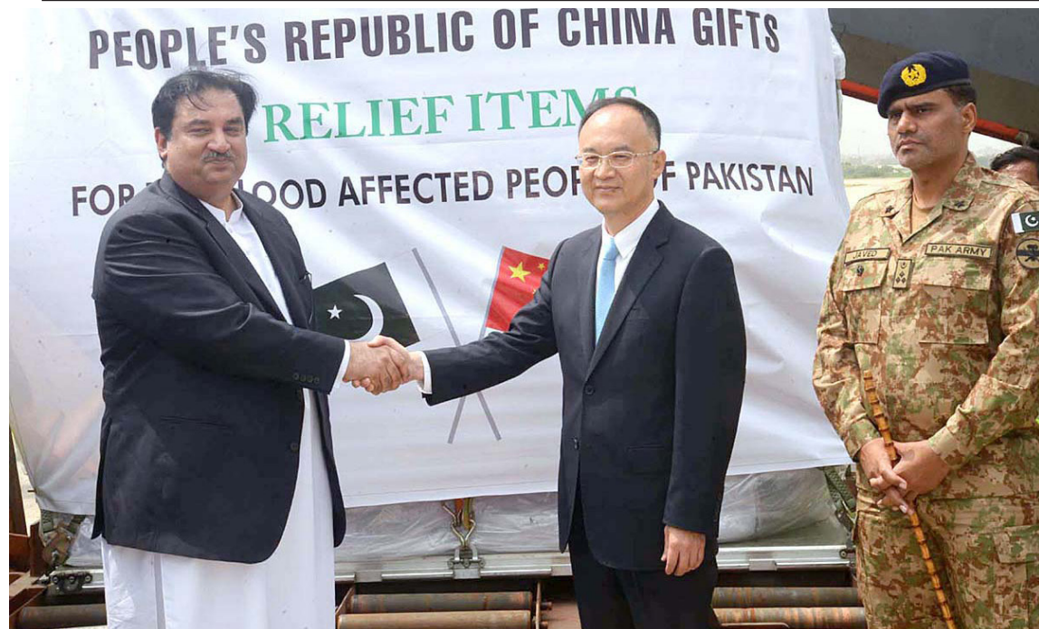
KARACHI: Federal Minister for Power Engr. Khurram Dastgir Khan receiving relief items from China Government for the flood affected people of Pakistan at Karachi Airport.

ISLAMABAD: After the IMF approved a $1.1 billion loan to bail Pakistan out, the rupee surged Rs1.8 against the US dollar in the interbank trade. According to data released by the State Bank of Pakistan on Tuesday afternoon for interbank trading, the rupee closed out the day at Rs220.12. The data showed that the rupee, which had sunk to Rs221.92 on Monday, regained 0.82% ground against the greenback. Earlier during trading on Tuesday morning, the rupee gained as much as Rs1.42. The appreciation meant that a US dollar was being traded for Rs220.50. However, the value of rupee appreciated by 0.82% in the interbank by the end of the day. This is up from Rs221.92, at which the US dollar was traded at the close of the interbank market on Monday. The anticipation of the loan had earlier in the month seen the rupee appreciate by as much as Rs26. But the rupee then lost nearly Rs8.02 due to weak reserves and growing political uncertainty.