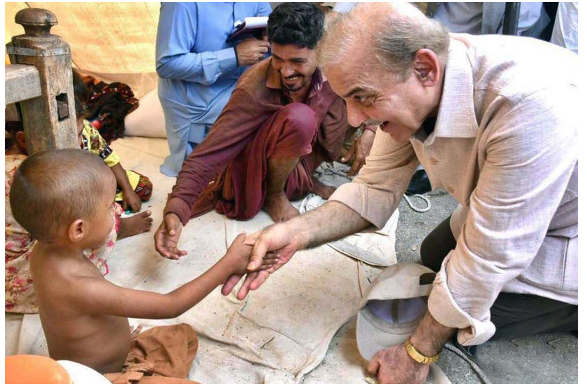
JAFFARABAD: Prime Minister Muhammad Shehbaz Sharif interacting with flood victims in Village Haji Allah Dino. - DNA