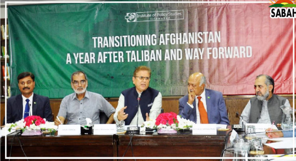
Institute of Policy Studies (IPS). The in-camera address by Ambassador Sadiq to a select gathering of Islamabad's intelligentsia based on Chatham House rules, aimed at assessing the actual picture

These views were reflected in a heart-to-heart discussion followed by a keynote speech of Ambassador (r) Mohammad Sadiq, special assistant to the prime minister/ minister of state and Pakistan's special representative for Afghanistan in a roundtable titled "Transitioning Afghanistan" at