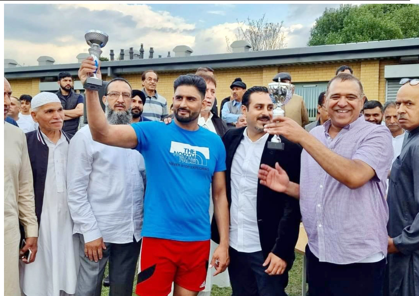
LONDON: A Kabaddi match was held at Bassilah celebration of independence at Bradford UK. The Bradford club won the match. – DNA

TUNIS: Tunisia summoned its ambassador from Morocco on Saturday amid a dispute over a visit to the North African nation by the head of the Polisario Front that is seeking independence of the Western Sahara. The move came one day after Morocco recalled its envoy from Tunisia in protest of a meeting between President Kais Saied and Brahim Ghali ahead of the Tokyo International Conference on African Development (TICAD) summit, due to open on Saturday. Morocco termed Ghali's invitation as "a serious and unprecedented act, which deeply offends the feelings of the Moroccan people and its forces." Rabat said it will not attend the two-day summit in response to the Tunisian move. Responding to the Moroccan statement, the Tunisian Foreign Ministry said it was "surprised" by the Moroccan reaction.