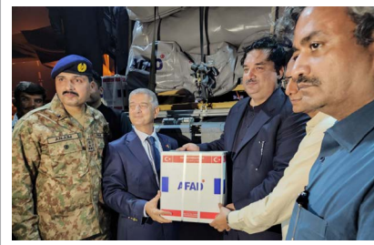
KARACHI: Relief goods from Turkiye arrived in Karachi, on Sunday.

ISLAMABAD, Minister for Information and Broadcasting Marriyum Aurangzeb on Sunday said fifteen more plane loads of relief goods from the United Arab Emirates (UAE) would arrive in Pakistan in the coming days.