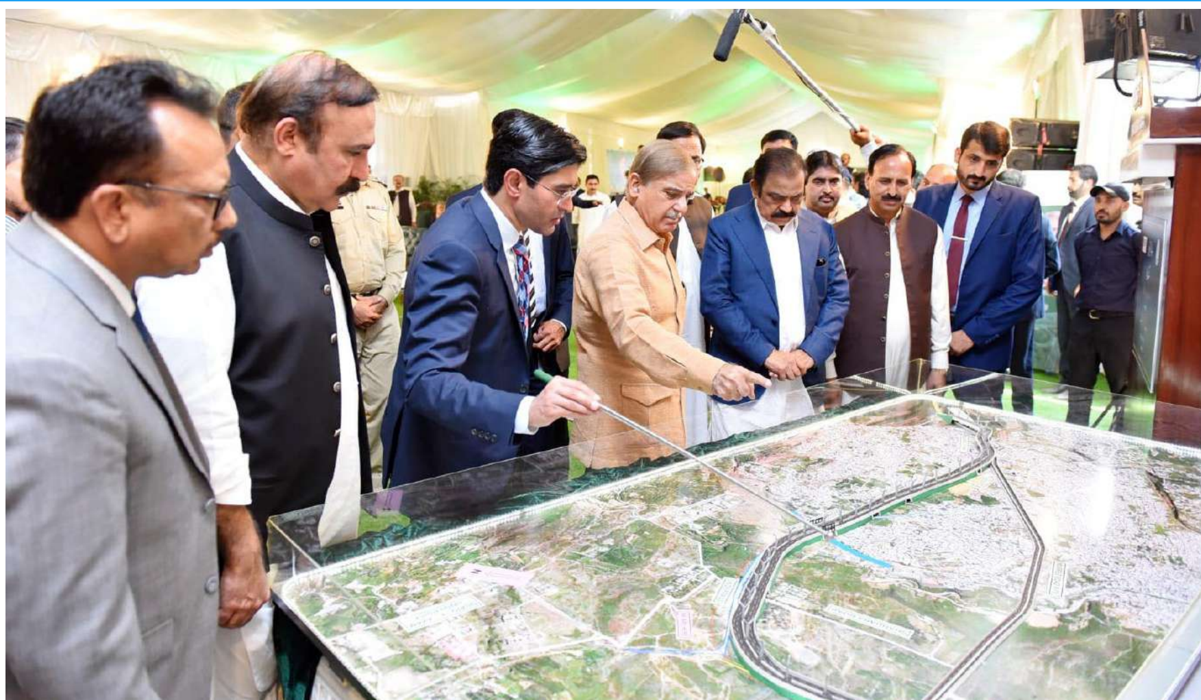
ISLAMABAD: Prime Minister Muhammad Shehbaz Sharif is being briefed on Bara Kahu Bypass.

LONDON: The UK said on Friday it "will never recognize" the referendums on joining Russia recently held in four Ukrainian regions. Prime Minister Liz Truss said she spoke with Ukrainian President Volodymyr Zelenskyy to underline the UK's support against "Russia's sham referendums." Truss said in a statement that Russian President Vladimir Putin has "once again acted in violation of international law with clear disregard for the lives of the Ukrainian people he claims to represent." "The UK will never ignore the sovereign will of those people and we will never accept the regions of Donetsk, Luhansk, Kherson and Zaporizhzhia as anything other than Ukrainian territory," she said. "Putin cannot be allowed to alter international borders using brute force. We will ensure he loses this illegal war." On Sept. 23-27, Ukraine's separatist regions of Donetsk and Luhansk and Russian-controlled parts of Zaporizhzhia and Kherson held referendums on joining Russia.