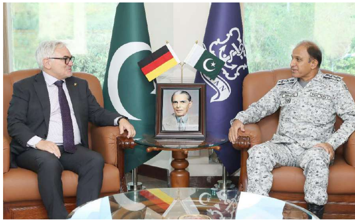
ISLAMABAD: German Ambassador to Pakistan Alfred Grannas calls on Naval Chief Admiral Amjad Khan Niazi. - DNA

KYIV: Ukraine on Friday blamed Moscow for shelling a convoy of civilian cars in the southern Zaporizhzhia region that killed at least 23 on the front line. Zaporizhzhia regional governor Oleksandr Starukh said the strikes had also injured 28 people, "all civilians, local people." A pro-Kremlin official in Russian-occupied region of Zaporizhzhia blamed Kyiv and denied the Russian army was behind the attack. "The regime in Kyiv is trying to portray what happened as shelling by Russian troops, resorting to a heinous provocation," Vladimir Rogov said on social media, accusing Ukrainian troops of carrying out a "terrorist act". The Zaporizhzhia governor said Russian forces "launched a rocket attack on a civilian humanitarian convoy on the way out of the regional centre." "People were standing in line to leave for the temporarily occupied territory, to pick up their relatives and to take away aid," he said on social media. Governor Starukh also posted a photograph, showing two rows of crumpled cars and several corpses lying nearby. - APP