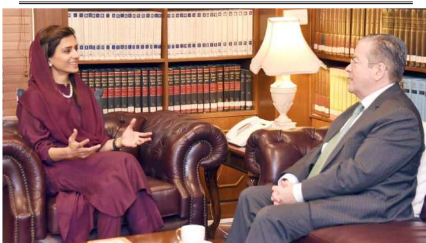
ISLAMABAD: Ambassador of France Nicolas Galey calls on State Minister for Foreign Affairs Hina Rabbani Khar.