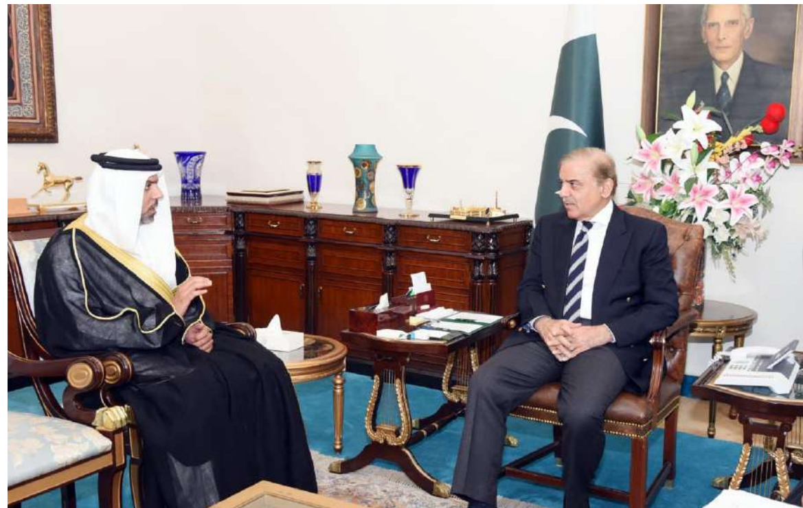
ISLAMABAD: The Ambassador of the United Arab Emirates, Hamad Obaid Ibrahim Salem Al-Zaabi, calls on Prime Minister Muhammad Shehbaz Sharif.