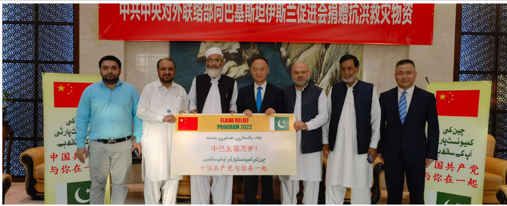
ISLAMABAD: PISLAMABAD: Amir Jamate Islami Sirajul Haq and others meeting with the Chinese Ambassador Nong Rong.