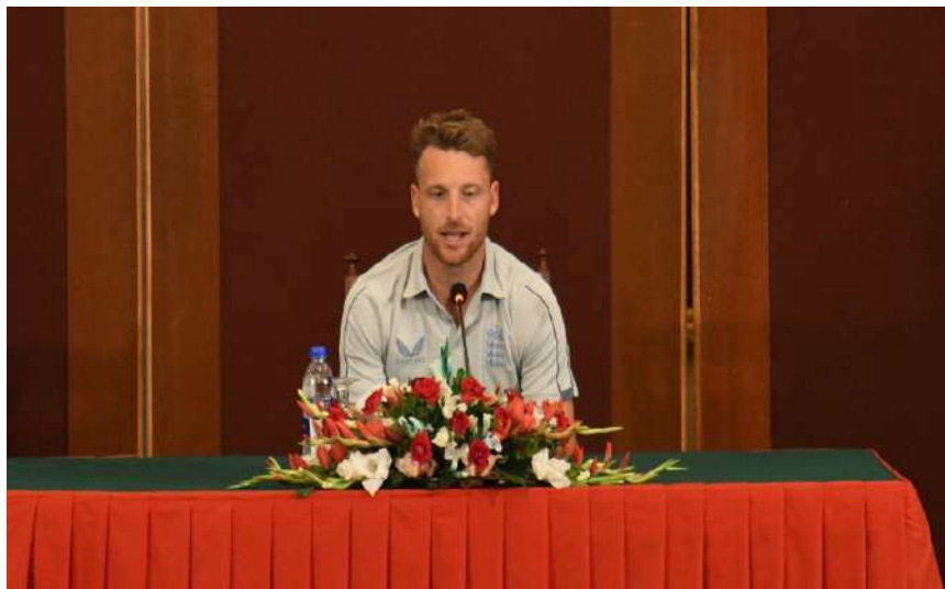
(PSL) this year and would know local conditions.

He said seven of his squad – David Willey, Phil Salt, Will Jacks, Liam Dawson, Harry Brook, Luke Wood and Ben Duckett – had featured in the Pakistan Super League