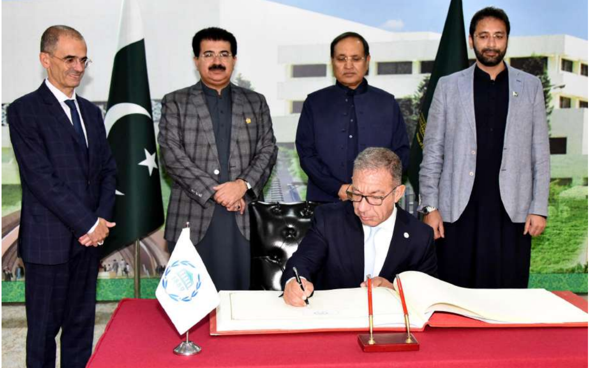
ISLAMABAD: Duarte Pacheco, President of Inter-Parliamentary Union (IPU) recording his comments on visitors book placed at Senate of Pakistan.

security, particularly in the countries most vulnerable to climate change and natural disasters,' said Minister of International Development Anne Beathe Tinnereim. Some NOK 13.5 million of Norway's support for the flood victims will be channelled through the World Food Programme (WFP) to be used for food security measures, including cash transfers. 'This funding will help to alleviate the immediate food needs of the most vulnerable people, and support efforts to establish more climate-resilient food production,' said Ms Tinnereim. The disaster has had a major impact on health needs, and has for example increased the risk of waterborne diseases such as cholera and diarrhoea. Already vulnerable groups are now facing even greater health risks, and the support Norway is providing will therefore be targeted towards protecting those most in need. Norway's support will be channelled through Norwegian Church Aid, Norcap, the World Health Organization (WHO), the United Nations Population Fund (UNFPA), and